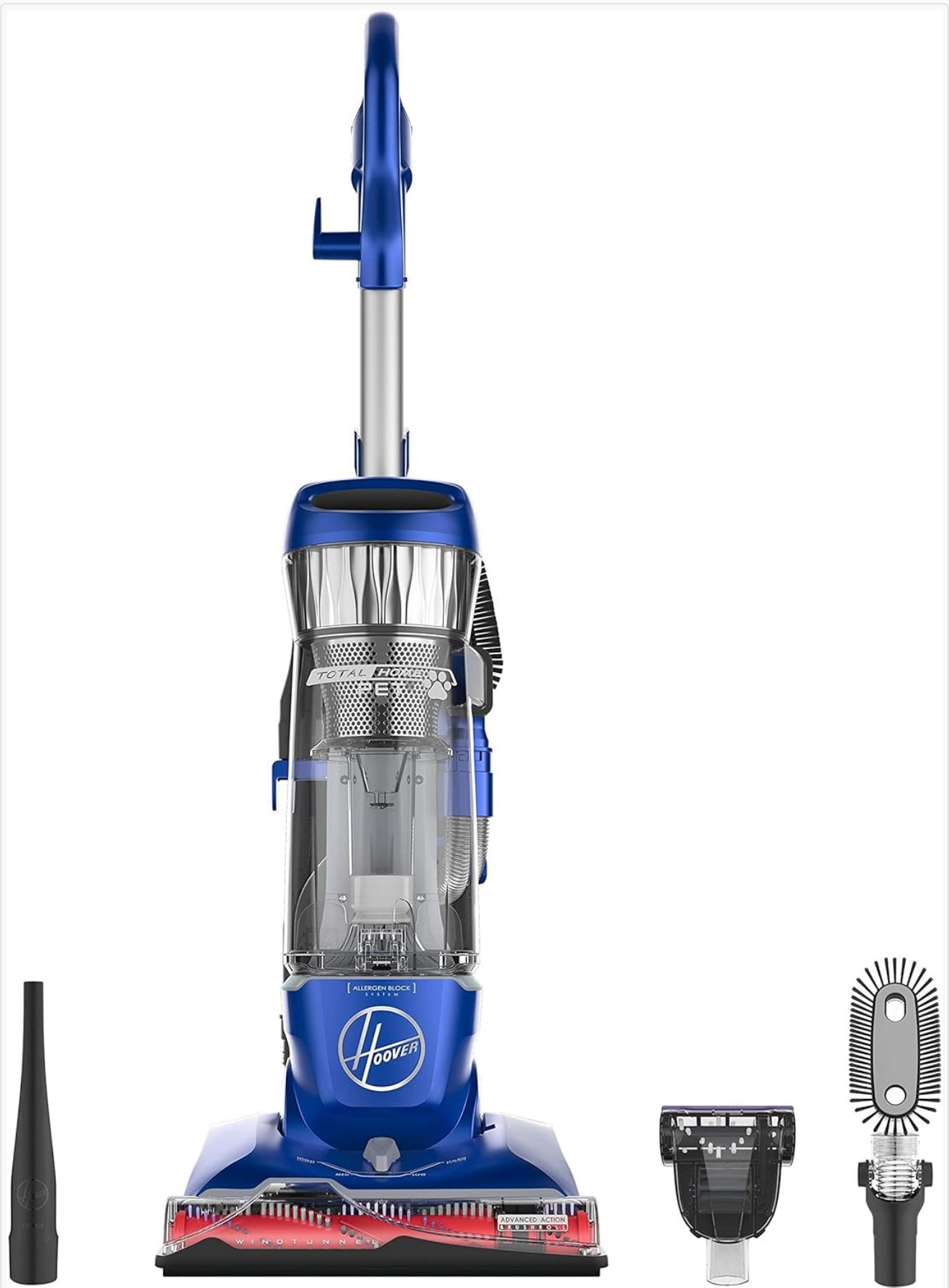
Figure 2.1: The Hoover Total Home Pet MaxLife Upright Vacuum Cleaner shown with its main body, handle, and various cleaning attachments including a crevice tool, dusting brush, and pet turbo tool.