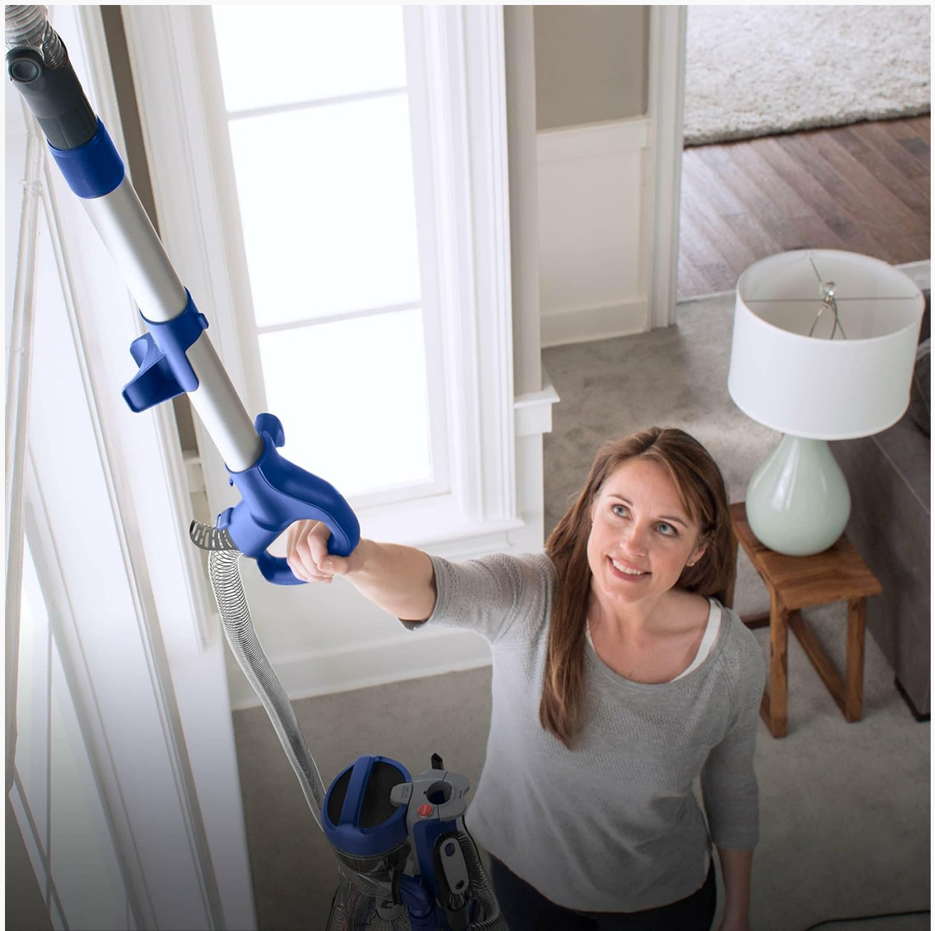
Figure 3.1: A user demonstrating the use of the Quick Release Cleaning Wand to clean elevated surfaces, highlighting the vacuum's versatility for above-floor tasks.