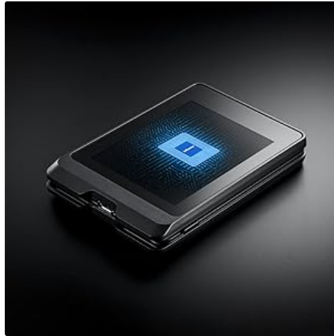
Image 6.3: The Infineon Security Chip, a military-grade secure element, embedded in the SecuX W10.