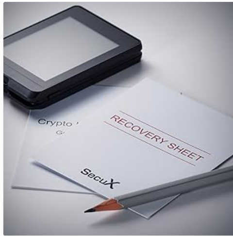
Image 5.1: Example of recovery phrase cards. Store these securely.