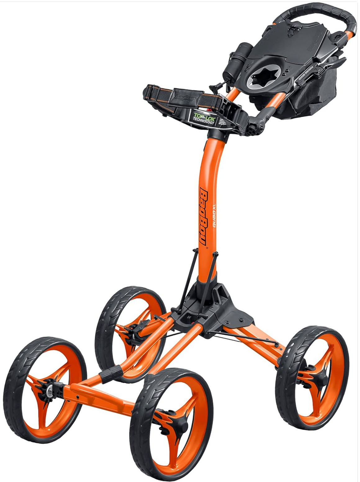
Image: The Bag Boy Quad XL Push Cart in Orange/Black, showcasing its four-wheel design and integrated console.