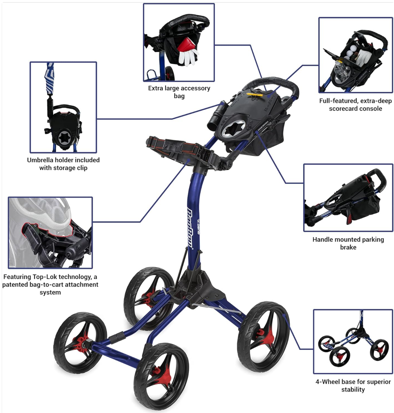
Image: A detailed diagram highlighting key features of the Bag Boy Quad XL Push Cart, including the extra-large accessory bag, full-featured scorecard console, handle-mounted parking brake, umbrella holder with storage clip, Top-Lok technology, and the stable 4-wheel base.