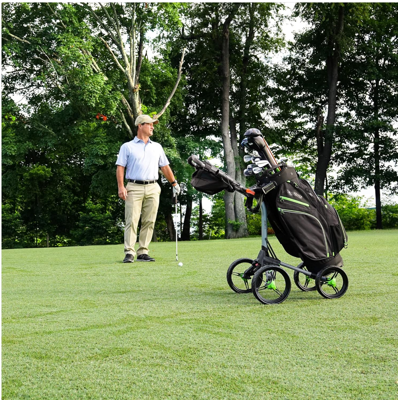
Image: The Bag Boy Quad XL Push Cart in its unfolded state, ready for use on a golf course.