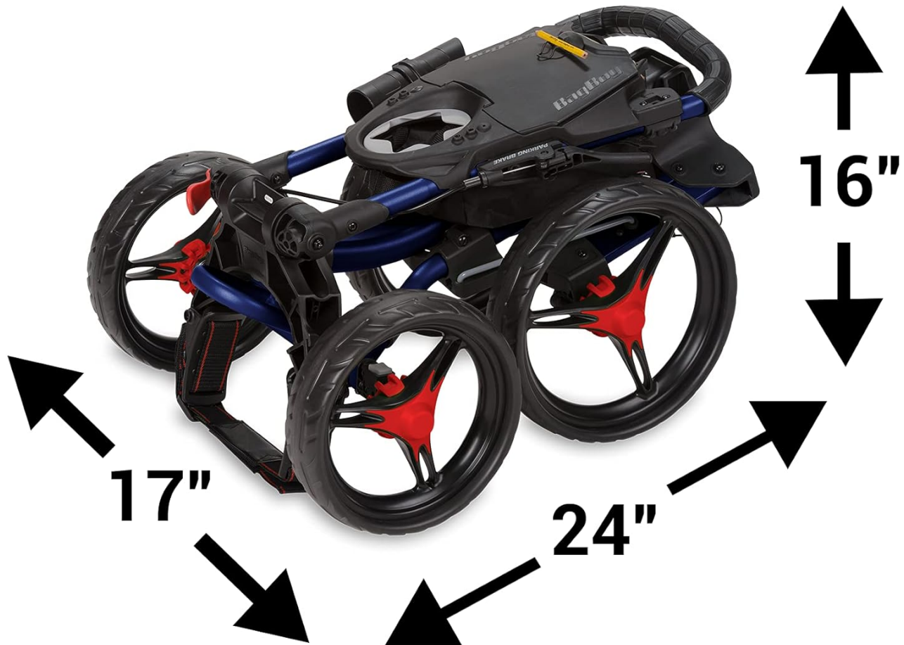
Image: The Bag Boy Quad XL Push Cart folded compactly, illustrating its small footprint for storage and transport. Dimensions are shown as 24" x 17" x 16".