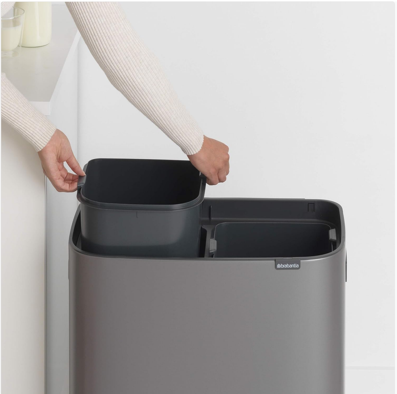
Image: Removing an inner bucket for cleaning or emptying.