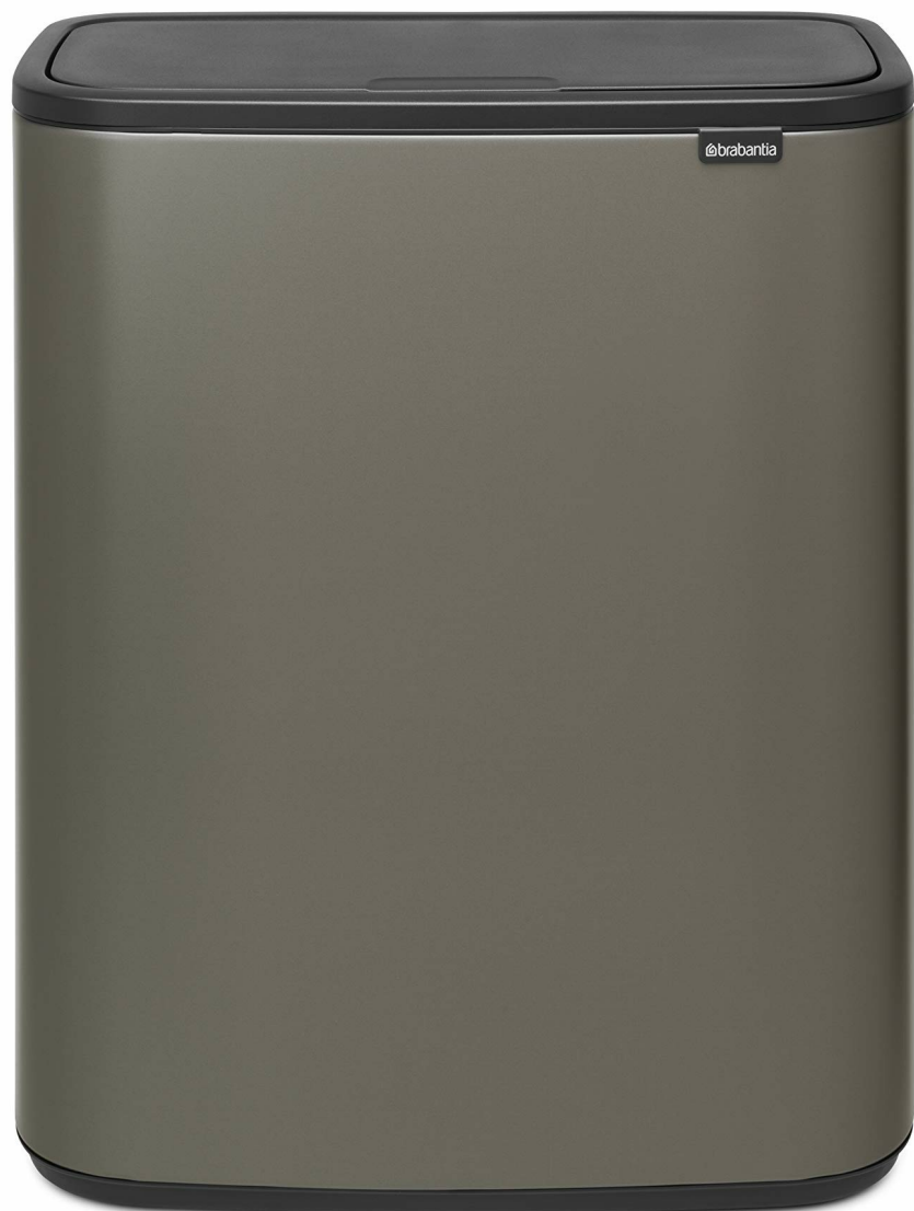
Image: The Brabantia Bo Touch Top Kitchen Trash Can in Platinum, showcasing its sleek design.