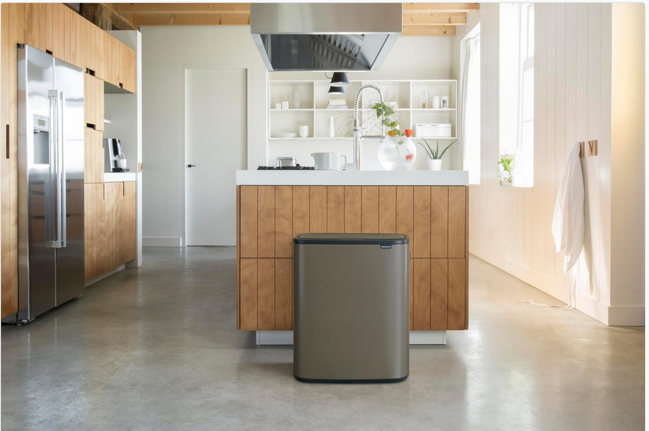
Image: The trash can placed against a kitchen wall, demonstrating its space-efficient design.