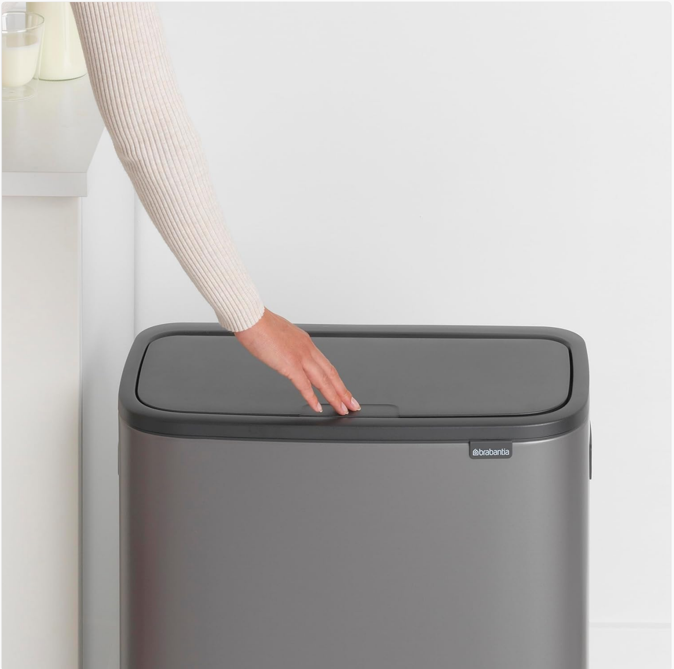
Image: A hand demonstrating the soft-touch lid opening mechanism.

The Bo Touch Top Trash Can features a soft-touch opening system. To open the lid, gently press down on the center of the lid. The lid will open smoothly and silently. It is designed to stay open until you manually close it, providing convenience during use.