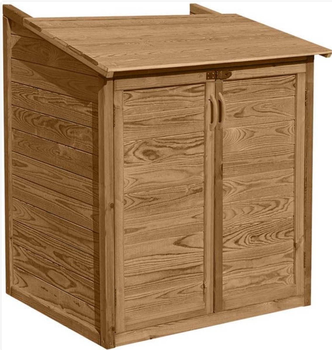
Figure 1.1: Front view of the Interline Bali Filter Housing.