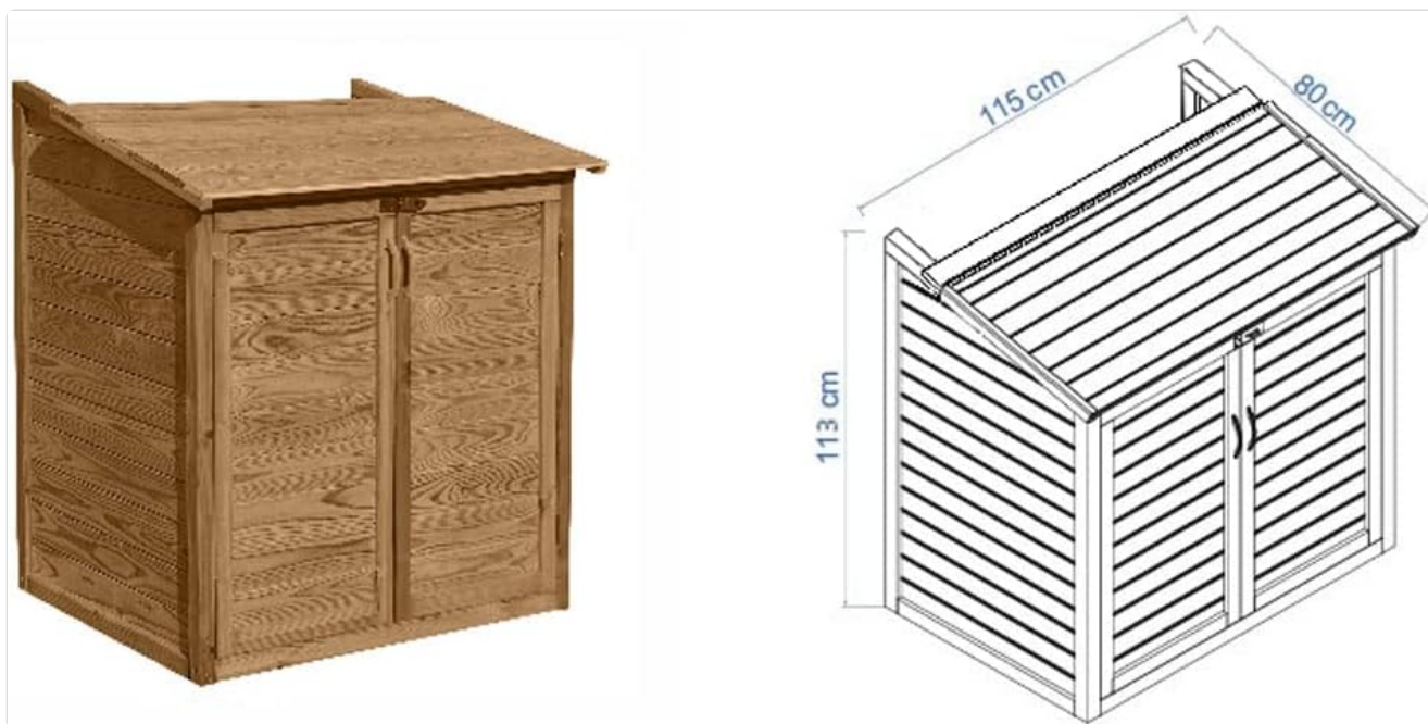
Figure 3.1: Side view of the Interline Bali Filter Housing, showing its structure.