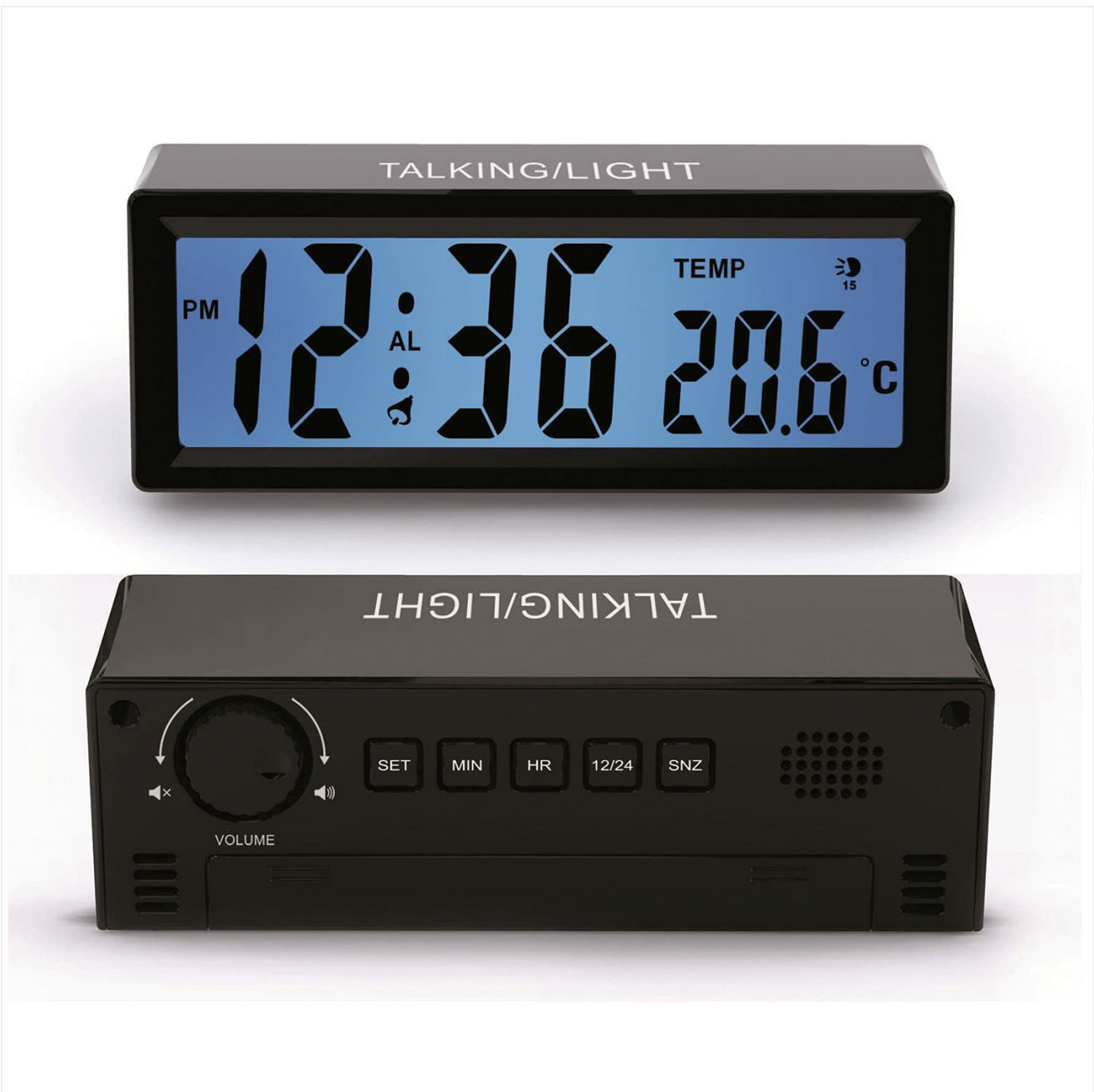
Figure 1: Front view of the Orium 11276 Claritys Talking Alarm Clock showing its large digital display.