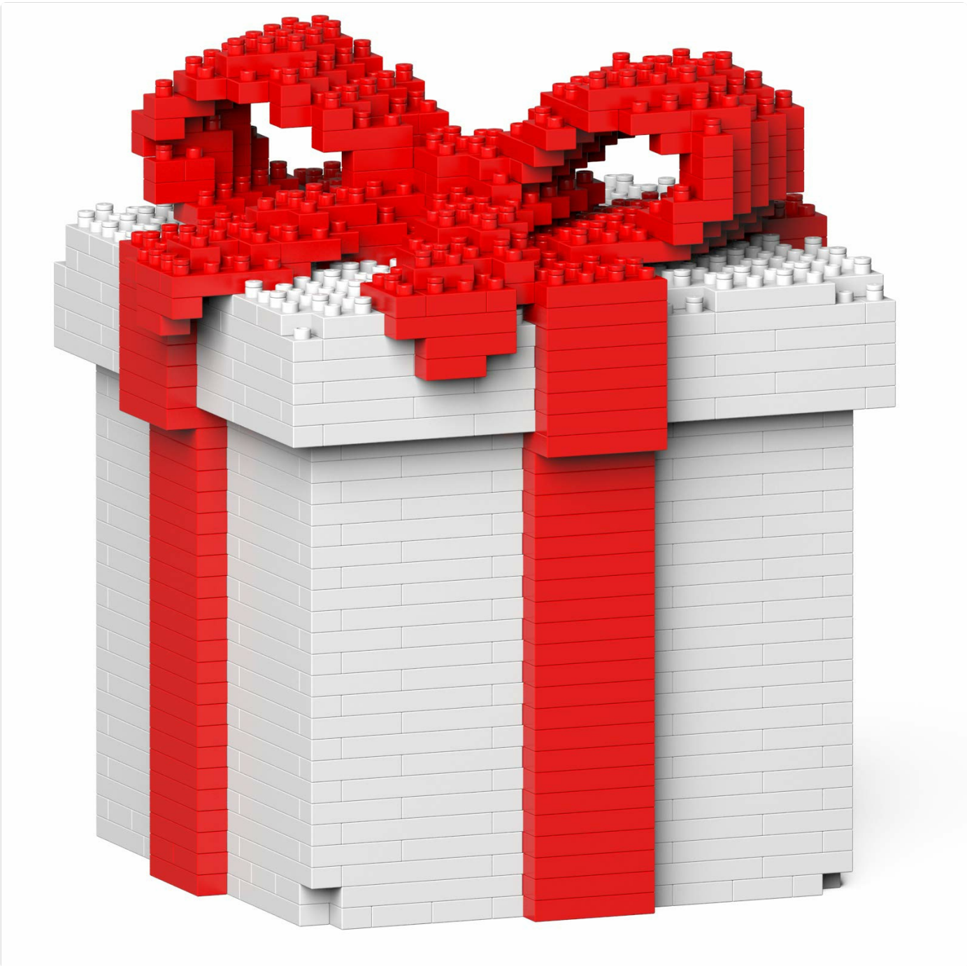
Figure 1.1: Fully assembled JEKCA Present Box ST17PB01-S01.