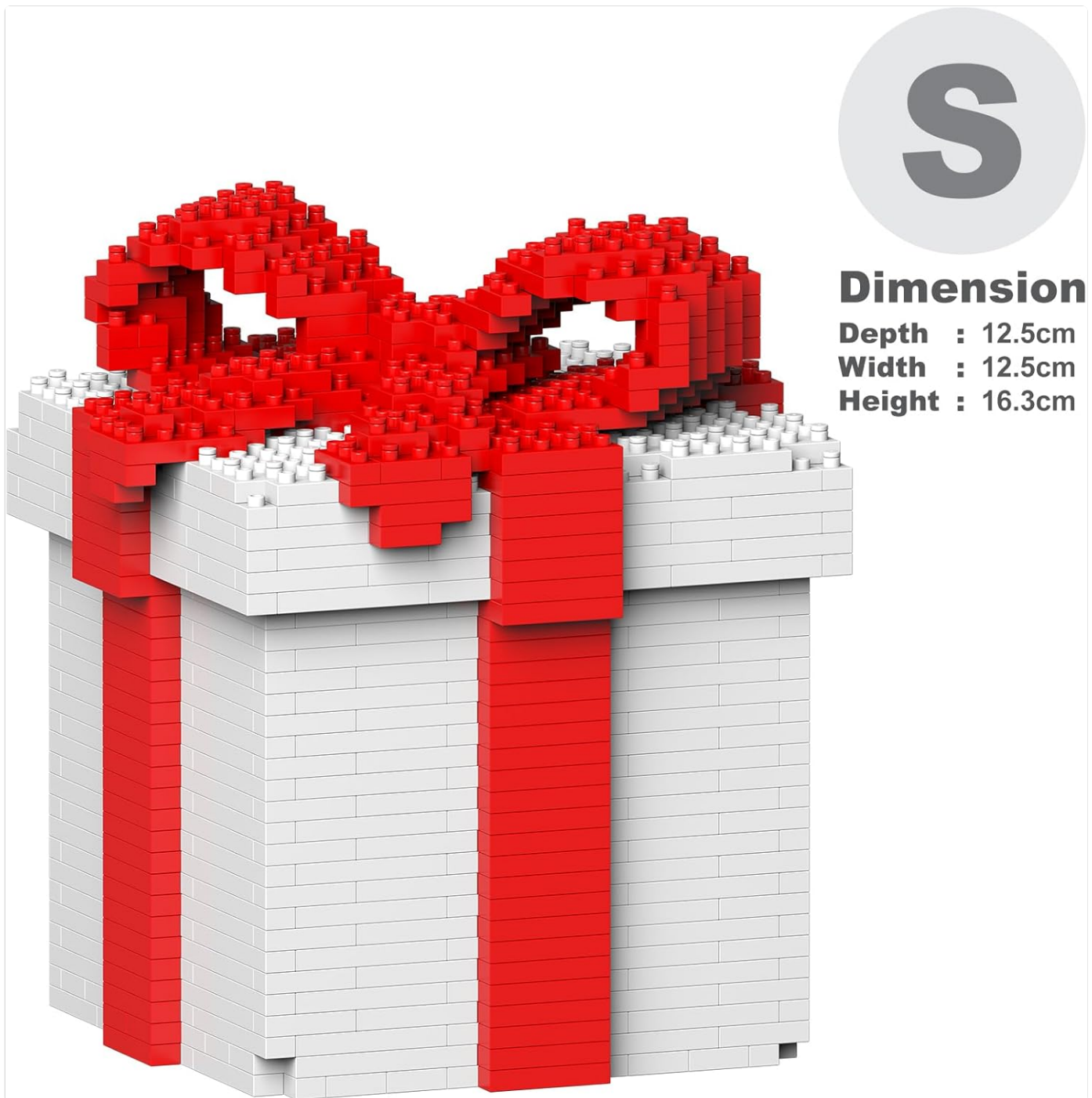
Figure 1.2: Dimensions of the assembled JEKCA Present Box ST17PB01-S01.