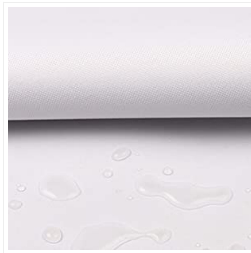
Figure 5.1: Waterproof fabric detail.