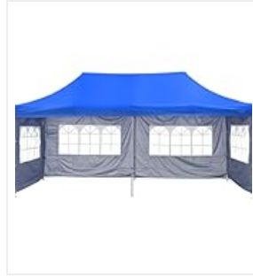
Figure 7.1: Product details and key features.