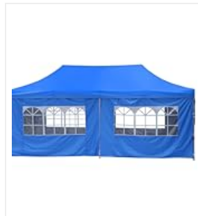
Figure 4.1: Canopy dimensions and adjustable height settings.