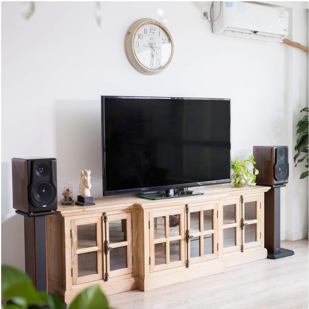
Figure 3.2: Example placement of Edifier S3000Pro speakers in a room.