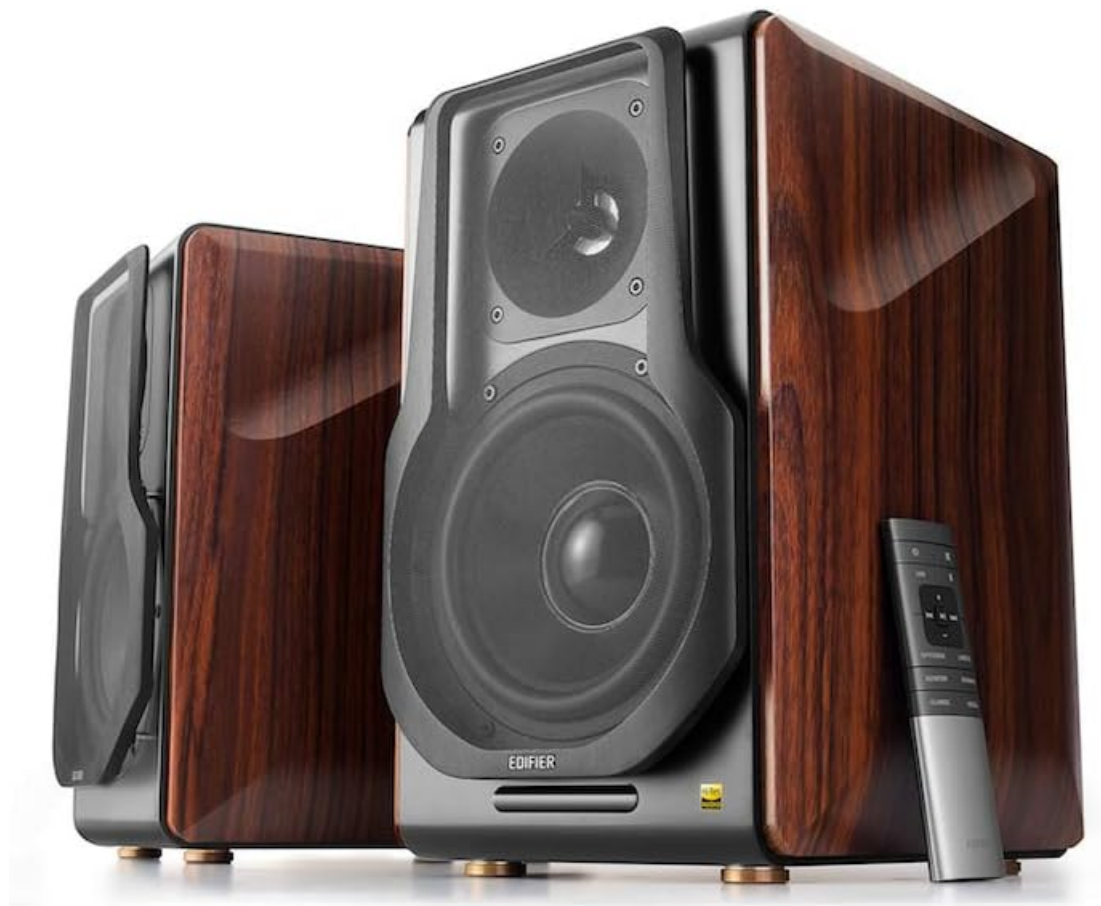
Figure 3.1: Edifier S3000Pro Speakers and Remote Control.