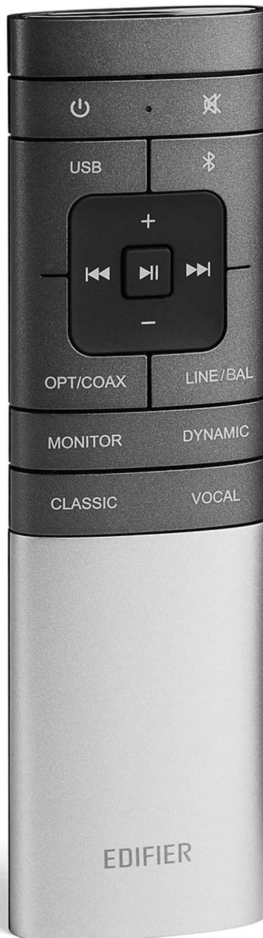
Figure 4.1: The wireless remote control for Edifier S3000Pro speakers.