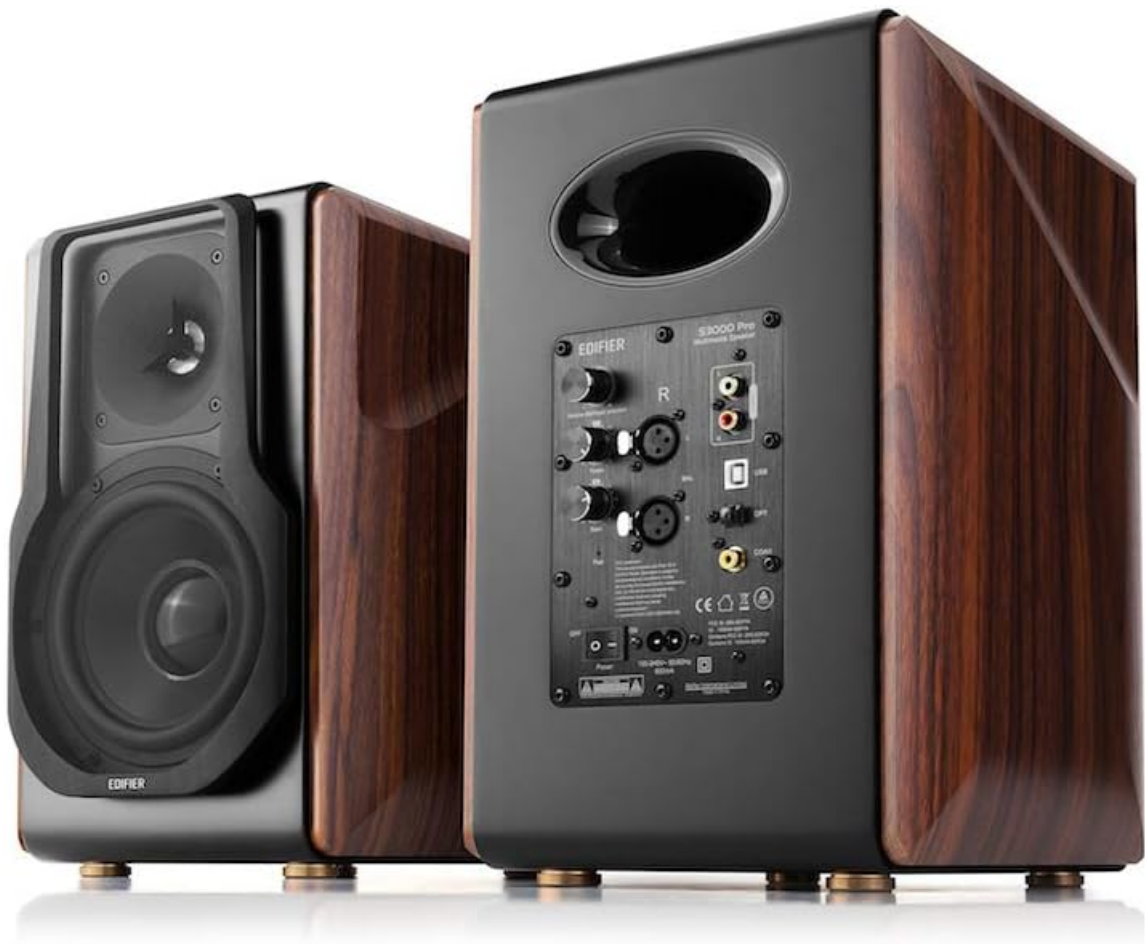
Figure 3.3: Rear panel of the active speaker with various input options.