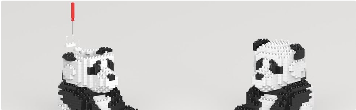
Figure 3: An example of a JEKCA sculpture under construction, demonstrating the brick-through interlocking system.

The Chow Chow sculpture, once completed, will measure approximately 13.54 x 6.65 x 10.67 inches (Length x Width x Height).