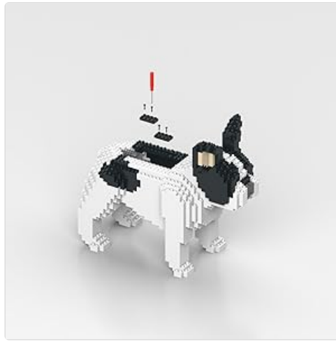
Figure 2: Step-by-step visual guide for connecting JEKCA bricks using pins and the pin driver.