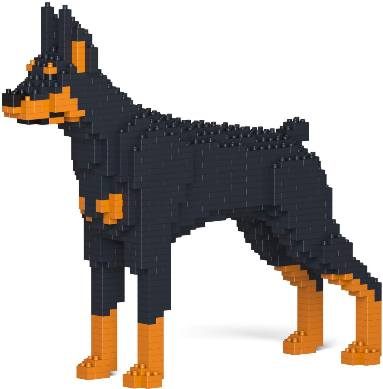
Image: A front-side perspective of the completed JEKCA Doberman Pinscher model, showcasing its detailed block construction and characteristic Doberman features.