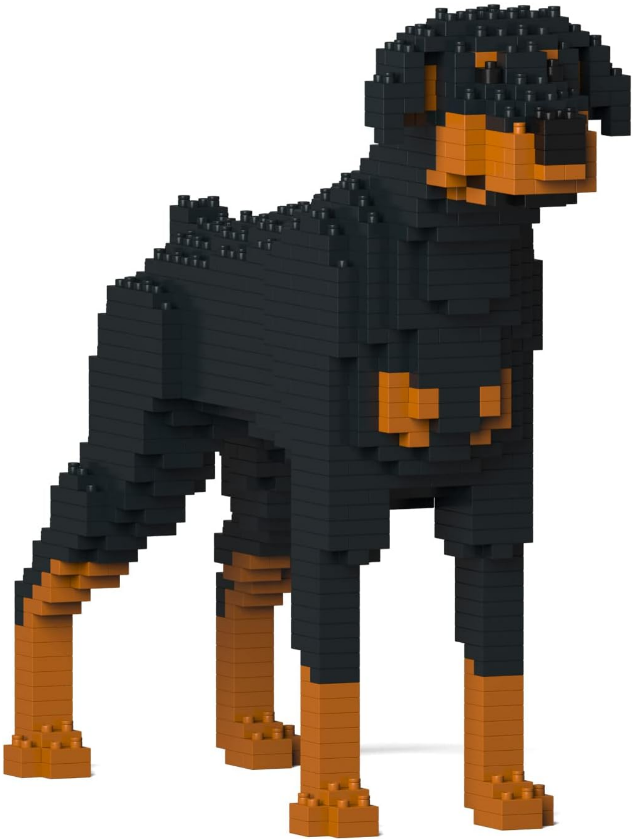
Image: A direct front view of the assembled JEKCA Doberman Pinscher model, emphasizing its head and chest details.