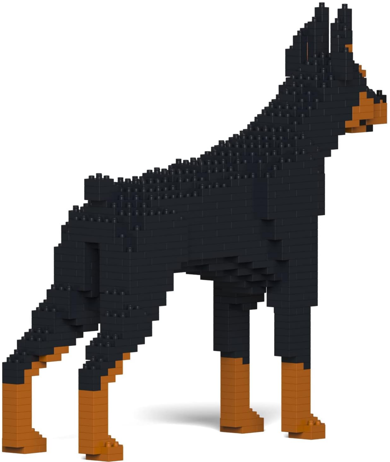
Image: A rear-side view of the completed JEKCA Doberman Pinscher model, showing the tail and hind leg construction.