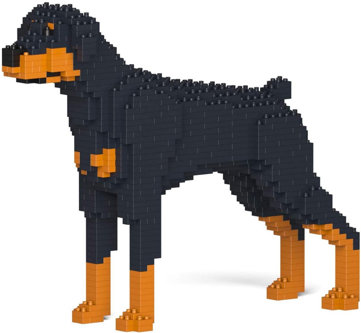
Image: Another side view of the completed JEKCA Doberman Pinscher model, presenting a slightly different angle to showcase its overall form.