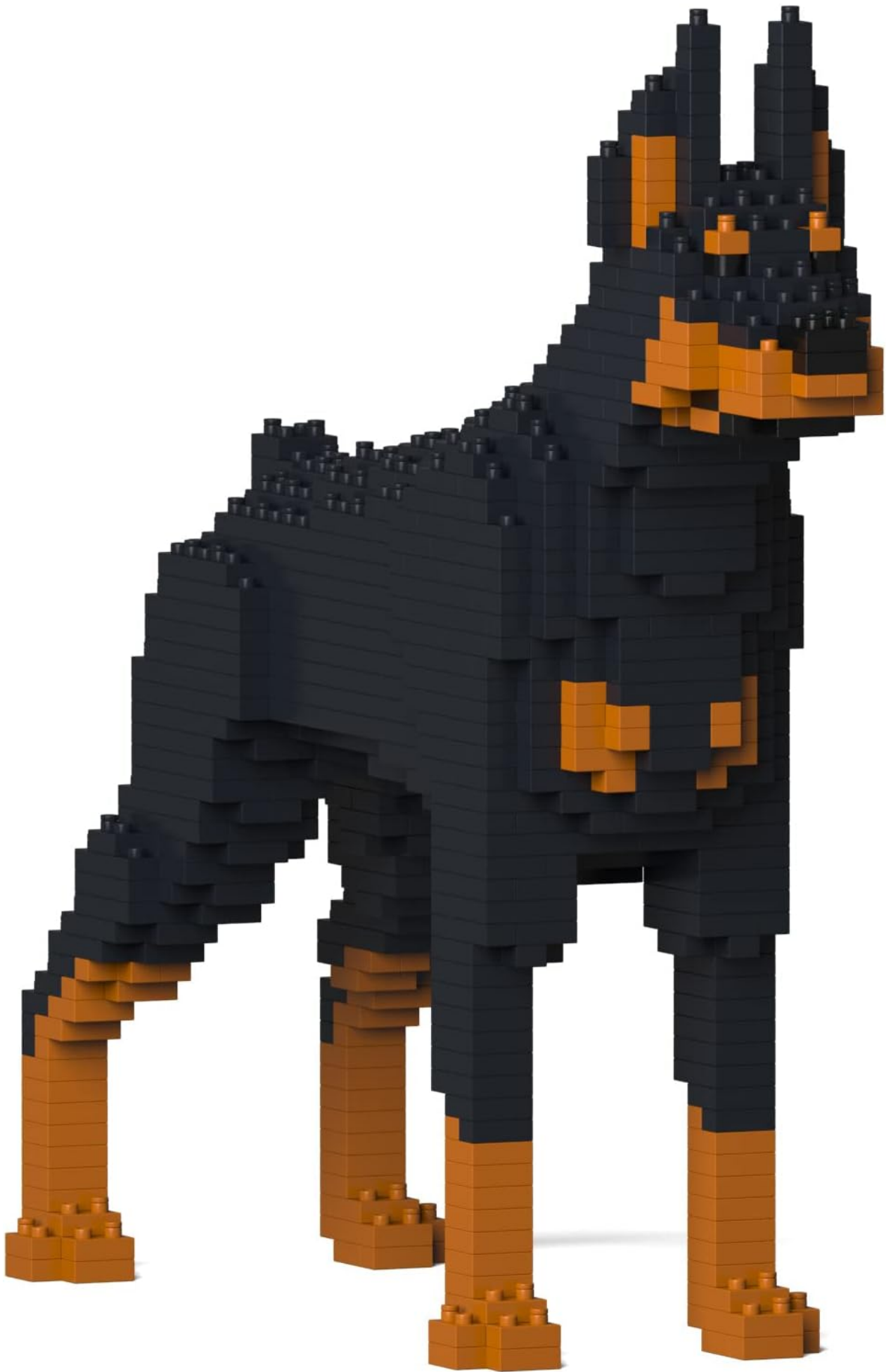
Image: A side view of the assembled JEKCA Doberman Pinscher model, highlighting its dimensions: Length 57.5cm, Width 17.5cm, Height 50.8cm. This provides a visual reference for the final size.