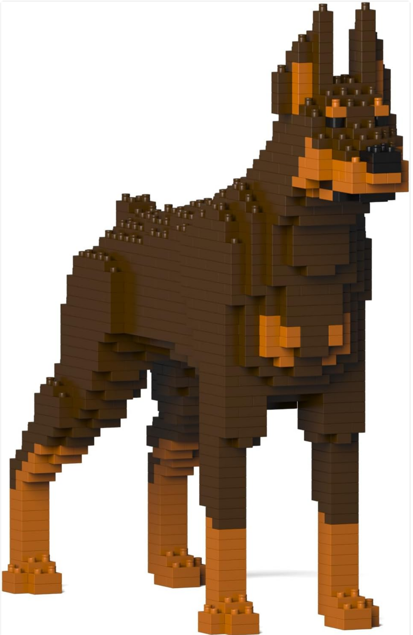
Figure 3: Illustration of the interlocking brick system.