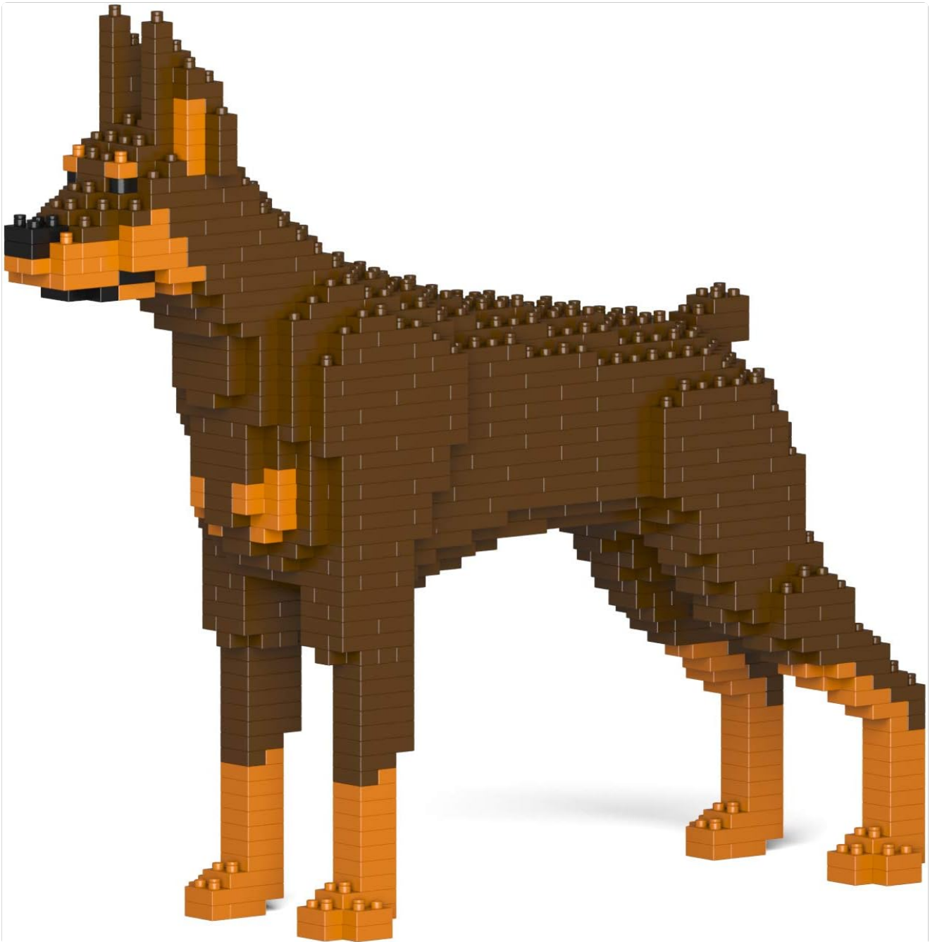
Figure 1: Assembled JEKCA Doberman Pinscher model.