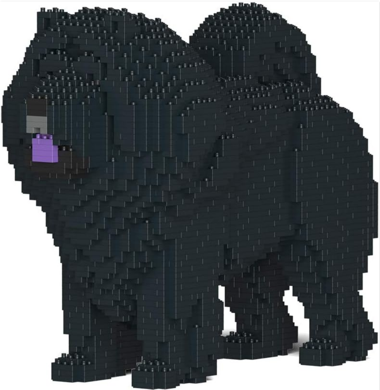
Image: A front-side view of the fully assembled JEKCA Chow Chow 02S-M03 building block model, showcasing its black color and intricate block construction.