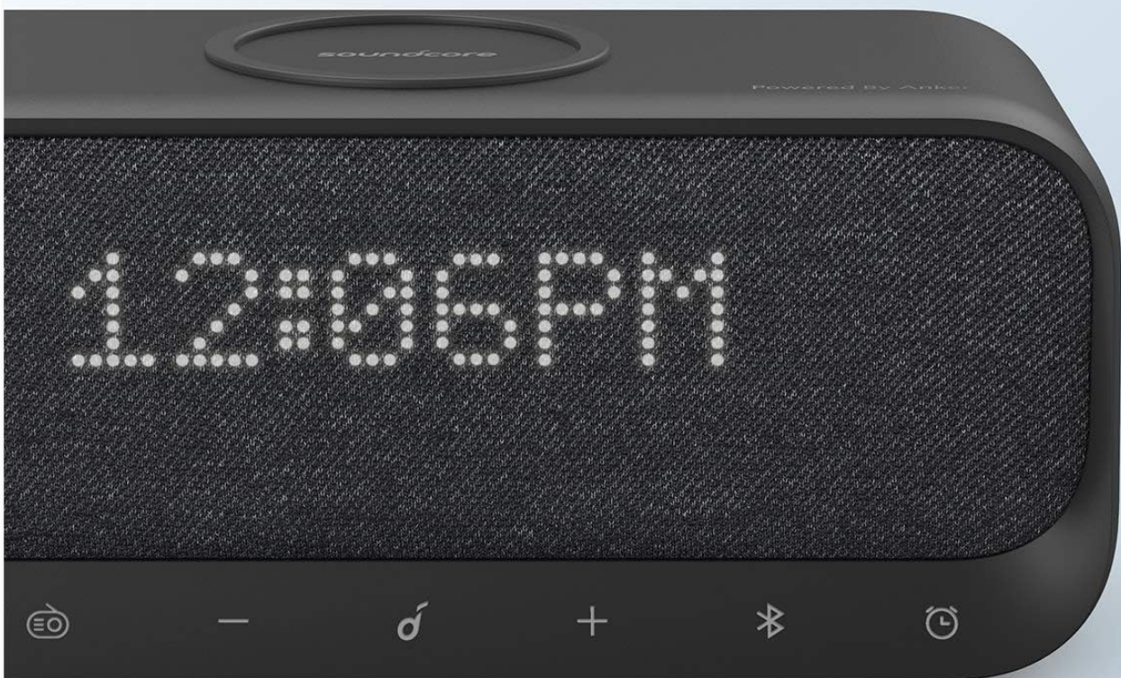
Image: Close-up of the Soundcore Wakey display showing the time and alarm icon.