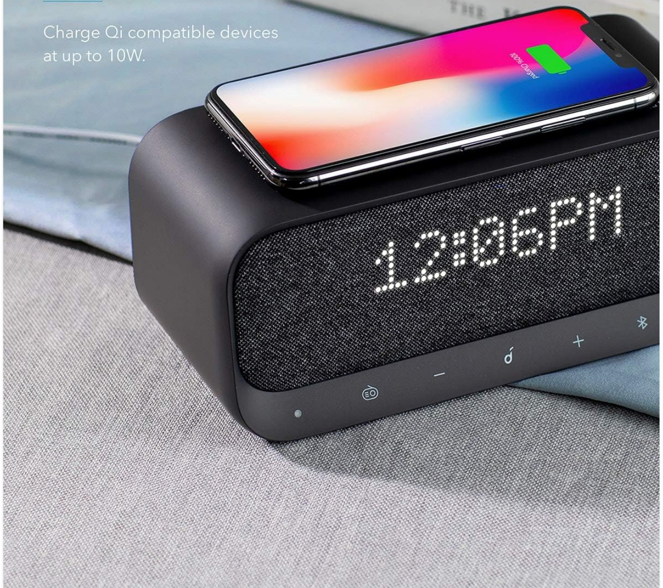
Image: Smartphone wirelessly charging on top of the Soundcore Wakey.

Charge Qi compatible devices at up to 10W.