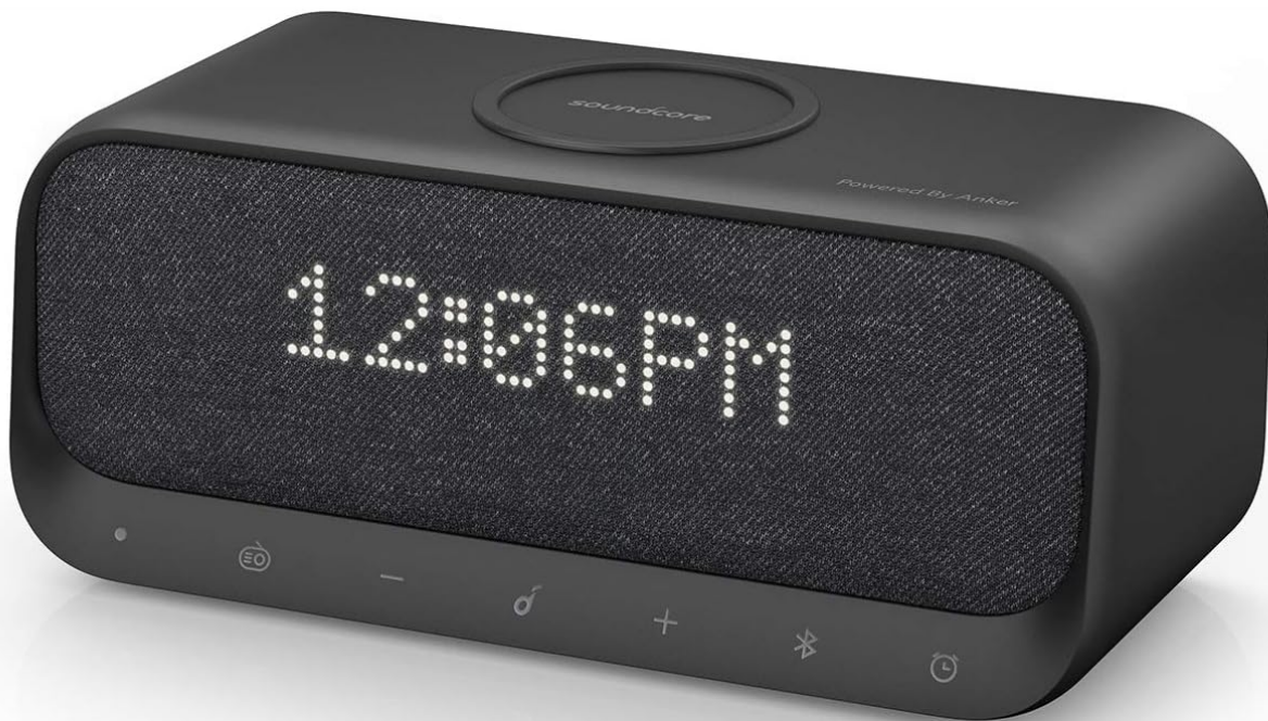
Image: Front view of the Anker Soundcore Wakey, displaying the time and controls.

The Anker Soundcore Wakey is a versatile bedside device combining a Bluetooth speaker, alarm clock, FM radio, white noise generator, and Qi wireless charger. This manual provides detailed instructions to help you set up and utilize all features of your Soundcore Wakey.