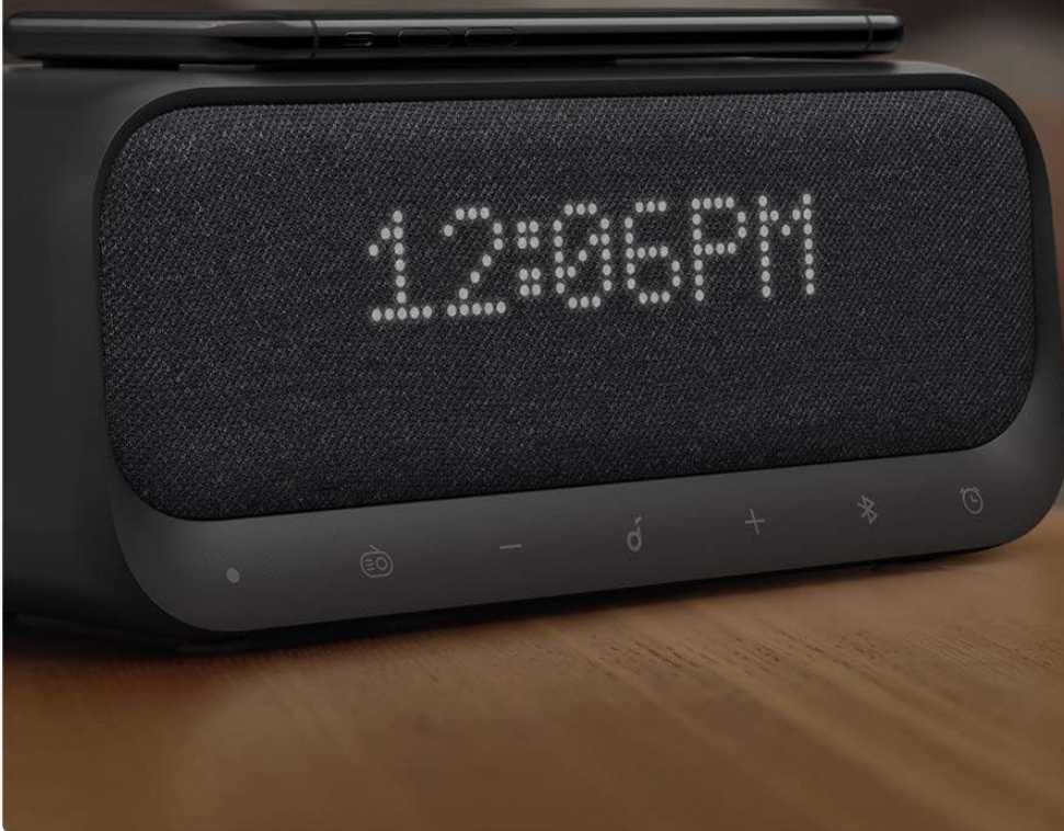
Image: Soundcore Wakey on a nightstand, illustrating its white noise function for sleep.

Personalize the soundscape for better rest.