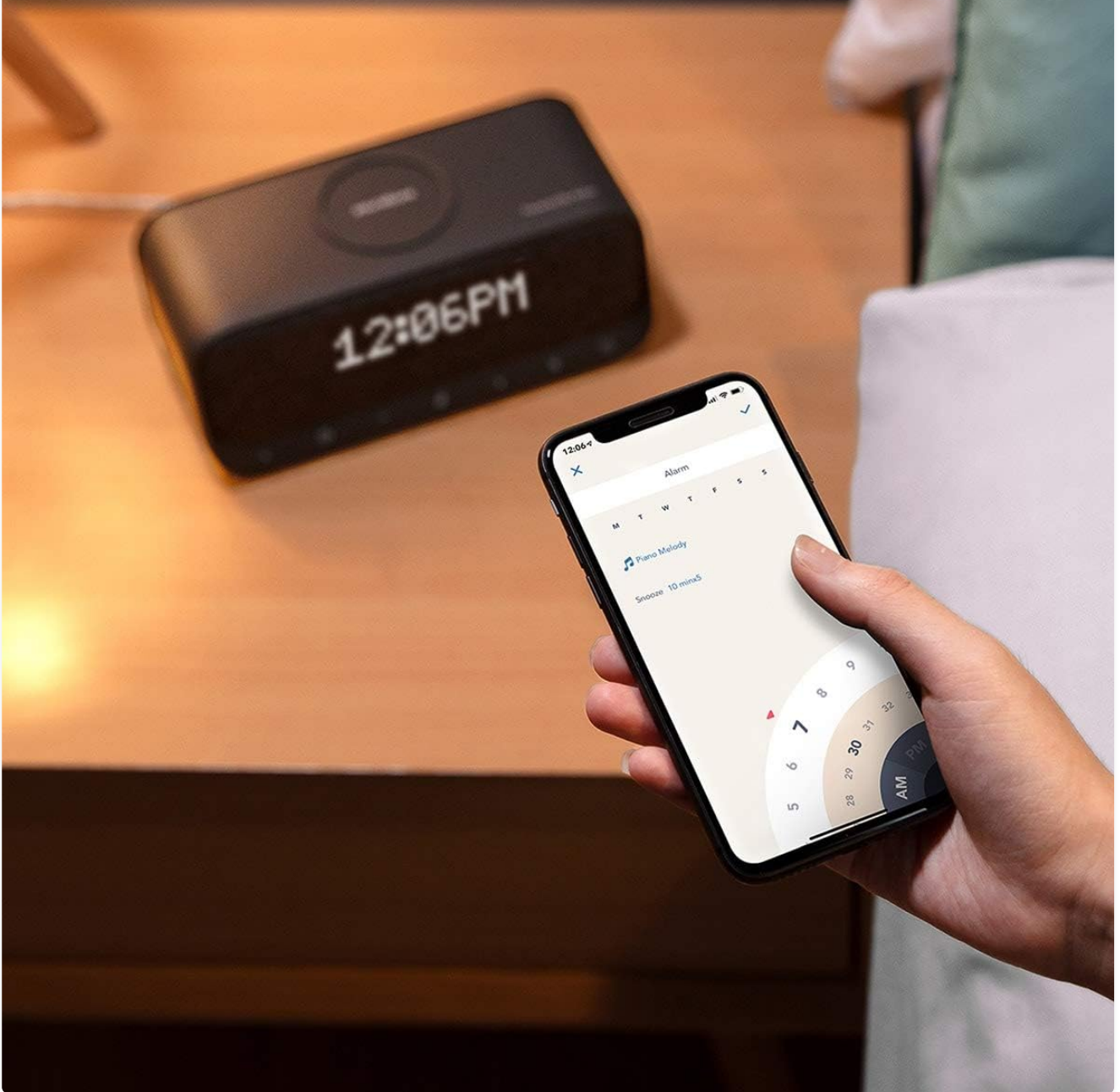
Image: A hand interacting with the Soundcore app on a smartphone, showing alarm settings.