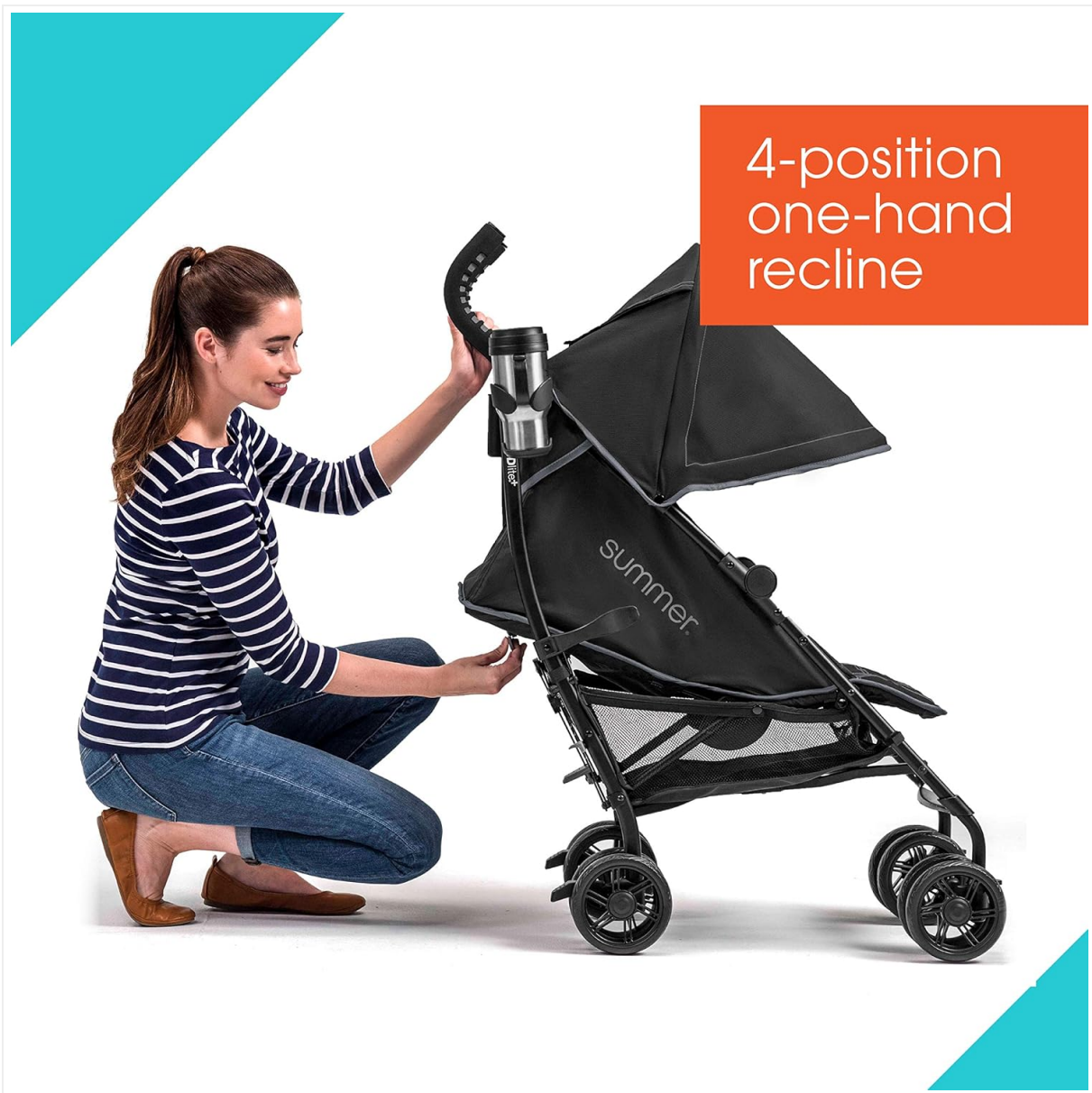
Image: A person demonstrating the one-hand recline feature of the stroller seat.