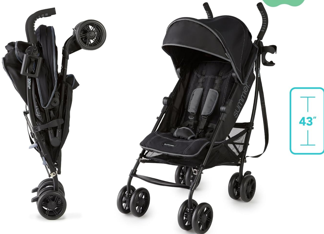
Image: The stroller shown in both its compact folded state and fully unfolded, highlighting its lightweight design and portability.