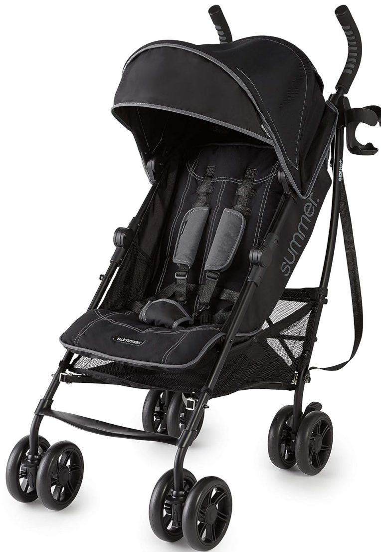
Image: Front view of the Summer Infant 3Dlite+ Convenience Stroller, showcasing its overall design, canopy, seat, and wheels.