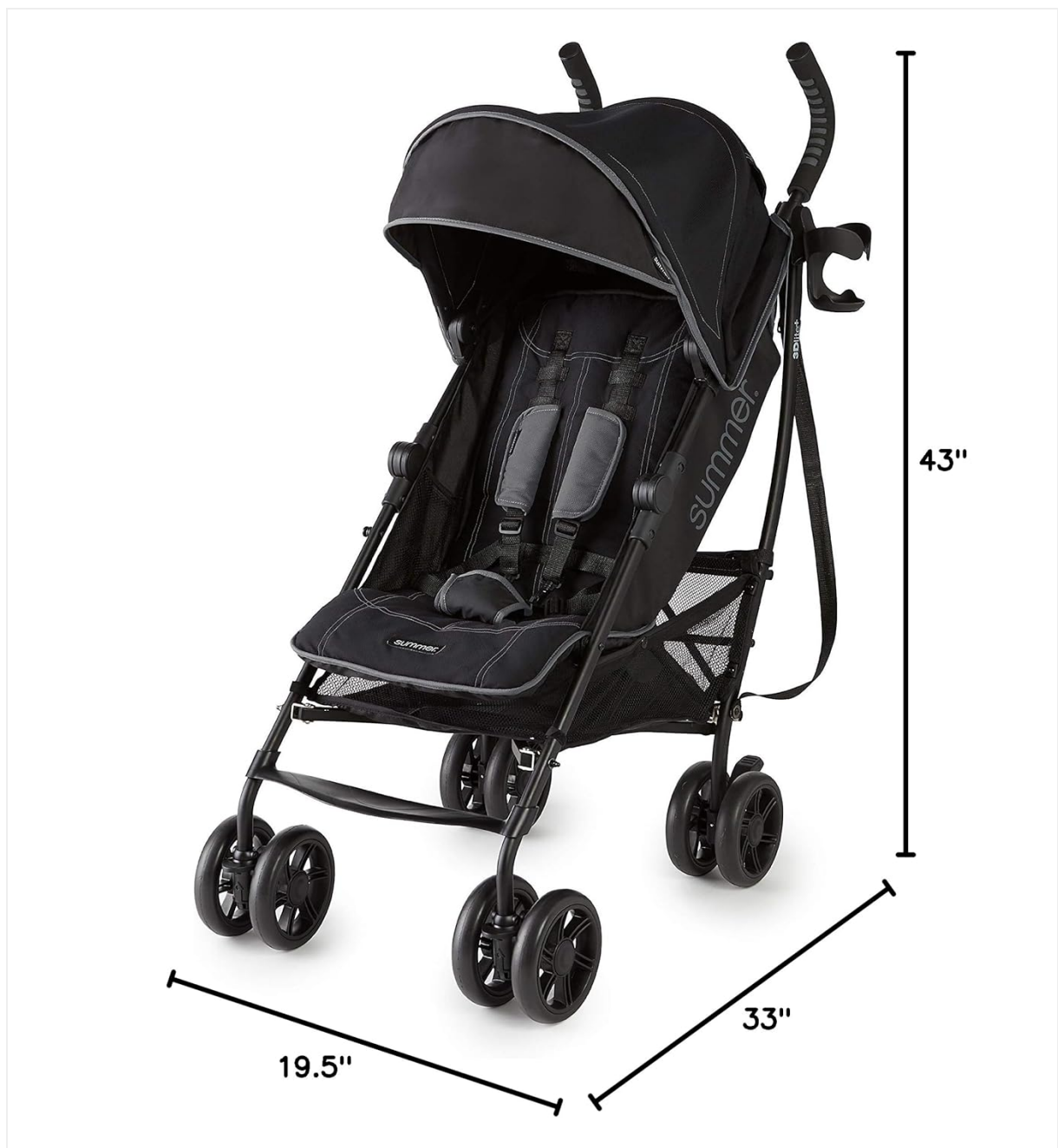
Image: Diagram illustrating the key dimensions of the Summer Infant 3Dlite+ Stroller.