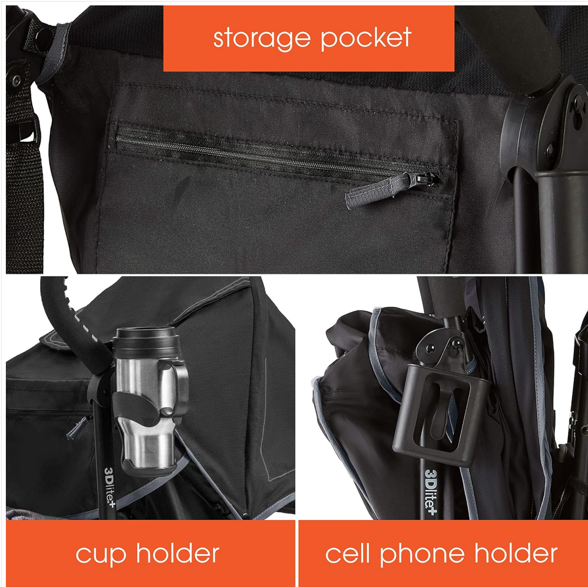
Image: Close-up views of the stroller's storage pocket, parent cup holder, and cell phone holder.