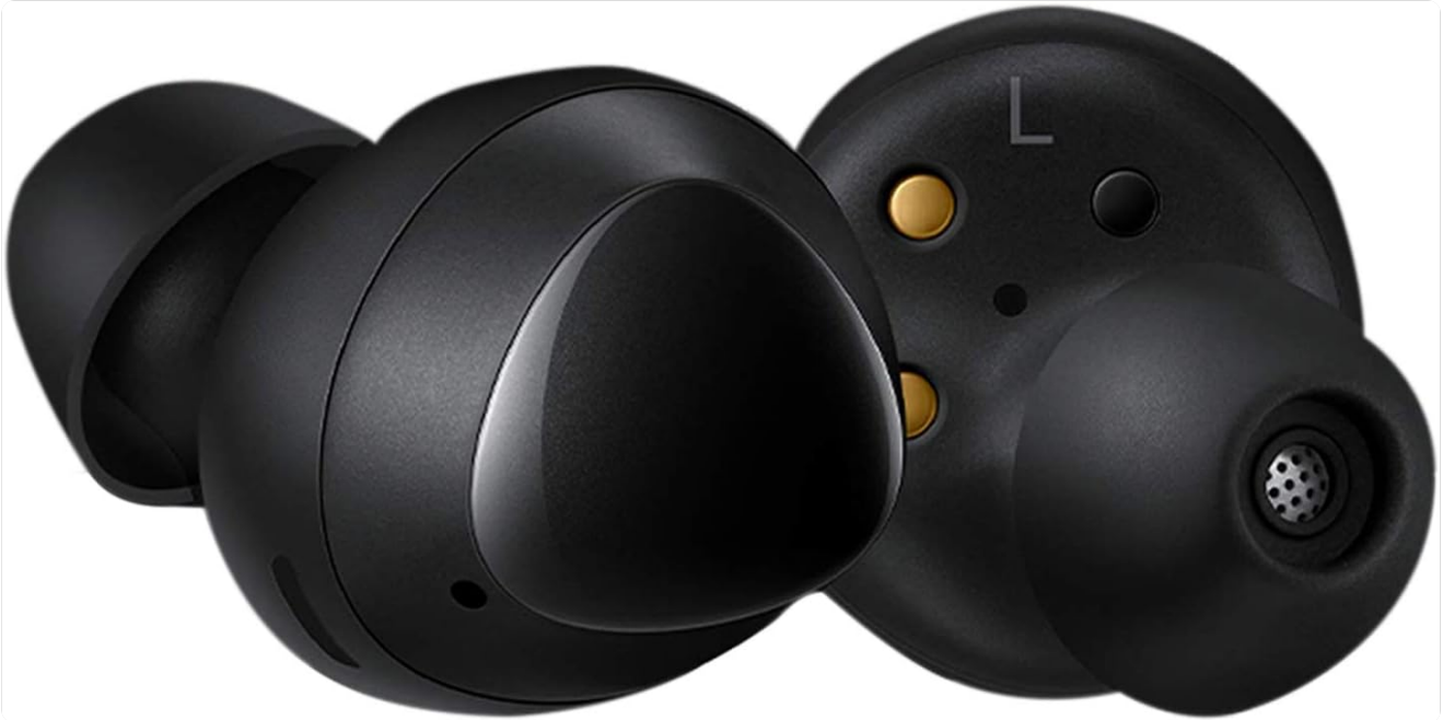
Image: The Samsung Galaxy Buds SM-R170 earbuds, showcasing their compact design and in-ear fit.