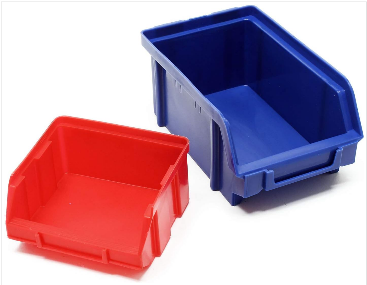
Image: Individual small red and large blue storage bins, demonstrating their different sizes.