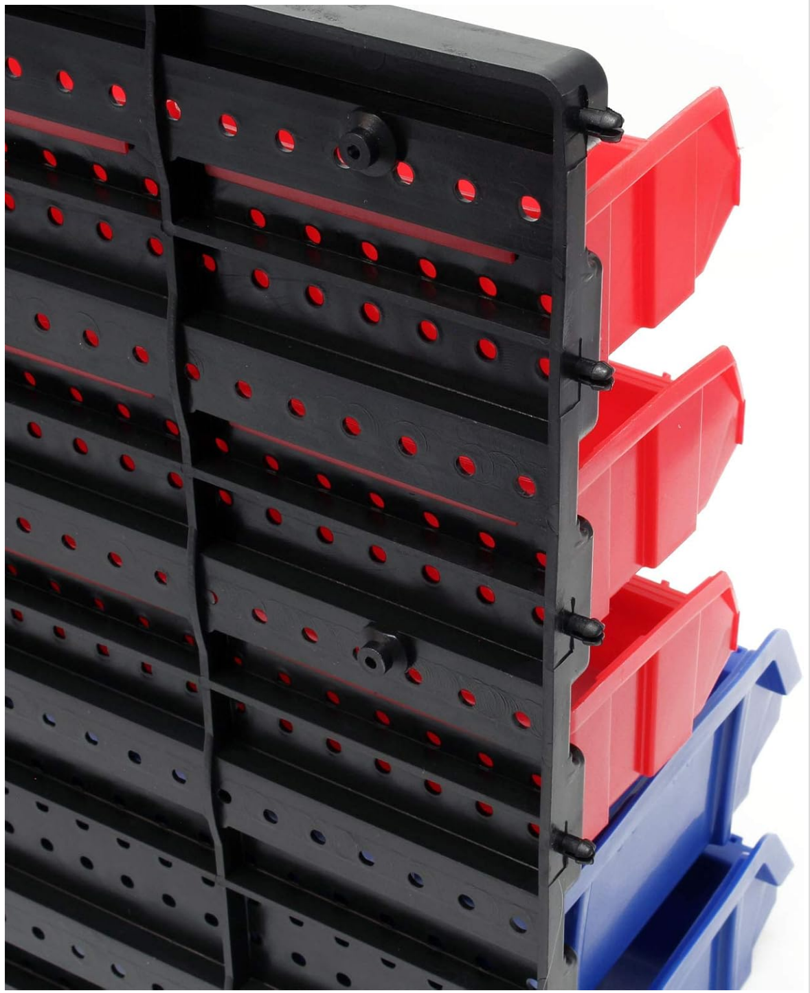
Image: A close-up view of the black wall panel, highlighting the pre-drilled holes and how the bins attach.