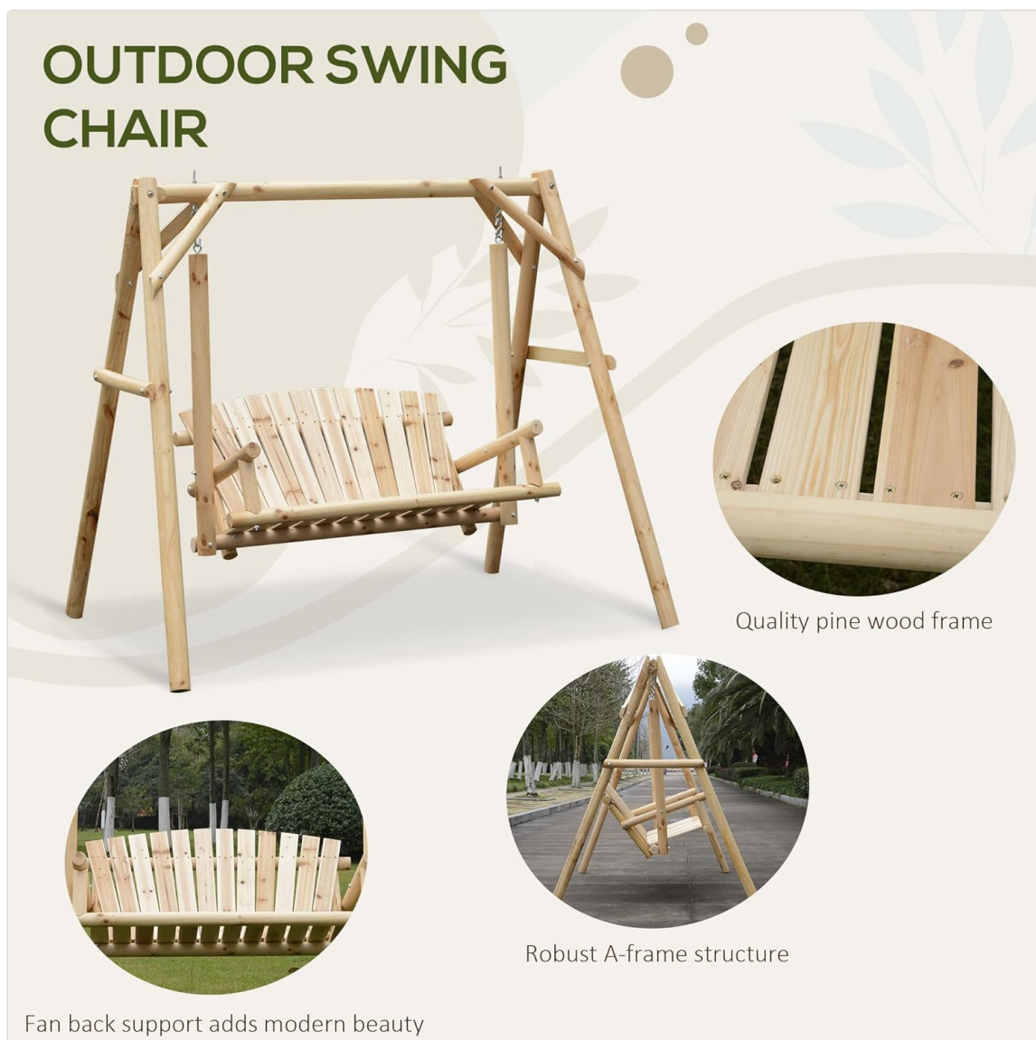
Figure 4.1: The A-frame structure provides robust support.