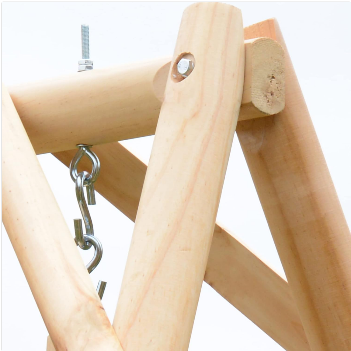
Figure 4.3: The strong S-type hook ensures secure hanging.

Once assembled, verify that all connections are tight and the swing moves freely and safely.