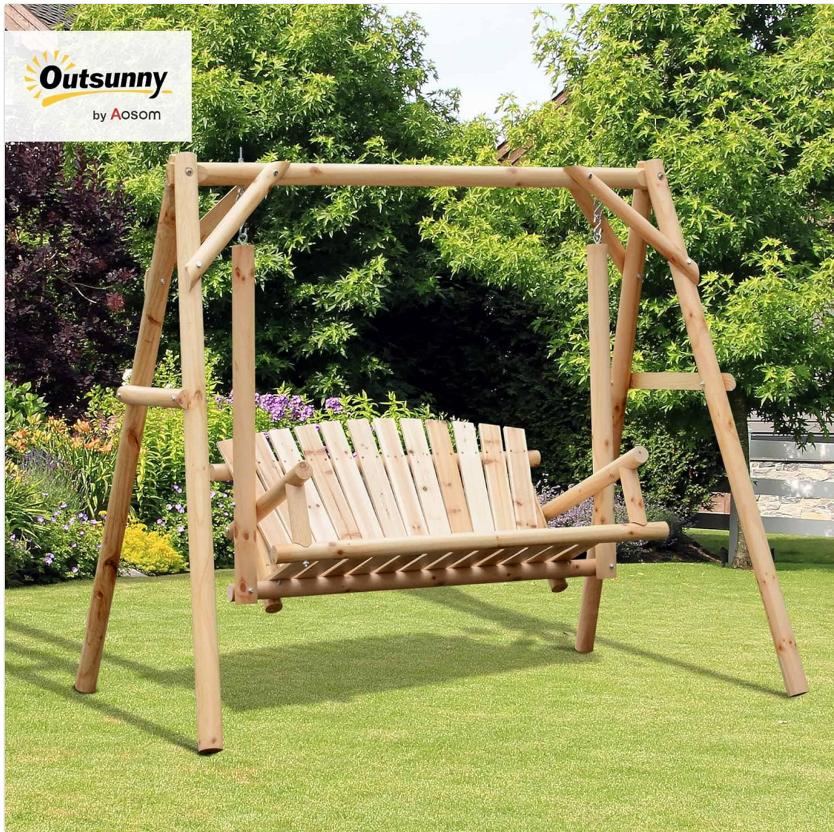
Figure 5.1: The porch swing provides a comfortable outdoor seating area.