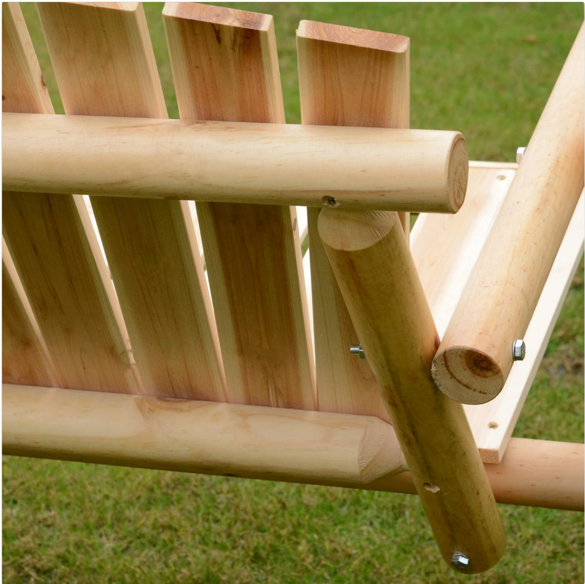
Figure 4.2: Detail of the sturdy attached armrest and wooden seat bench.