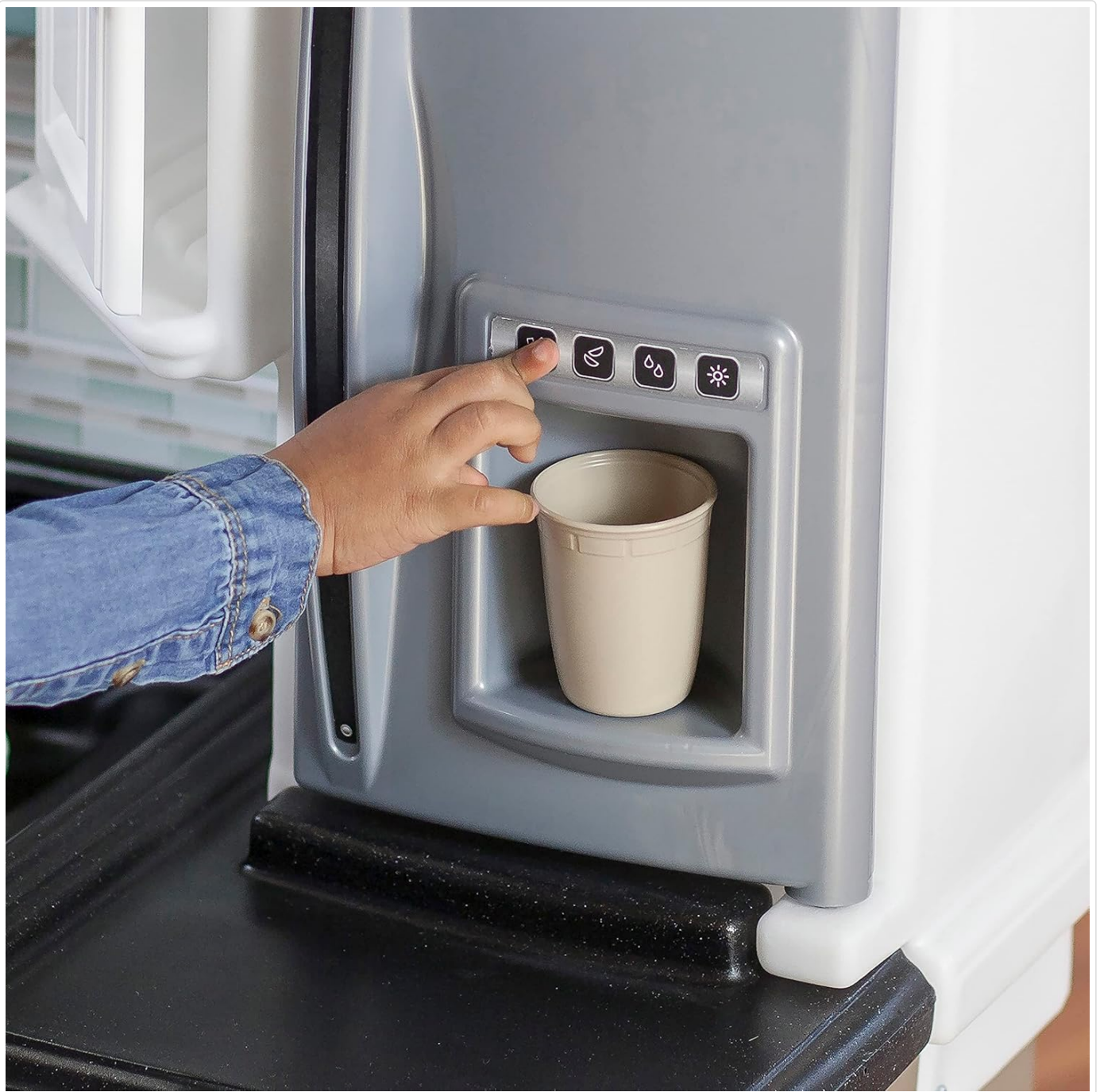
Figure 5: Play Food and Cookware Interaction