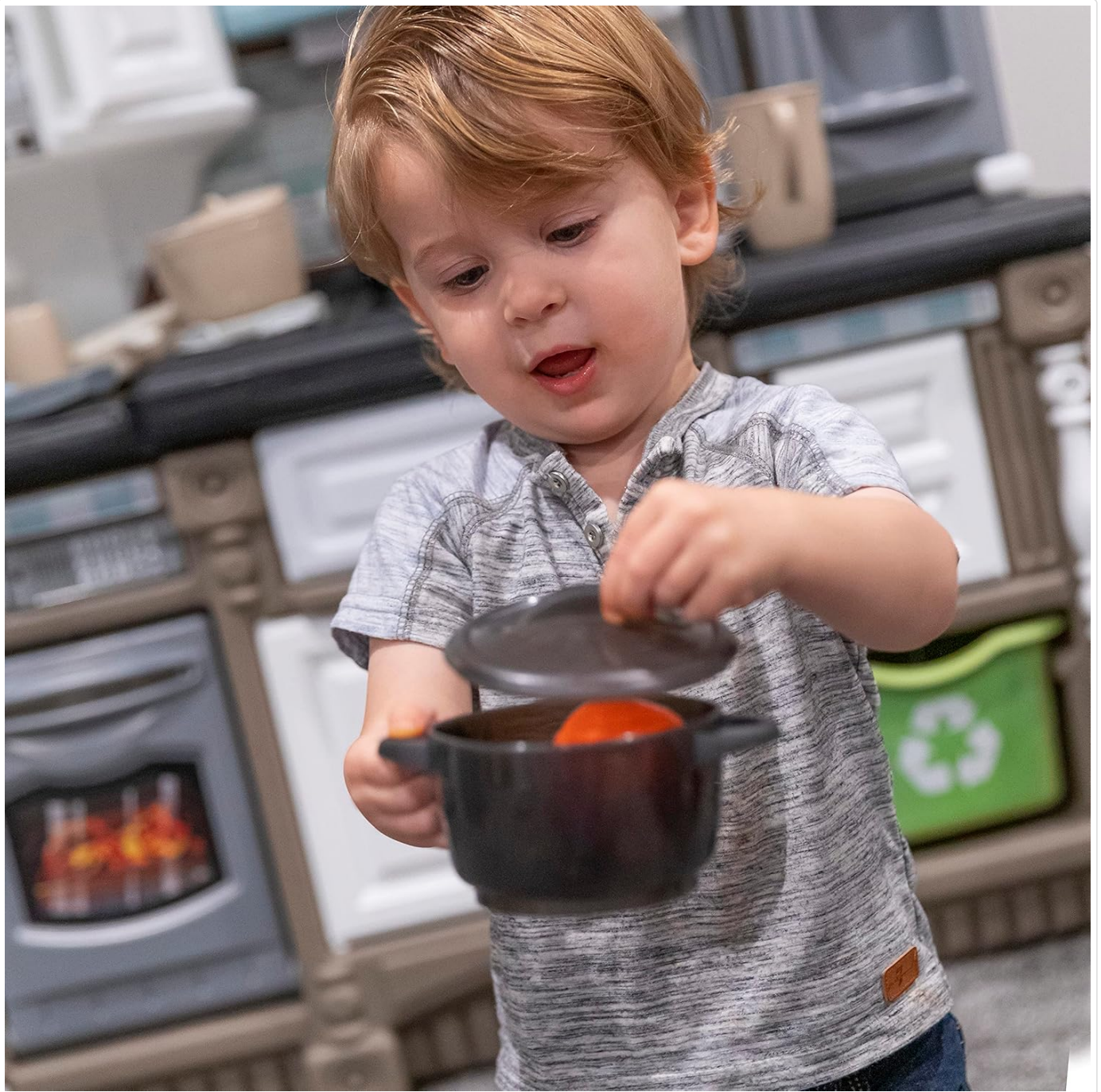
Figure 2: Included Accessories