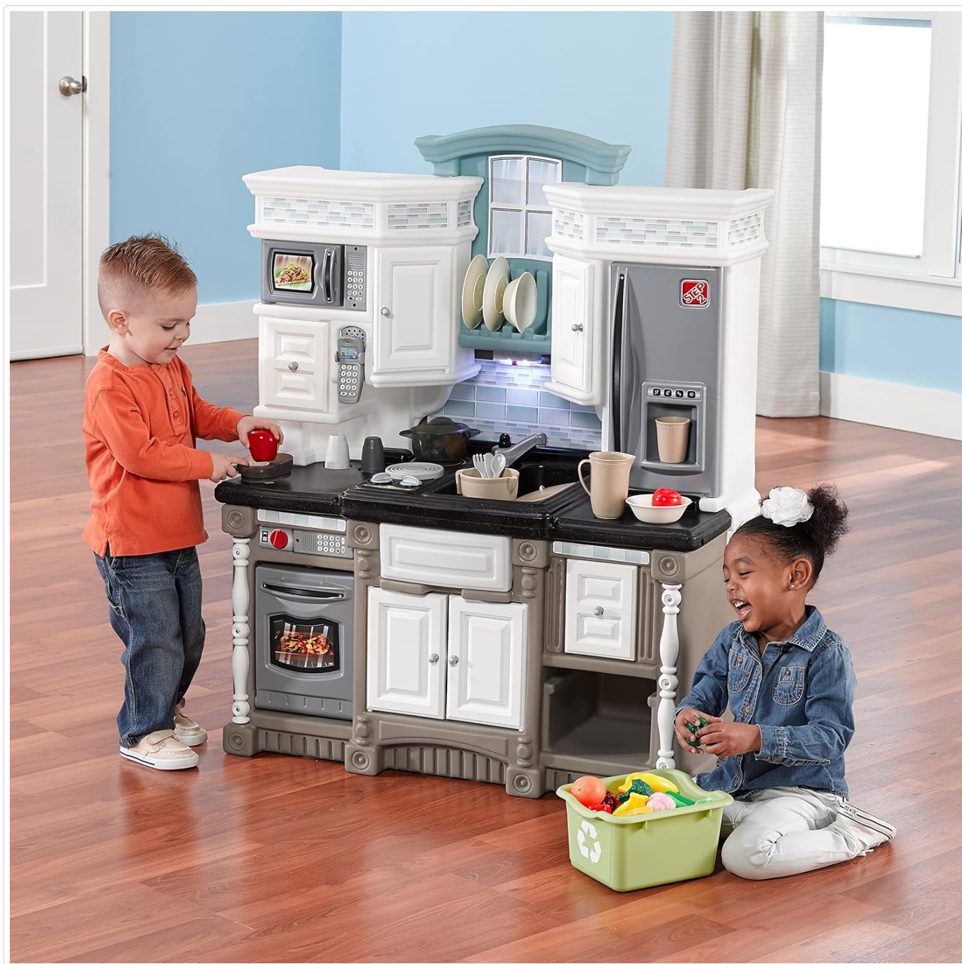
Figure 4: Children Engaging with the Playset