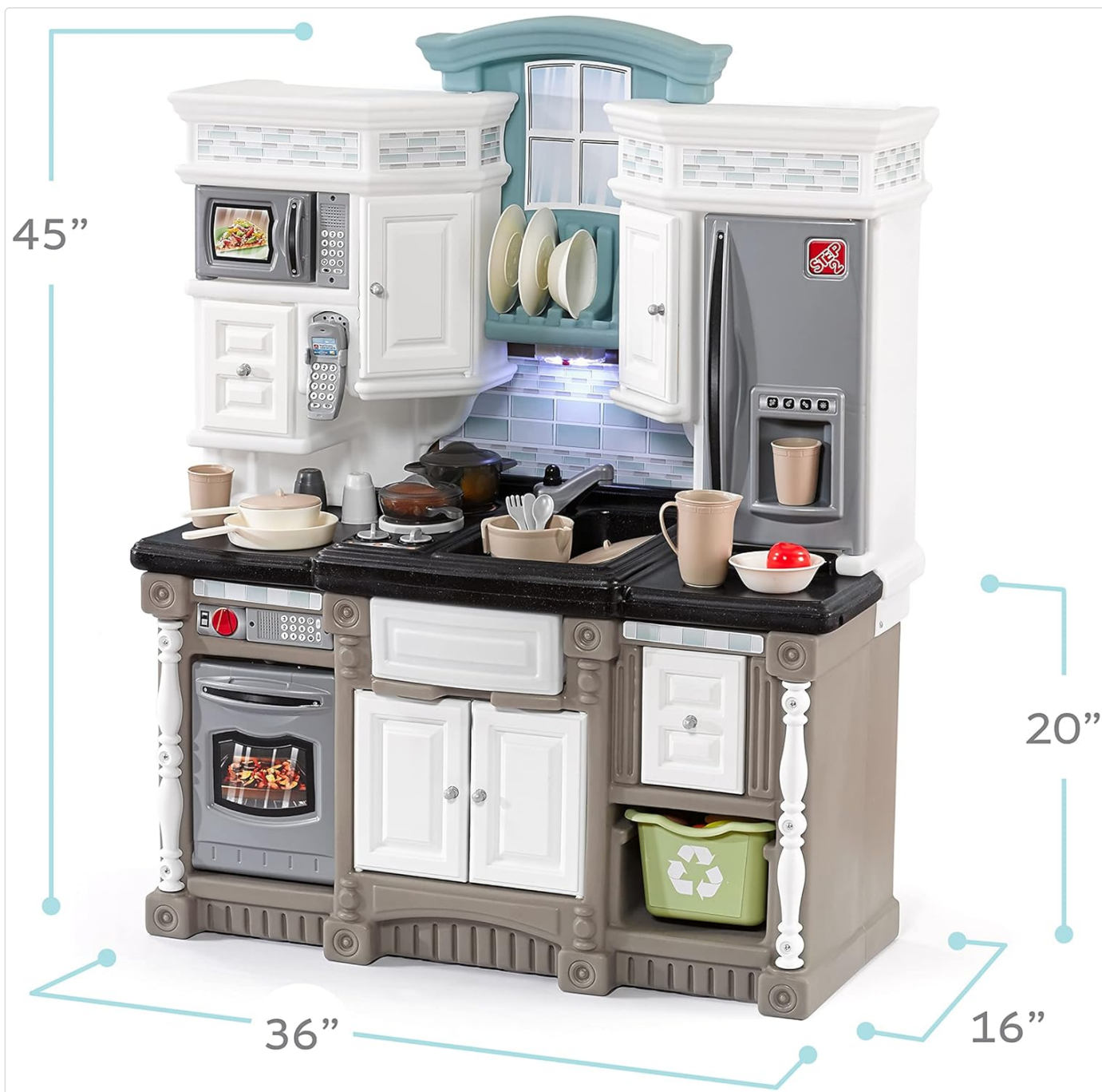
Figure 1: Product Dimensions Overview