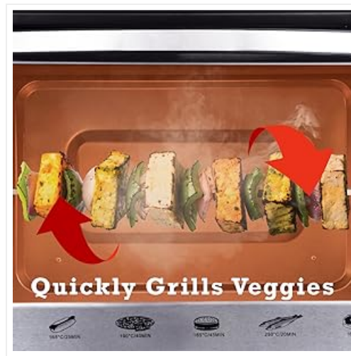
Image 4: The rotisserie rod with skewered vegetables and paneer rotating inside the oven, demonstrating the grilling capability.