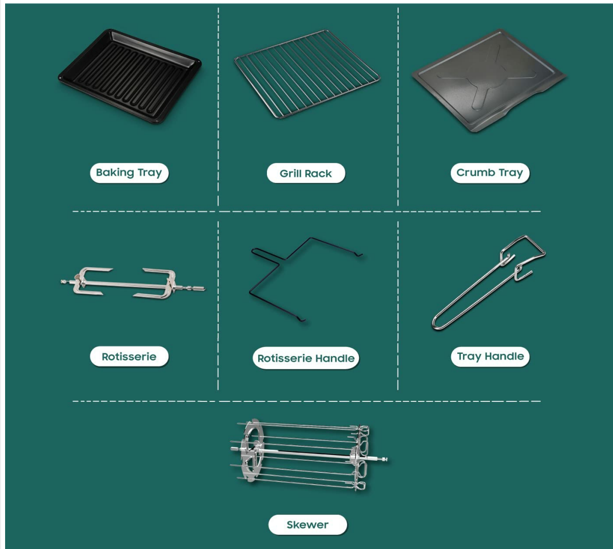
Image 3: A visual representation of all standard accessories provided with the Croma OTG.