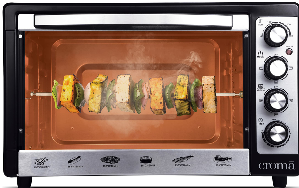
Image 1: Front view of the Croma 48L OTG, illustrating its overall dimensions including width, depth, height, and weight.