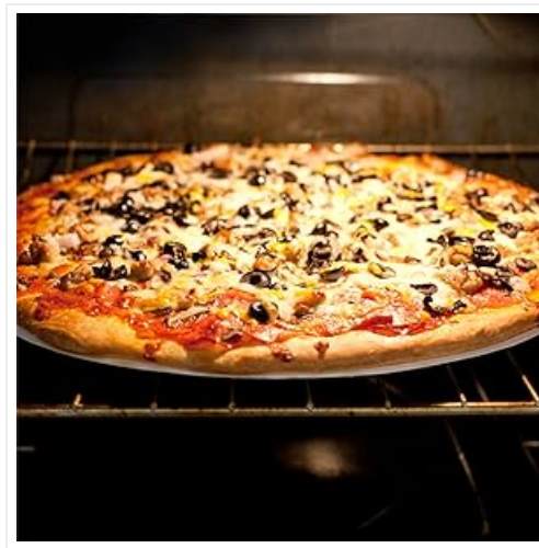
Image 5: A pizza baking inside the Croma OTG, illustrating the oven's capacity and suitability for baking.