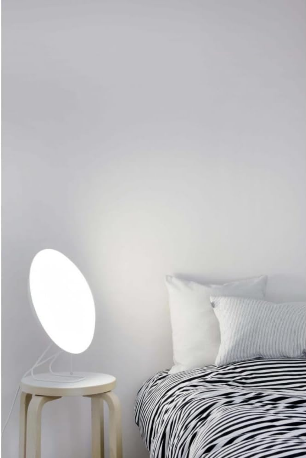
Image: The Rondo 400 LED lamp positioned on a bedside table.