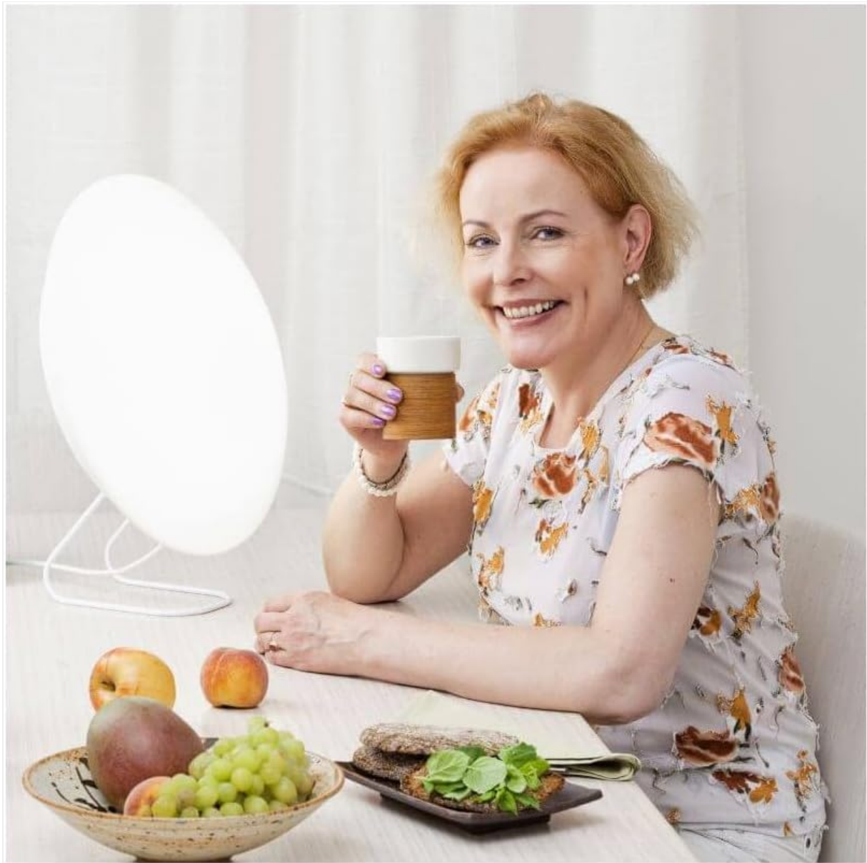
Image: A user enjoying the light from the Rondo 400 LED lamp during a meal.