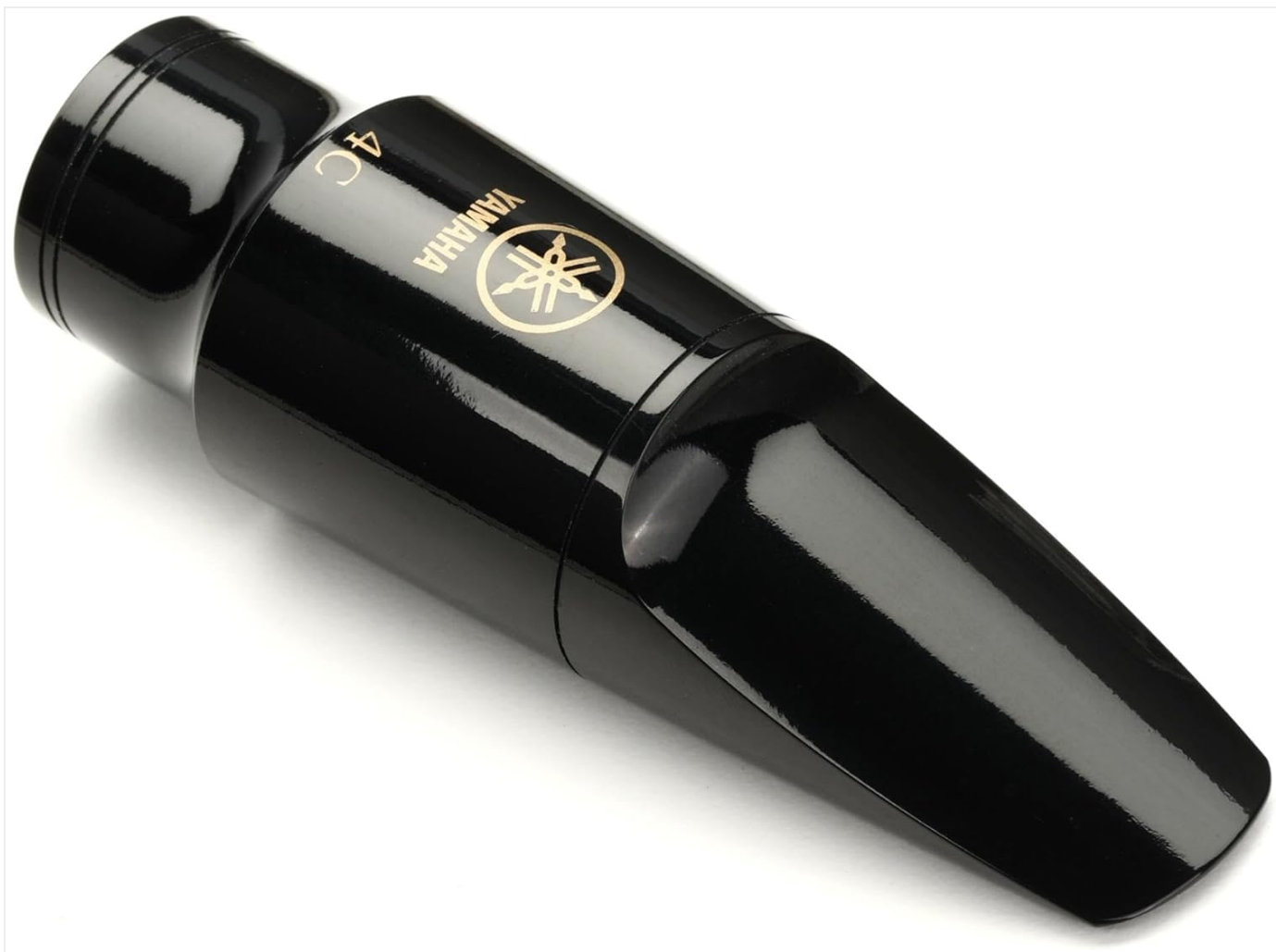
Figure 1: Front view of the Yamaha 4C Alto Saxophone Mouthpiece, showcasing its black finish and gold Yamaha logo.