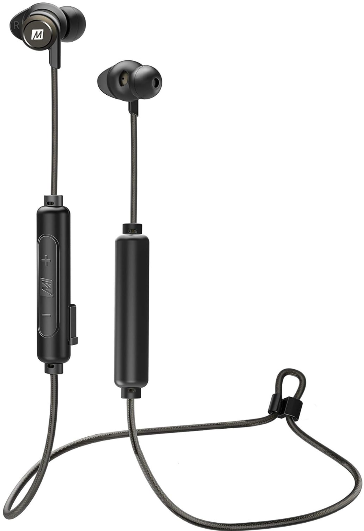
Image: Close-up of the MEE audio X5-G2-2019 headphones showing the inline control module with volume and multi-function buttons.