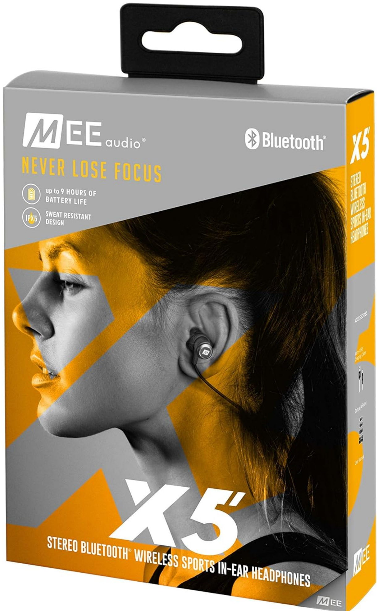
Image: Retail packaging of the MEE audio X5-G2-2019 headphones, showing the product and accessories.