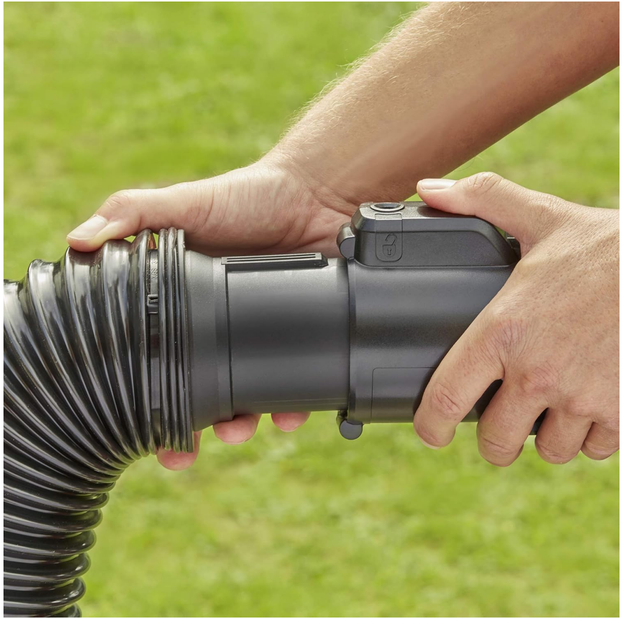
Image: Hands connecting the flexible hose, which leads to the collection bag, to the vacuum intake port of the main unit.