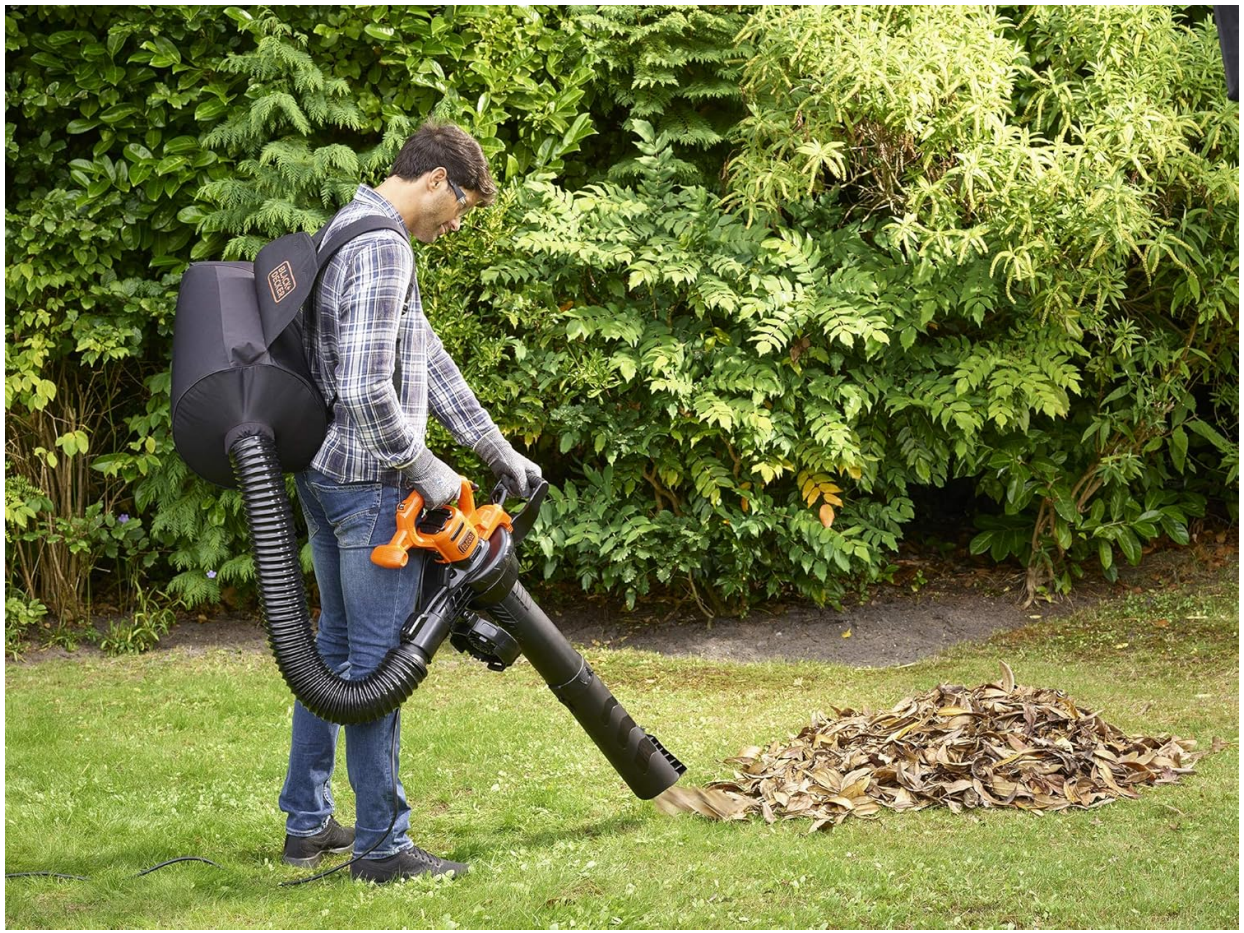
Image: A person using the BLACK+DECKER leaf vacuum to collect leaves, with the backpack collection bag visible on their back.