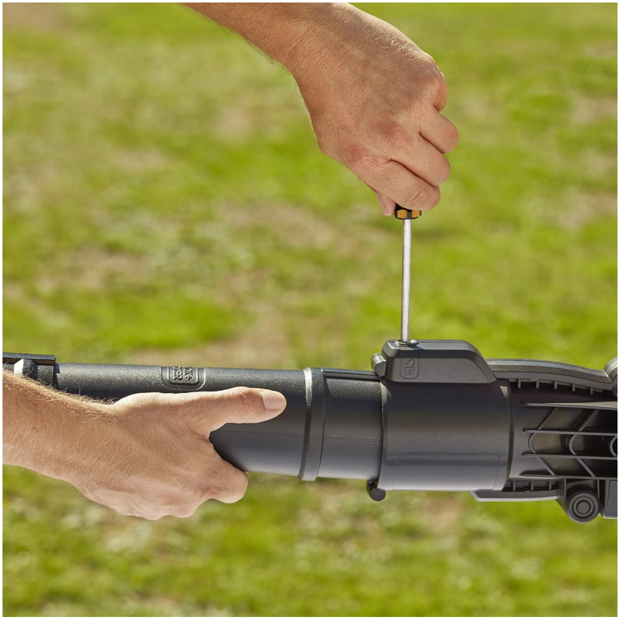
Image: A user attaching the blower tube to the main unit of the leaf blower, demonstrating the secure connection process.