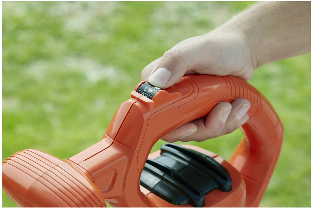
Image: A close-up view of a hand adjusting the speed control dial on the handle of the leaf blower, showing numerical settings.

Connect the power cord to a suitable outdoor extension cord and then to a power outlet. The tool features adjustable blowing and suction powers, allowing you to adapt performance to the task. Use the speed control dial (refer to image) to select the desired power level.