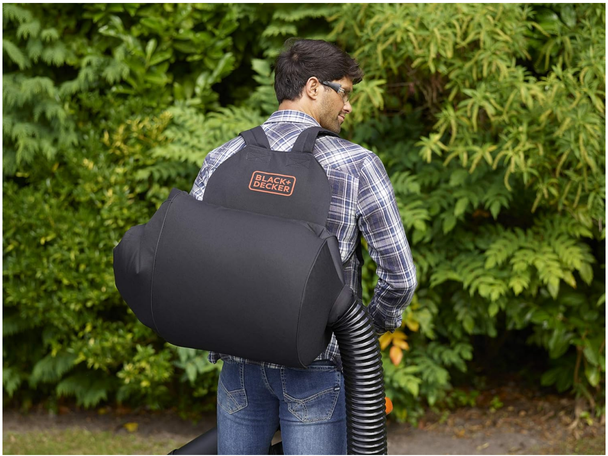
Image: A person from behind, wearing the BLACK+DECKER branded backpack collection bag, demonstrating its ergonomic design.