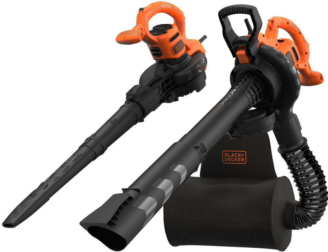
Image: The BLACK+DECKER 3-in-1 Electric Leaf Blower and Vacuum, showcasing its components including the main unit, blower tube, vacuum tube, and backpack collection bag.