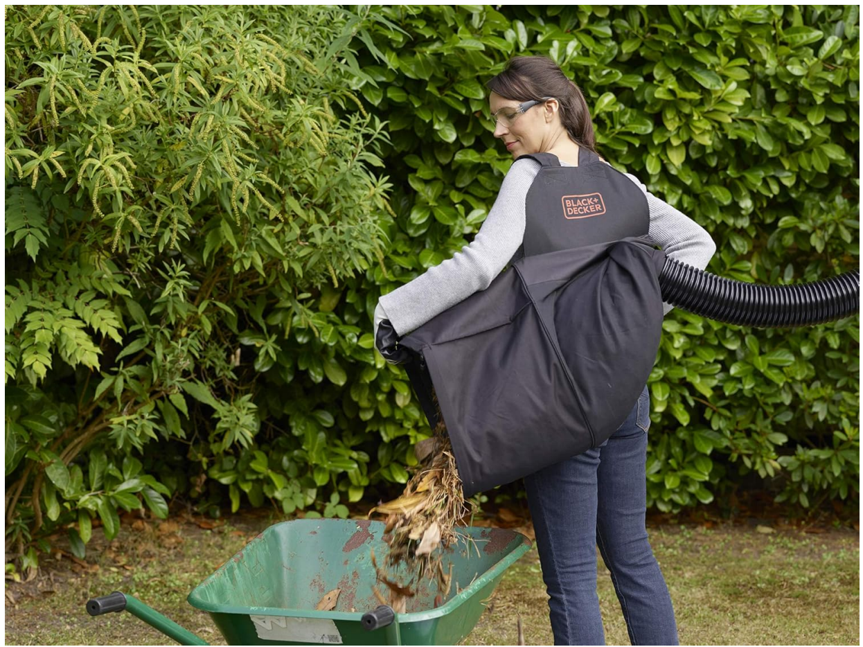
Image: A person emptying the contents of the BLACK+DECKER backpack collection bag into a green wheelbarrow, showing the ease of disposal.

When the collection bag is full, turn off and unplug the tool. The 55L leaf collection backpack features a quick-release system for easy removal and emptying. Empty the shredded material into a compost bin or waste receptacle.