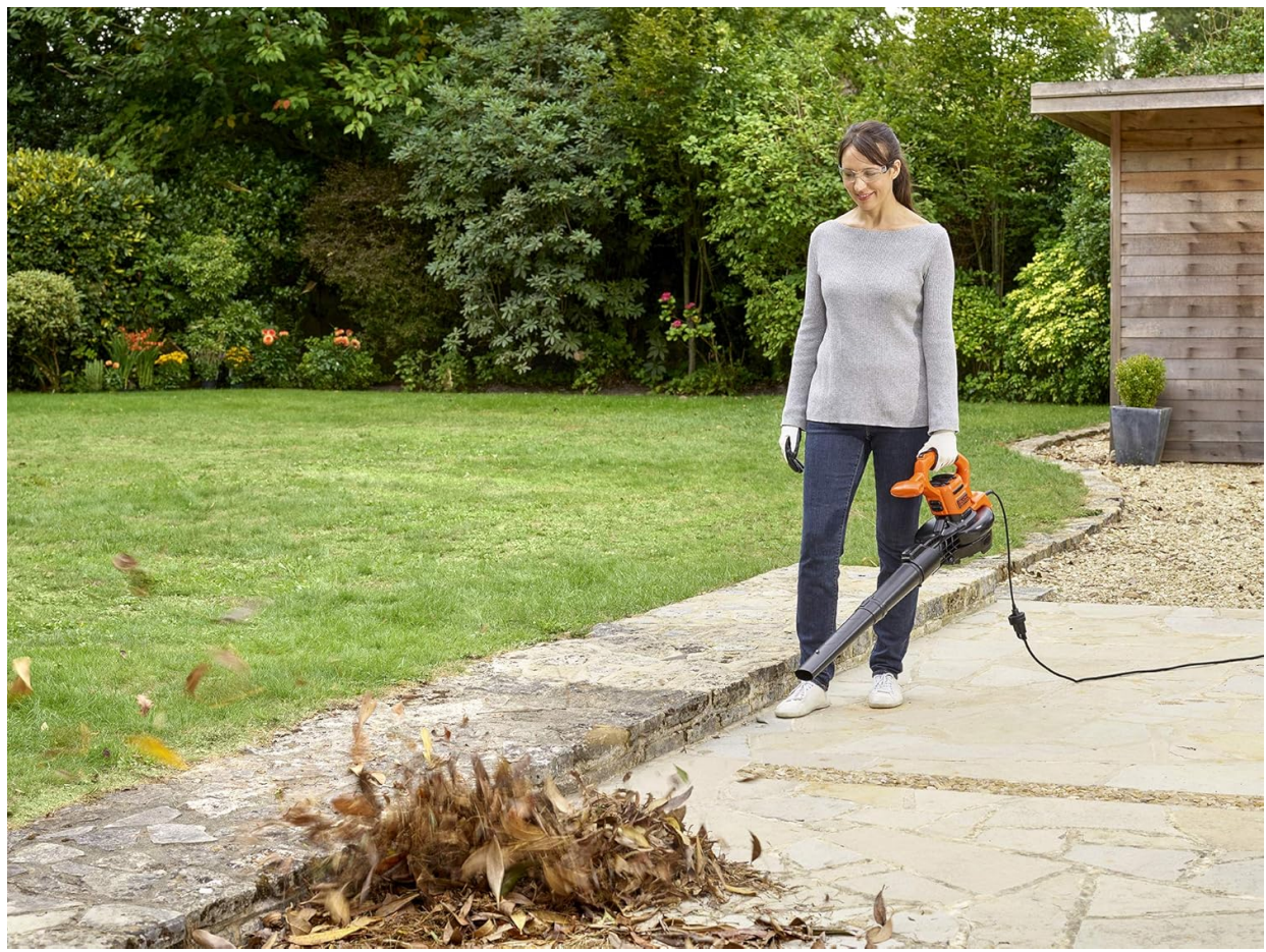
Image: A person using the BLACK+DECKER leaf blower to clear a patio, demonstrating the tool in action during blowing mode.