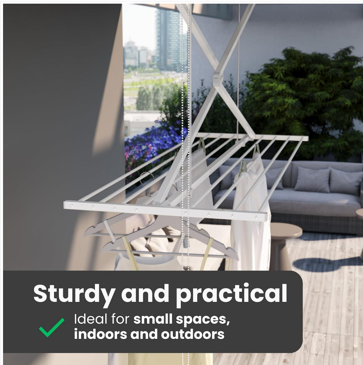
Image: A detailed view of the pulley system and the aluminum frame, highlighting the components involved in raising and lowering the rack.

Your browser does not support the video tag.