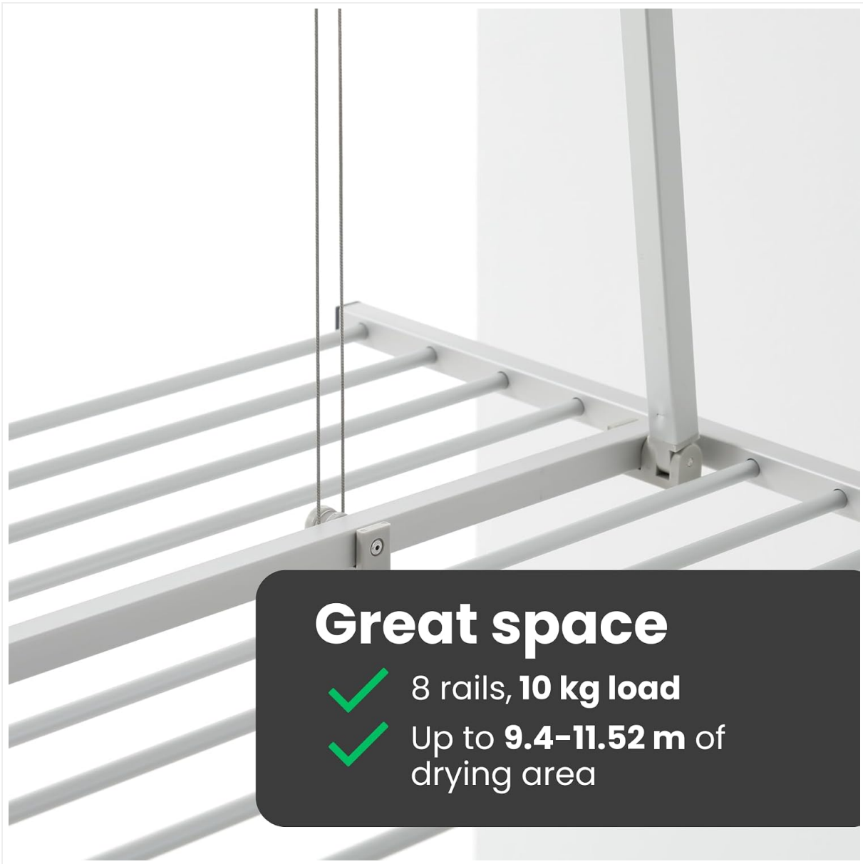
Image: A close-up view highlighting the durable aluminum and stainless steel construction of the foxydry Mini, designed for long-lasting use.