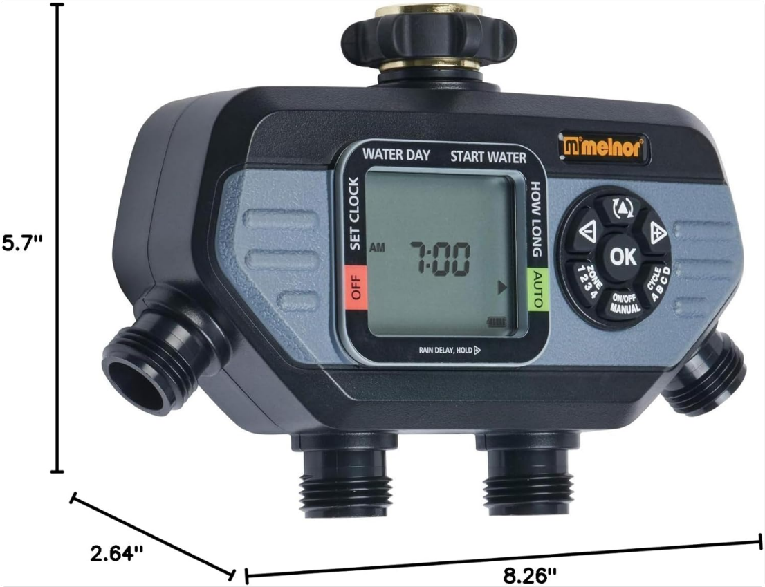
Figure 6: Product dimensions for installation planning.

The Melnor HydroLogic 4-Zone Digital Water Timer is backed by a Melnor 7-Year Limited Warranty. Melnor stands behind its products and is committed to customer satisfaction.