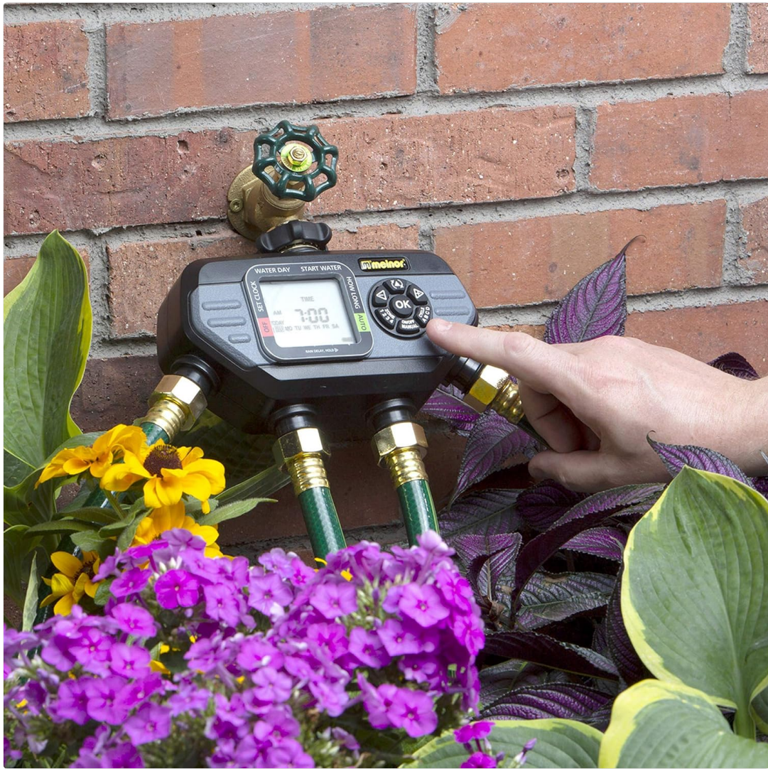
Figure 3: The timer with hoses attached, ready for use in a garden.