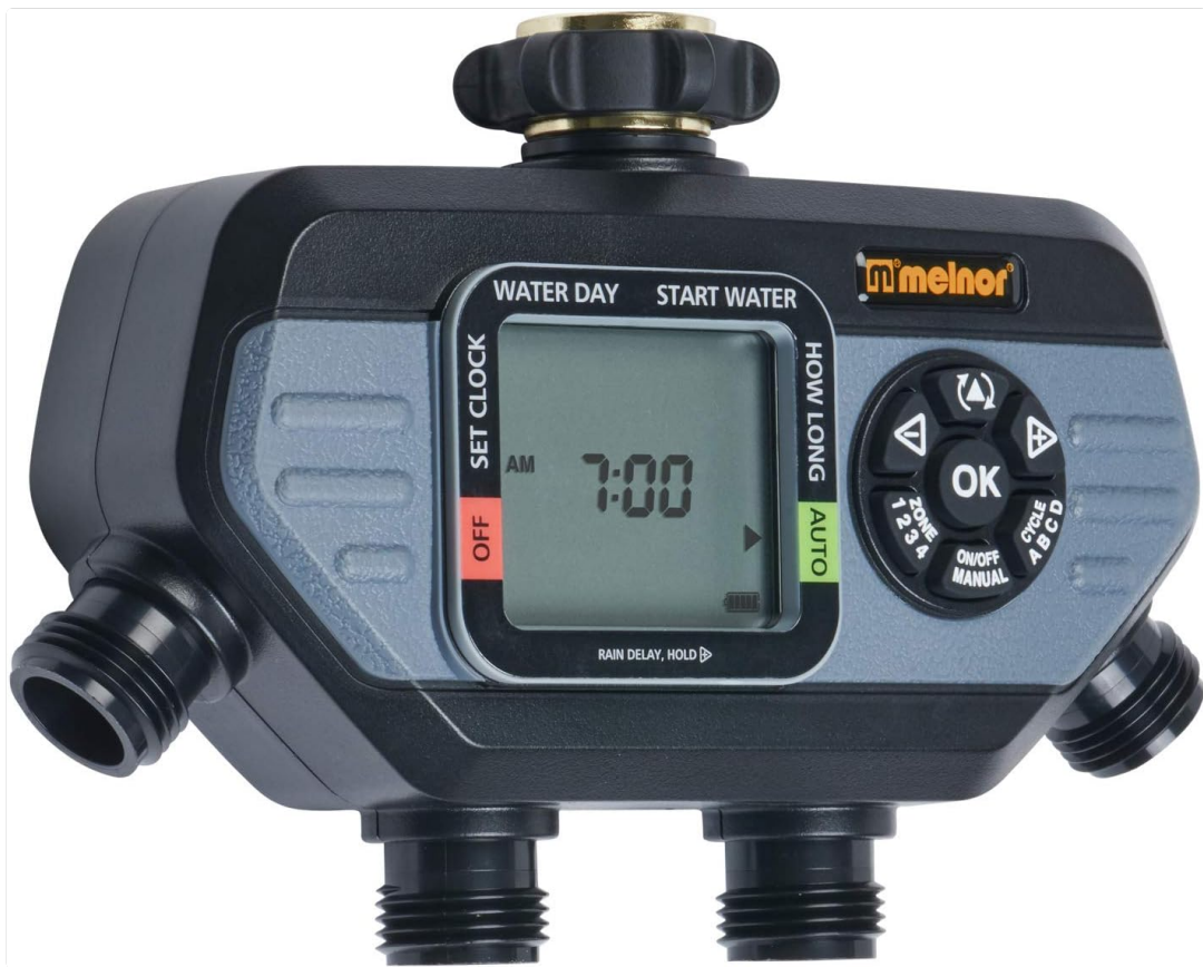
Figure 2: The Melnor HydroLogic timer connected to an outdoor faucet.