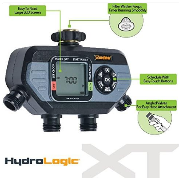
Figure 5: Stainless steel filter washer, essential for preventing clogs and leaks.