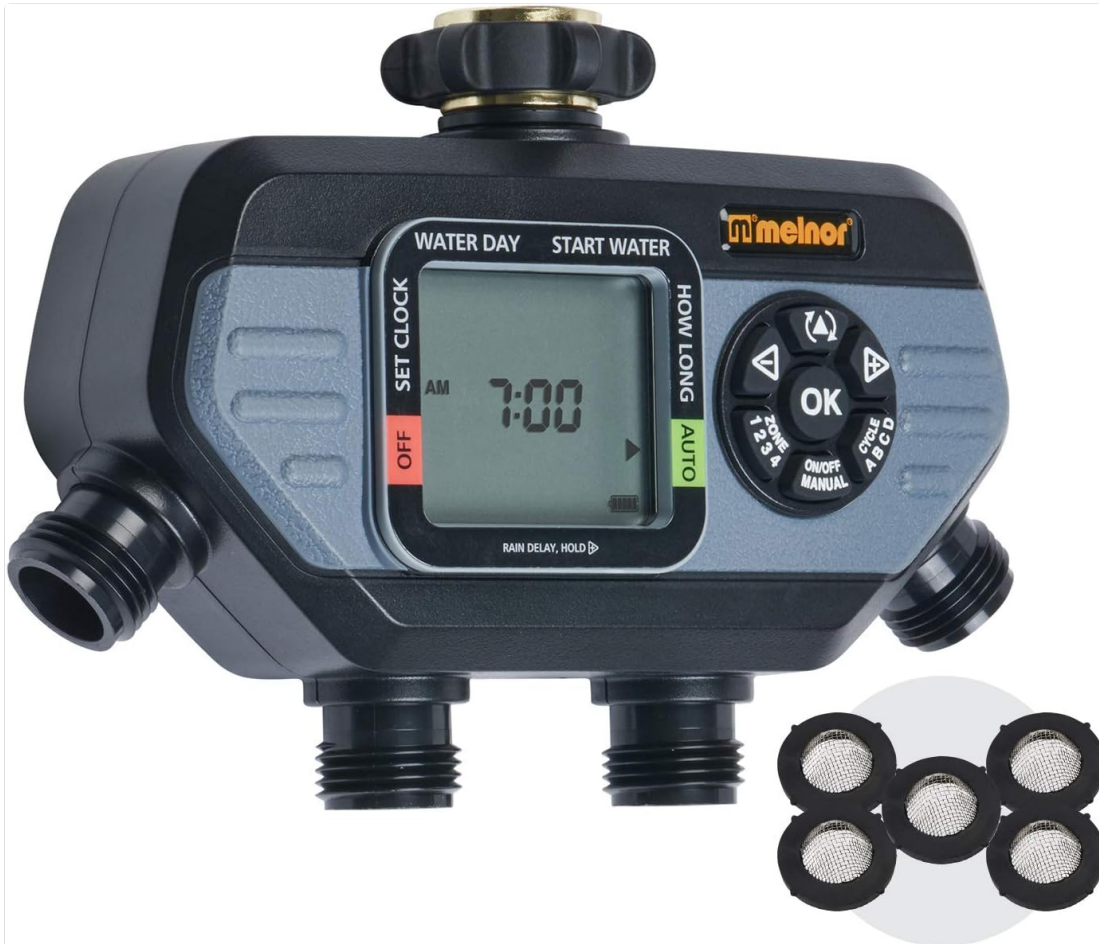
Figure 1: Melnor HydroLogic 4-Zone Digital Water Timer with included stainless steel filter washers.

This bundle includes one HydroLogic 4-Zone Digital Water Timer and five extra stainless steel filter washers, ensuring a leak-free seal and prolonged product life.