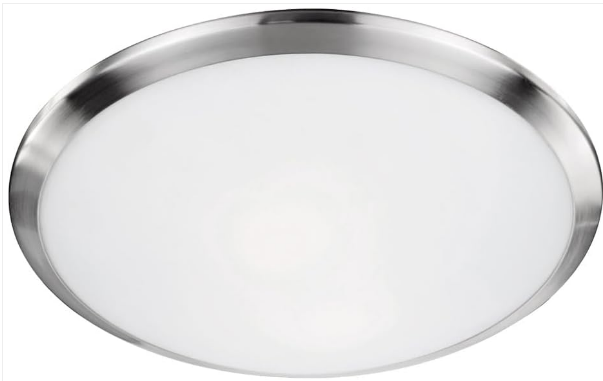
Image 1.1: Kuzco Lighting 51561BN Malta Flush Mount, Brushed Nickel finish.

This manual provides instructions for the safe installation, operation, and maintenance of the Kuzco Lighting 51561BN Malta Flush Mount. This fixture is a single lamp round flush mount with a metal trim and a white opal glass shade, designed for indoor use.