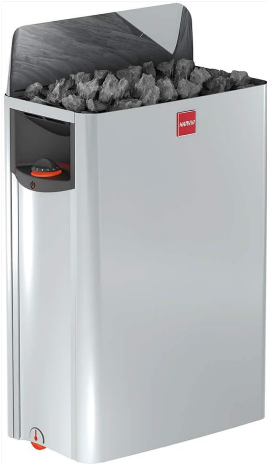
Front view of the Harvia The Wall SW90 electric sauna heater, showcasing its sleek stainless steel design and the top compartment filled with sauna stones.