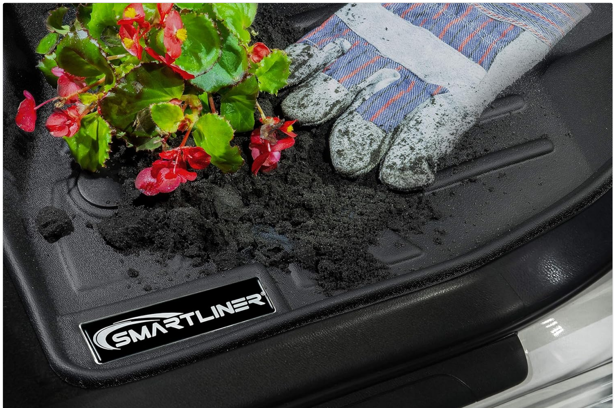
Image: Dirt and Debris Containment. This close-up shows the mat effectively containing dirt and plant debris, preventing it from spreading onto the car's carpet.