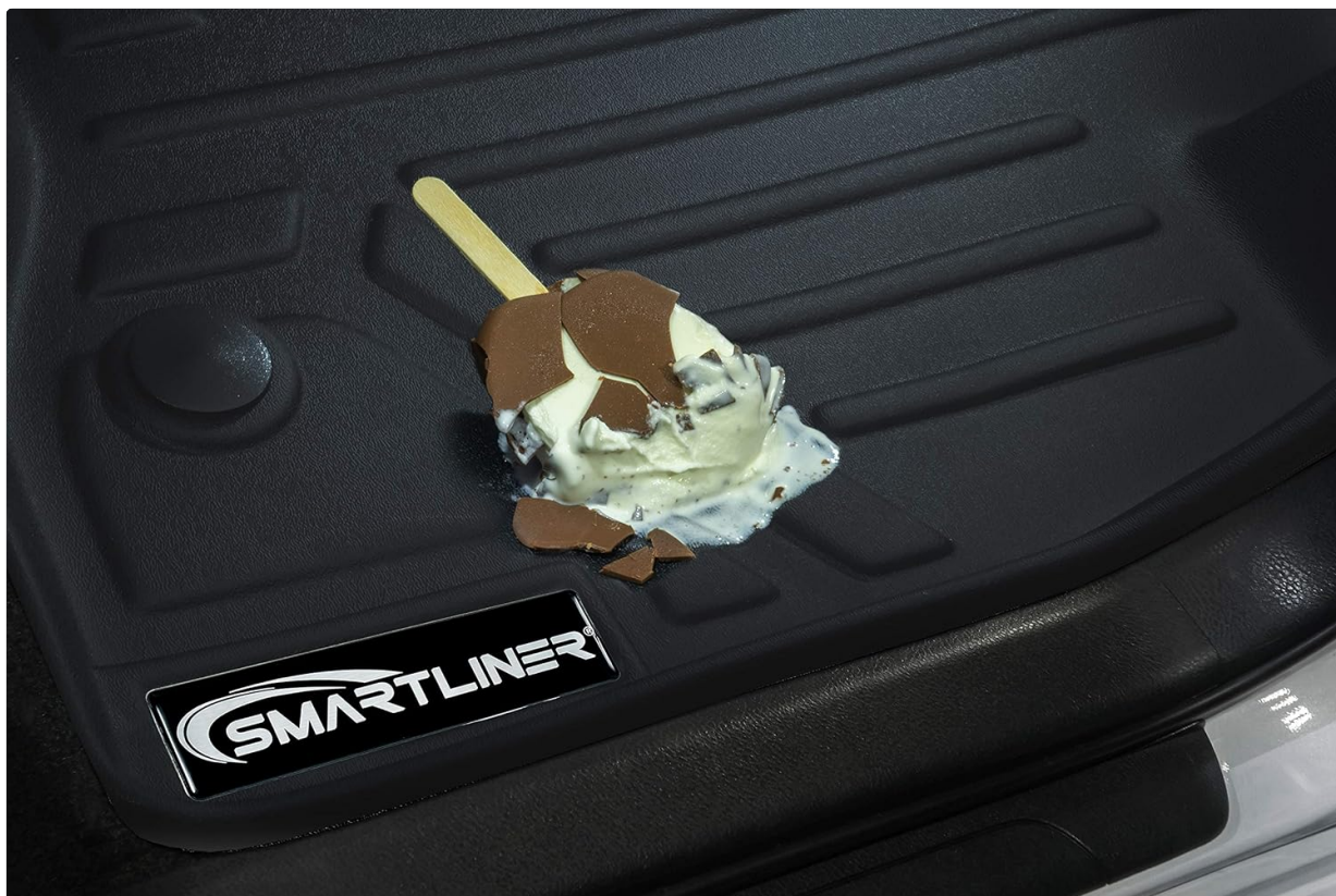
Image: Spill Protection. A spilled ice cream on the mat demonstrates its ability to hold liquids, protecting the underlying carpet from stains.