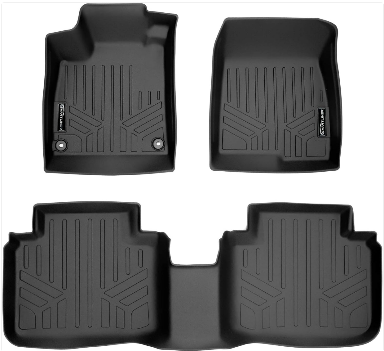
Image: Complete 2-Row Floor Mat Set. This image displays the full set of SMARTLINER Custom Fit Floor Mats, including the front driver and passenger side mats, and the one-piece rear liner, designed for the Honda Accord.