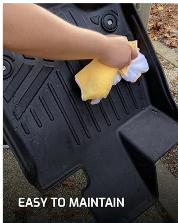
Image: Easy to Maintain. This image shows a hand wiping down a SMARTLINER mat, illustrating the ease with which these mats can be cleaned.