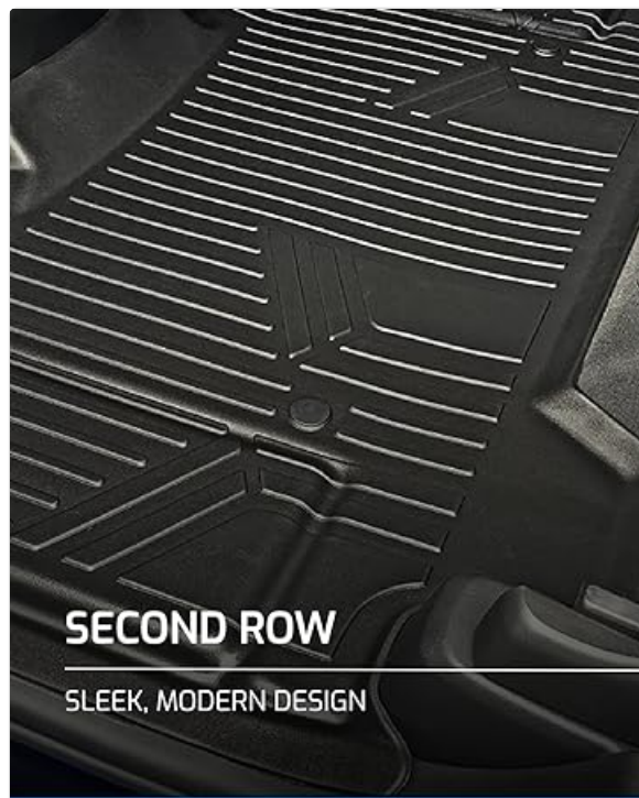
Image: Second Row Sleek, Modern Design. This image shows the second-row floor mat, emphasizing its sleek and modern design that complements the vehicle's interior.