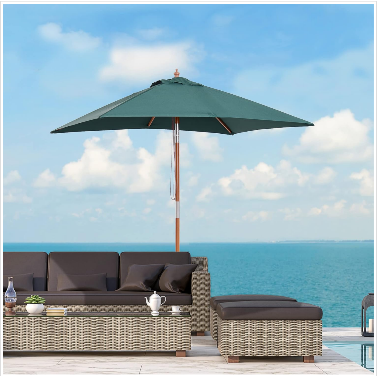
Image: The Outsunny Rectangular Wooden Polyester Patio Umbrella providing shade over outdoor furniture.