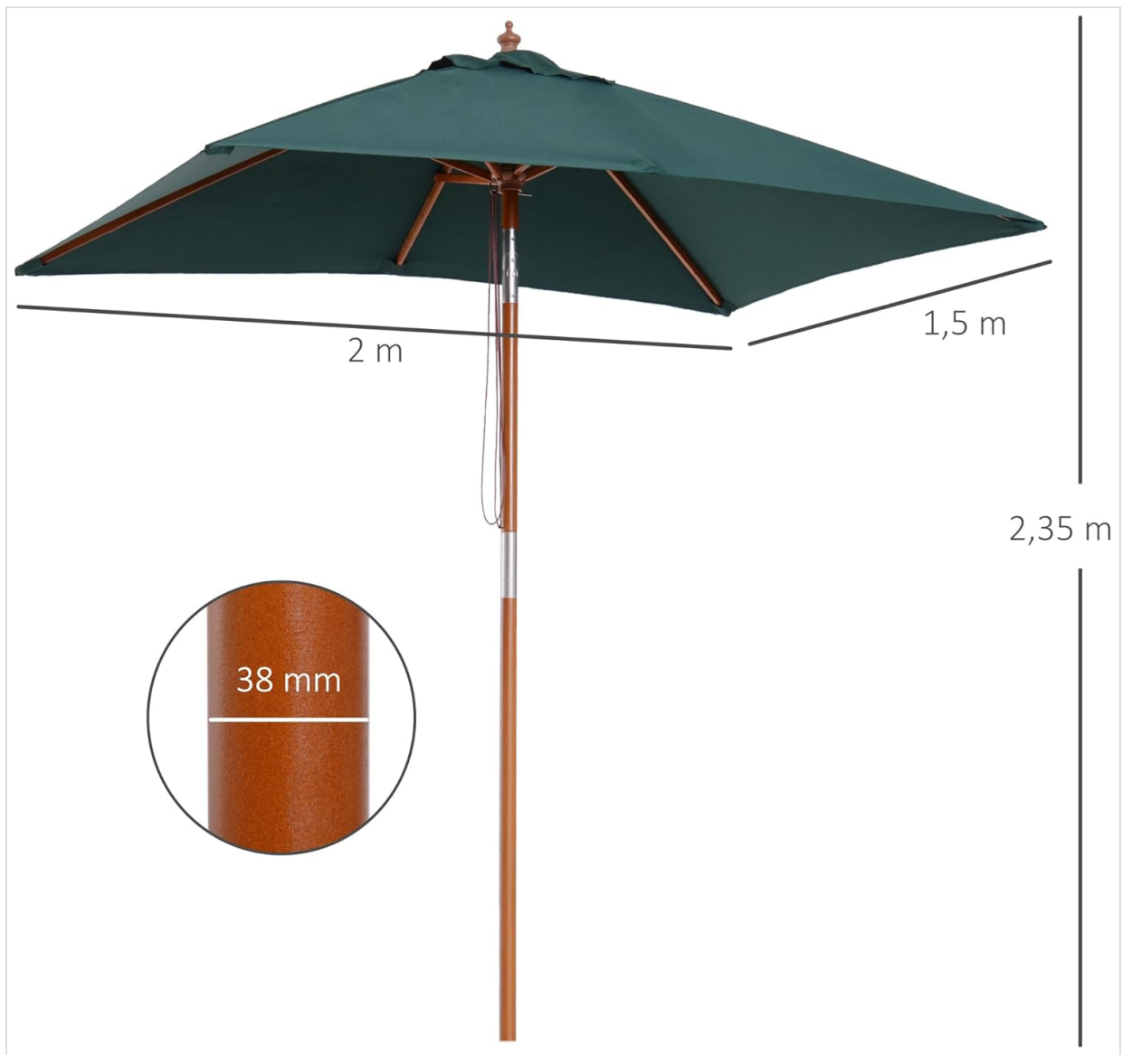
Image: Detailed dimensions of the umbrella, including its 2m length, 1.5m width, 2.35m height, and 38mm pole diameter.