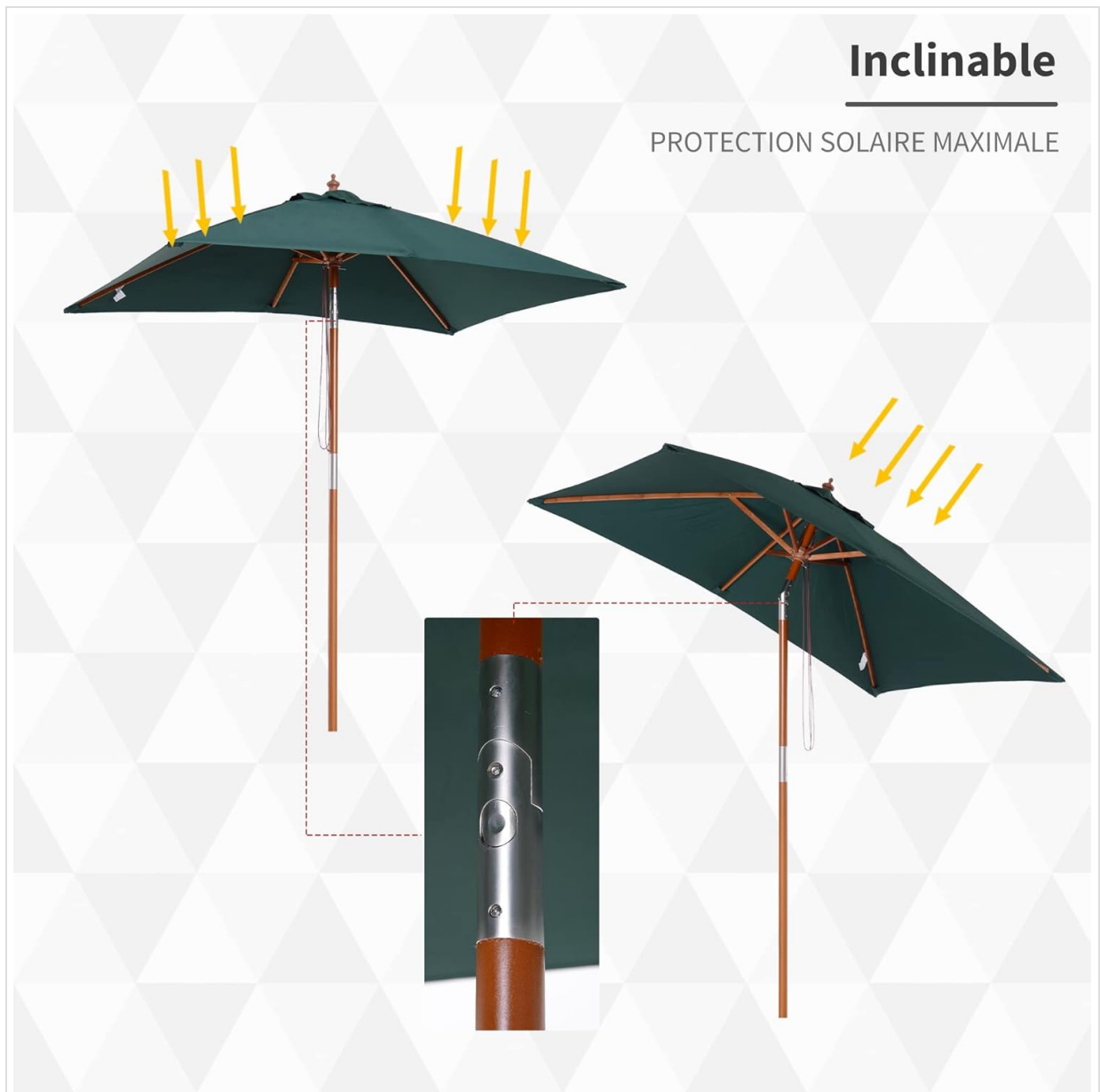
Image: The umbrella's inclination feature provides maximum sun protection by adjusting the canopy angle.