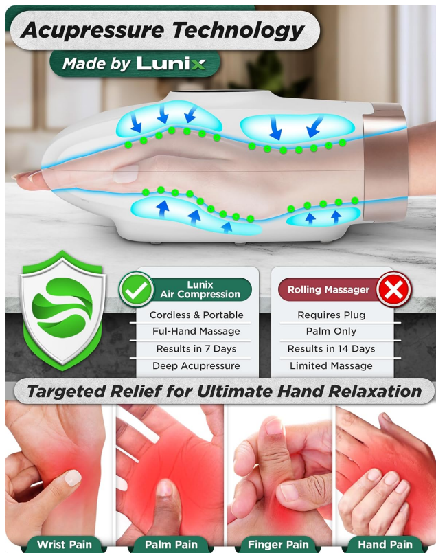
Illustration of the acupressure technology, highlighting how air compression targets pressure points for effective relief.