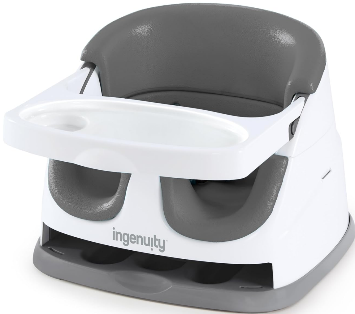
The Ingenuity Baby Base 2-in-1 Booster Feeding and Floor Seat.