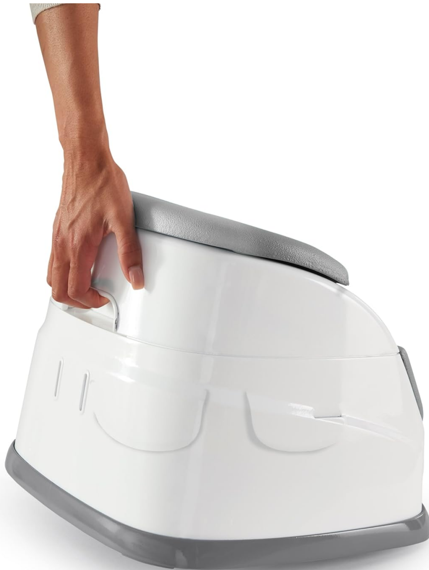
View of the underside showing strap storage.