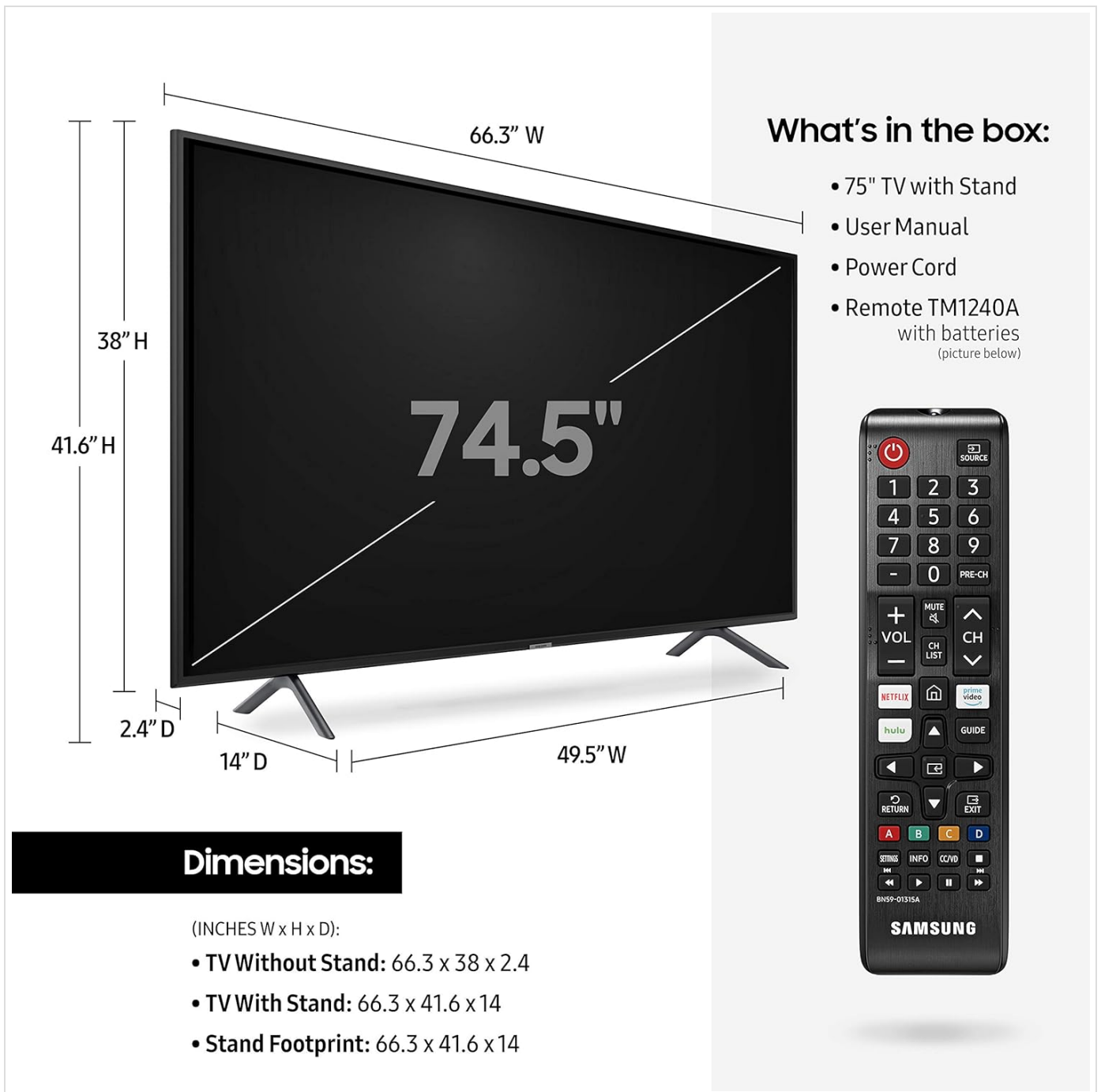
Figure 2.2: Dimensions and included accessories.

This image provides a detailed diagram of the TV's dimensions both with and without the stand, along with a visual representation of the remote control and other included items.