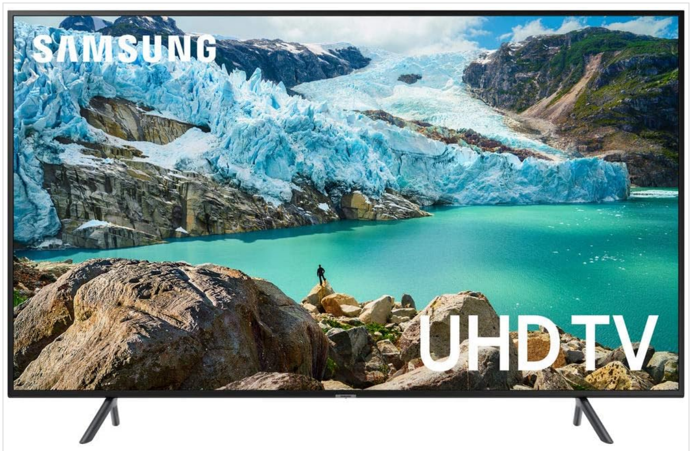
Figure 2.1: Front view of the Samsung 75-inch 4K UHD Smart TV.

This image displays the full front view of the Samsung 75-inch 4K UHD Smart TV, showcasing its slim bezels and stand design.