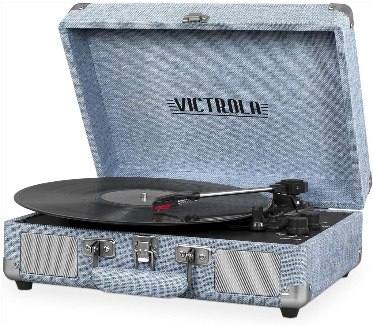
Image: The Victrola Journey record player, showcasing its open suitcase design with a record ready for playback.