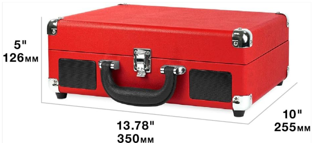
Image: Dimensional drawing of the record player, indicating its compact size.