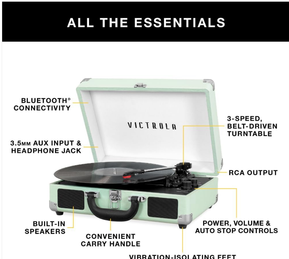
Image: Labeled diagram highlighting key features such as Bluetooth connectivity, auxiliary input, headphone jack, built-in speakers, carry handle, vibration-isolating feet, 3-speed turntable, RCA output, and control knobs.

Familiarize yourself with the components and controls of your record player: