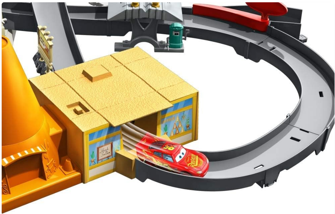
Image: Lightning McQueen positioned on the rotating car lift at Ramone's garage, ready for a 'customization'.