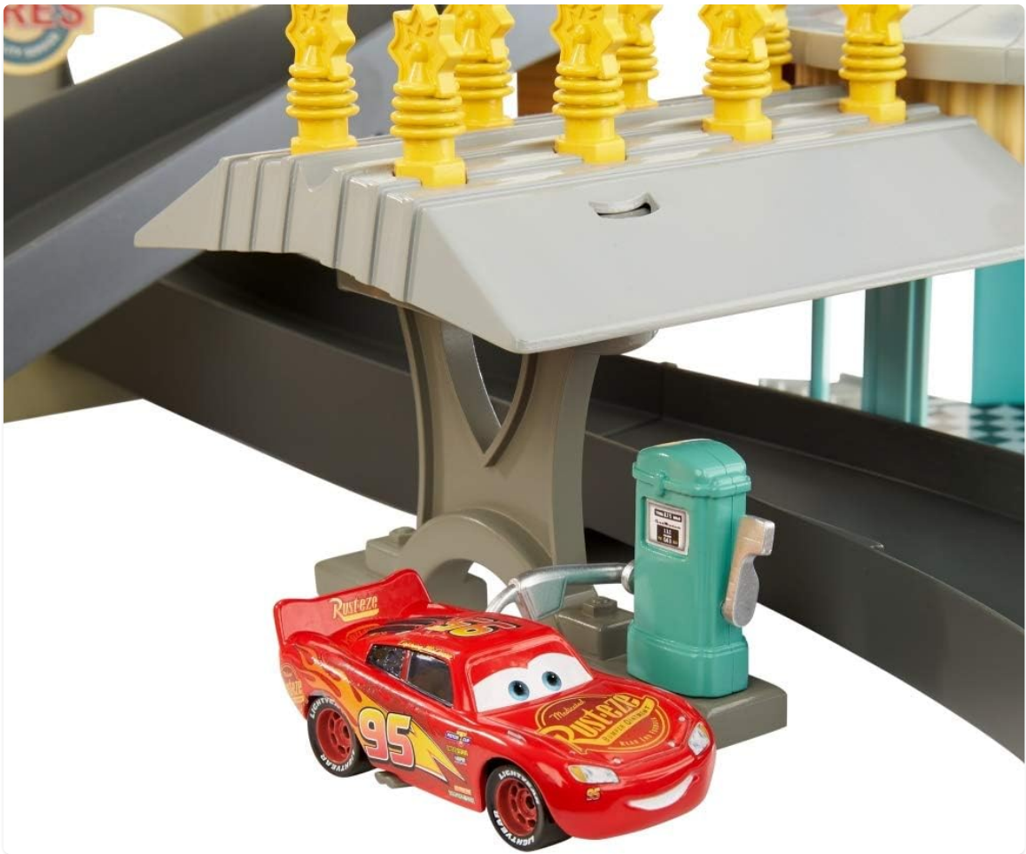
Image: Lightning McQueen is shown at the gas pumps of Flo's V8 Cafe, simulating a pit stop.