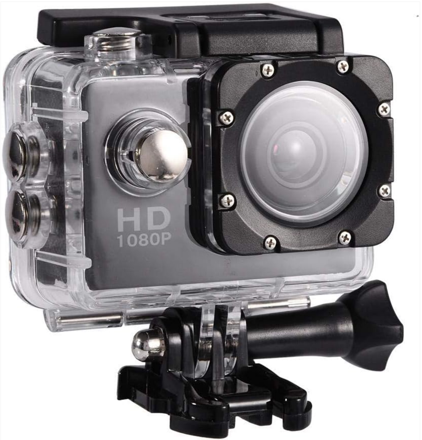
Figure 3.3: Camera securely housed within its waterproof casing.