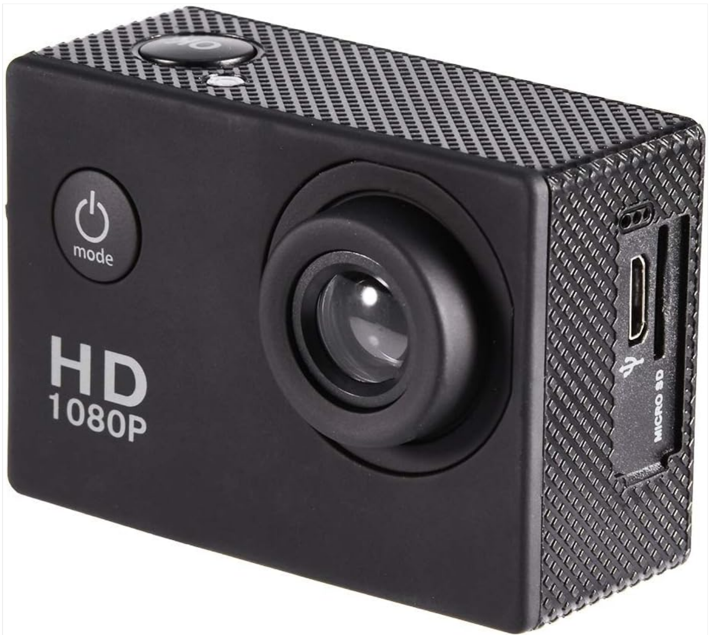
Figure 3.1: Front and side view of the camera, showing lens, mode button, and MicroSD slot.