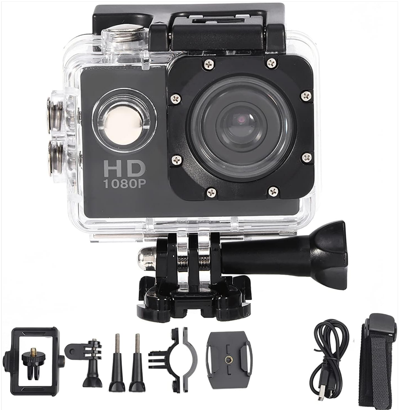
Figure 2.1: Serounder Action Camera Kit and included accessories.