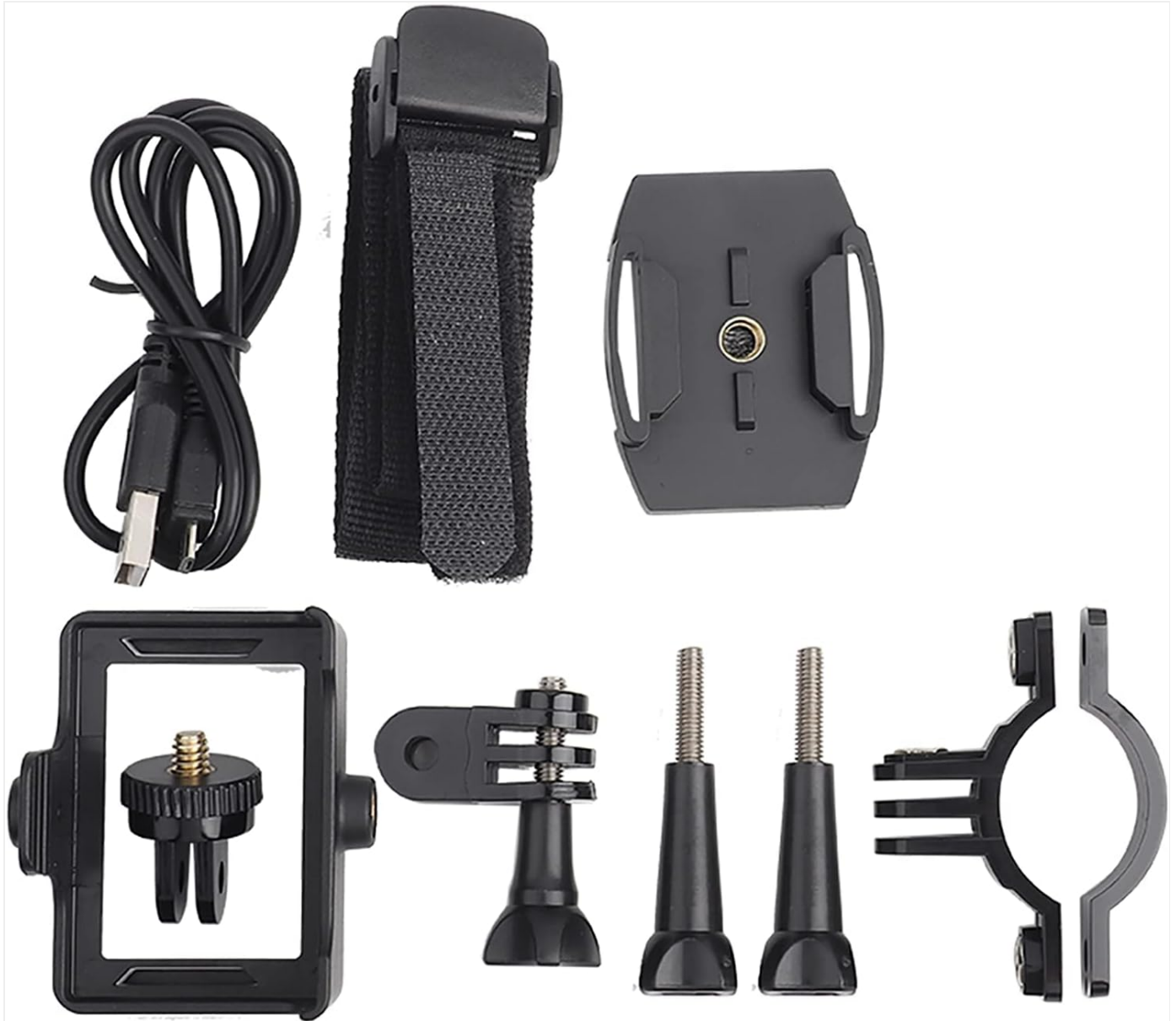
Figure 4.1: Selection of included mounting accessories.

The kit includes various mounts for different activities. Refer to the diagrams below for common attachment methods.