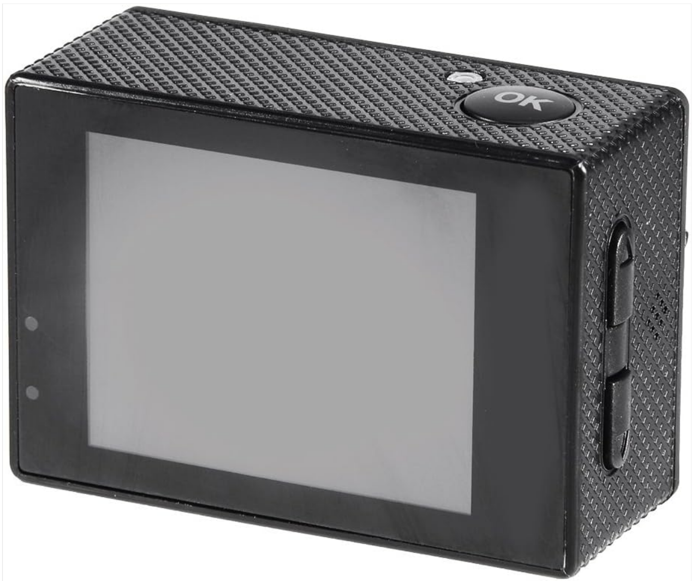
Figure 3.2: Back view of the camera, highlighting the LCD screen and OK button.