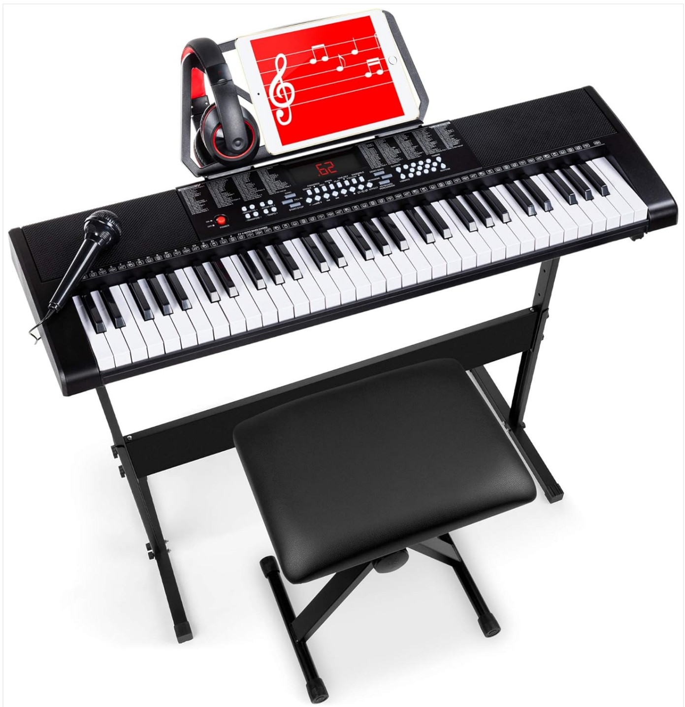
Image: The 61-Key Electronic Keyboard Piano set, including the keyboard, stand, bench, headphones, and microphone.