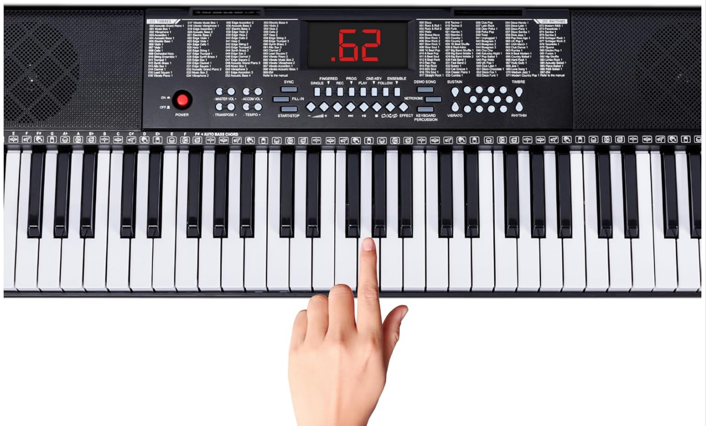
Image: The control panel highlighting the "3 Teaching Modes" section.