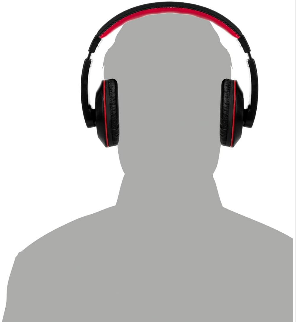
Image: Padded headphones and microphone, highlighting the immersive accessory experience.