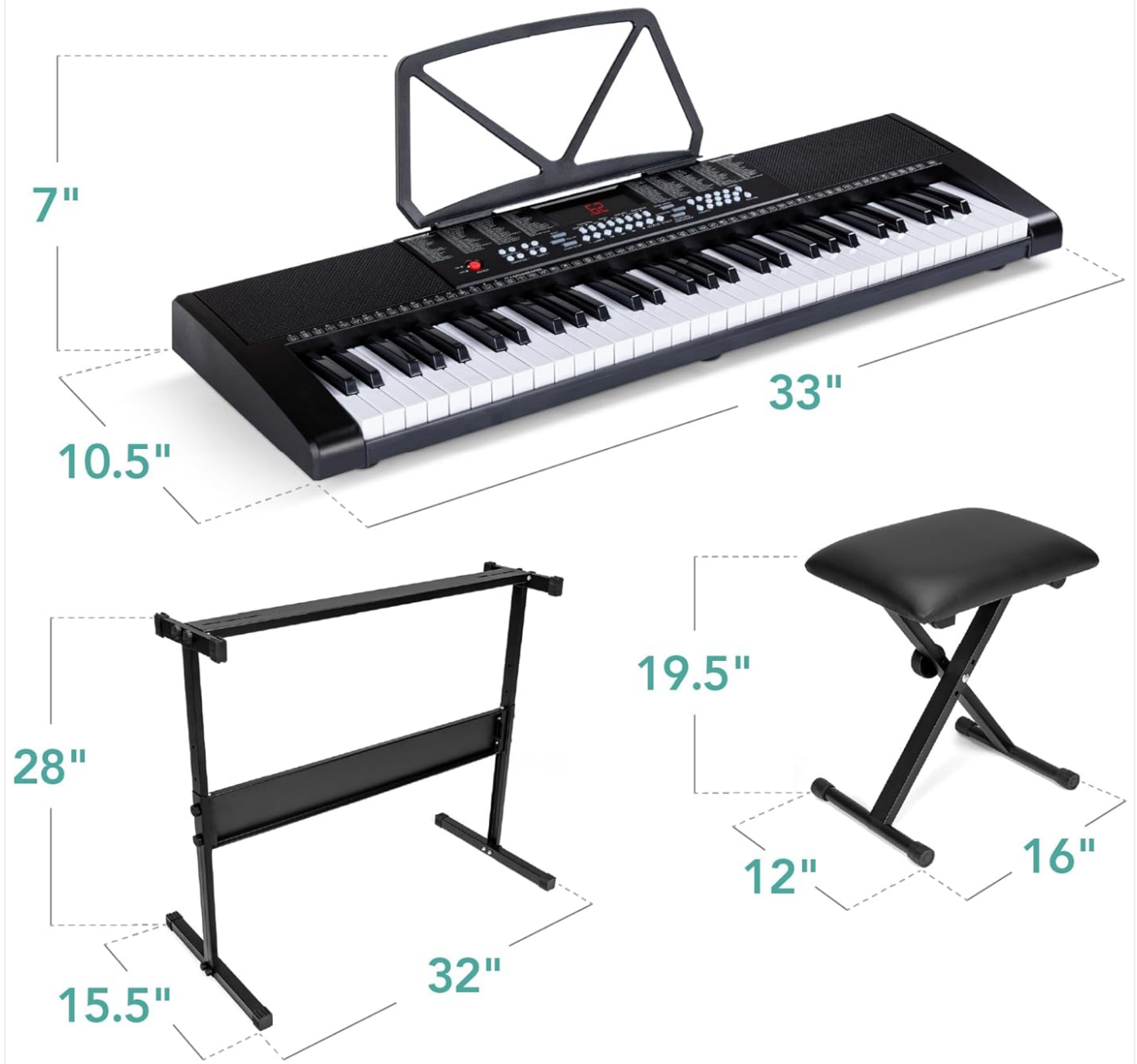
Image: Detailed product dimensions for the keyboard, stand, and stool.