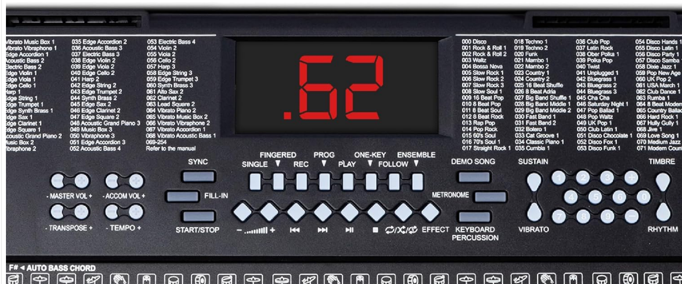
Image: The control panel displaying options for timbre, rhythm, and demo songs.