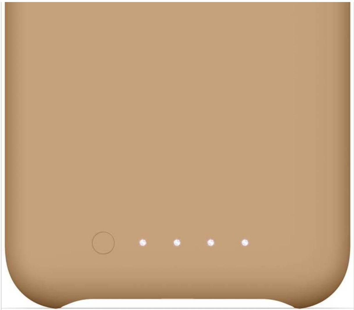
Figure 3: Back view of the Mophie Juice Pack Access, showing the power button and LED indicator lights for battery status.