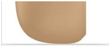
Figure 2: Side view of the Mophie Juice Pack Access, highlighting its slim profile with the iPhone securely in place.