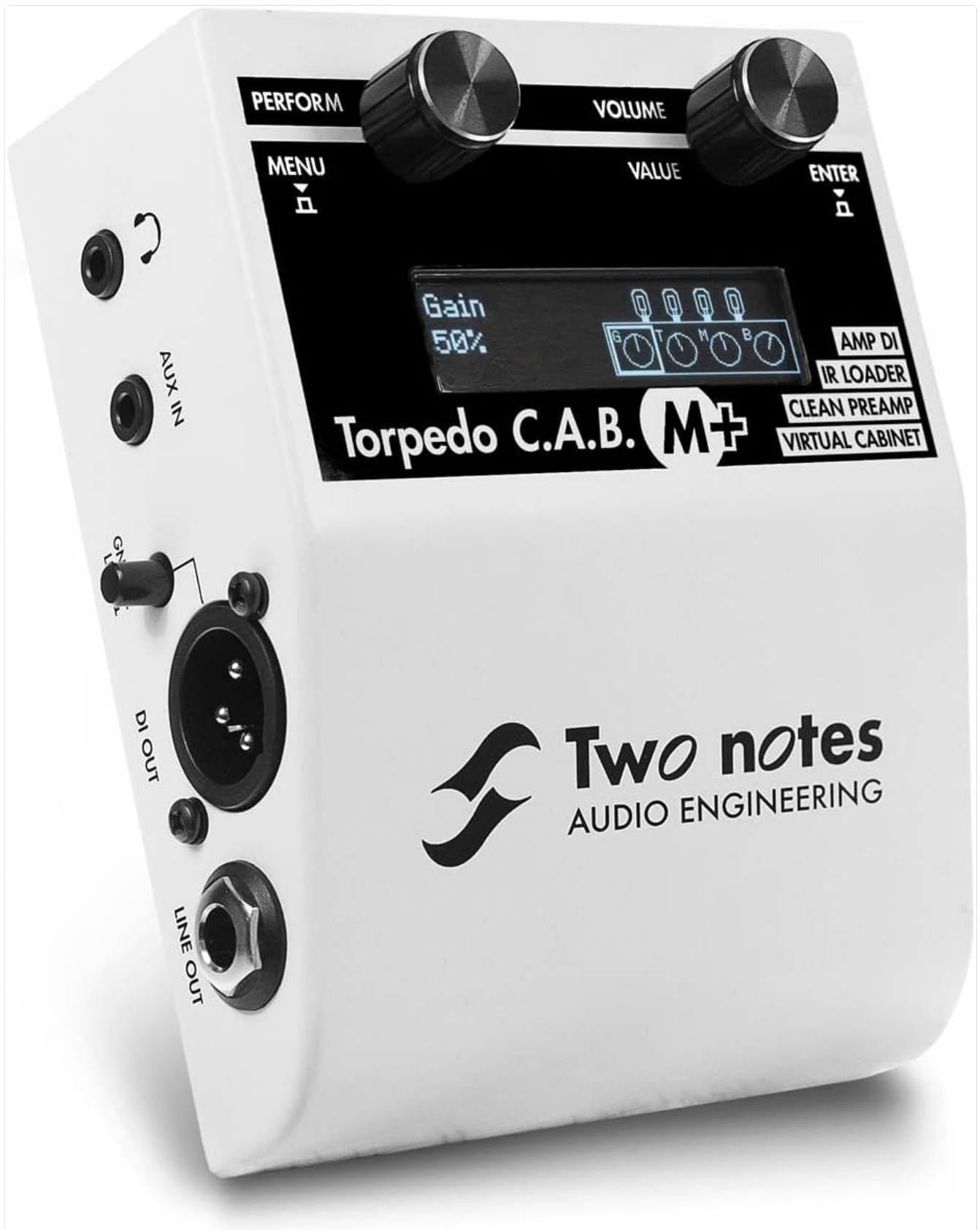
Image: Rear view of the Two Notes Torpedo C.A.B. M+ pedal, showing the power input, USB port, GTR/AMP IN, SPEAKER OUT, IN LEVEL switch, DI OUT, LINE OUT, AUX IN, and headphone jack.