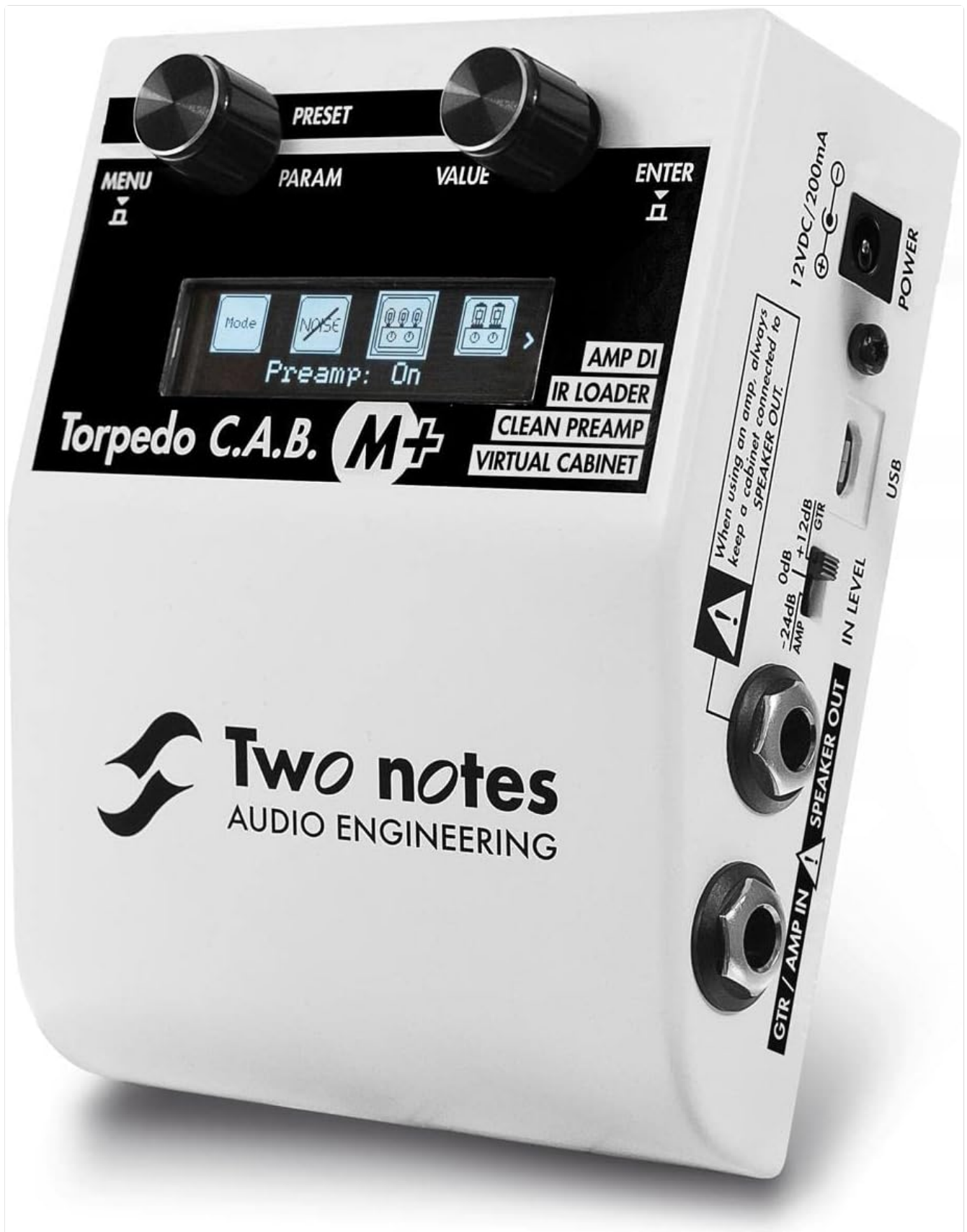
Image: Front view of the Two Notes Torpedo C.A.B. M+ pedal, showcasing its display, control knobs, and front-facing inputs/outputs.