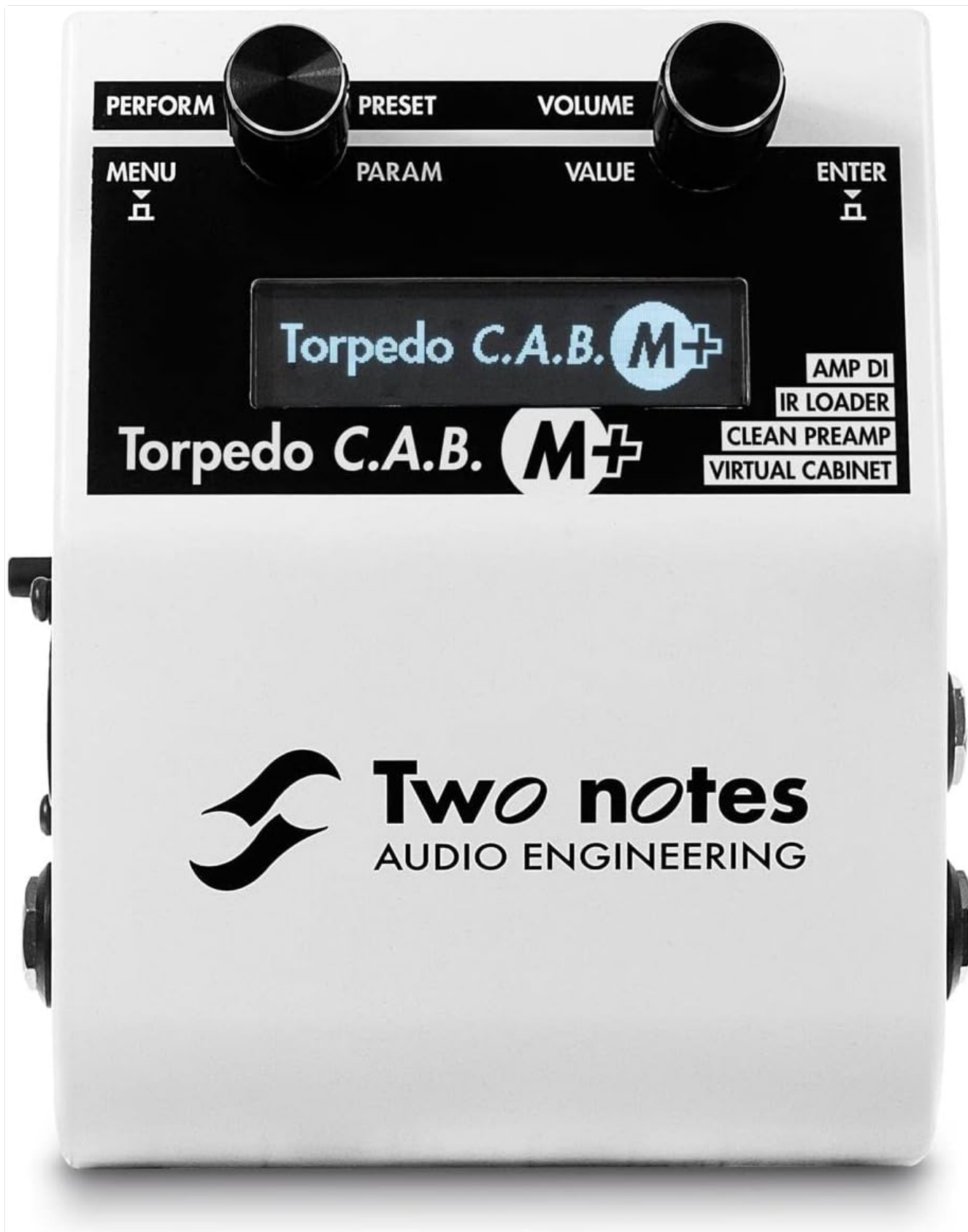
Image: Close-up of the Two Notes Torpedo C.A.B. M+ display, showing the 'Preamp: On' status, and the surrounding control knobs and buttons.