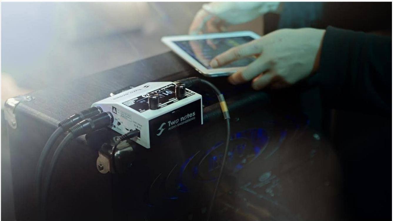
Image: The Two Notes Torpedo C.A.B. M+ pedal connected to a tablet, demonstrating its compatibility with external control applications for enhanced user experience.

For advanced control and access to the full library of Two Notes virtual cabinets and microphones, download and install the Torpedo Wall of Sound software on your computer. This software provides a graphical interface for detailed parameter editing, preset management, and purchasing/downloading new cabinet models.