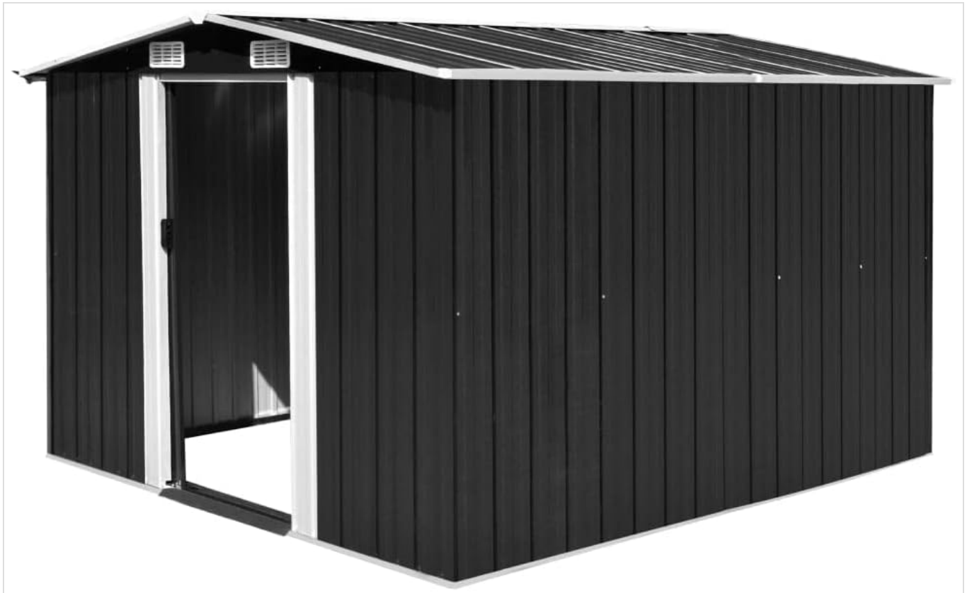
Image: Angled view of the vidaXL Metal Garden Shed, showcasing its charcoal color and open door.

Constructed from durable galvanized steel with a powder-coated surface, the shed is built to withstand various weather conditions, providing protection against dust, dirt, wind, sun, and rain. It features double sliding doors for easy access and ventilation grilles at the front and rear to ensure proper airflow.