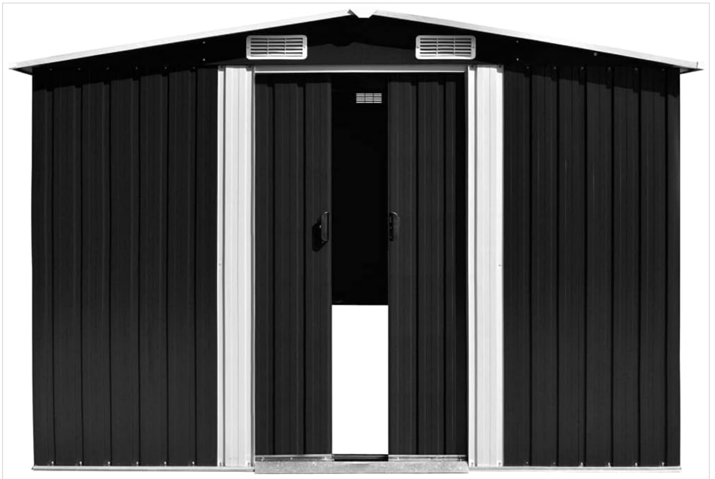
Image: Front view of the vidaXL Metal Garden Shed with both double sliding doors fully open, revealing the interior.