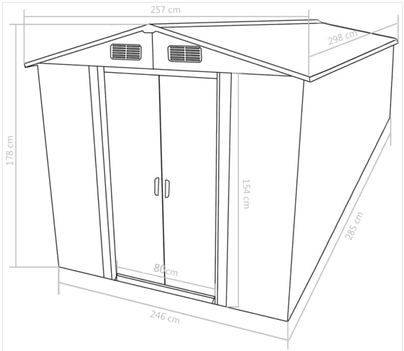
Image: Technical line drawing showing the dimensions of the vidaXL Metal Garden Shed, including height, width, and depth.