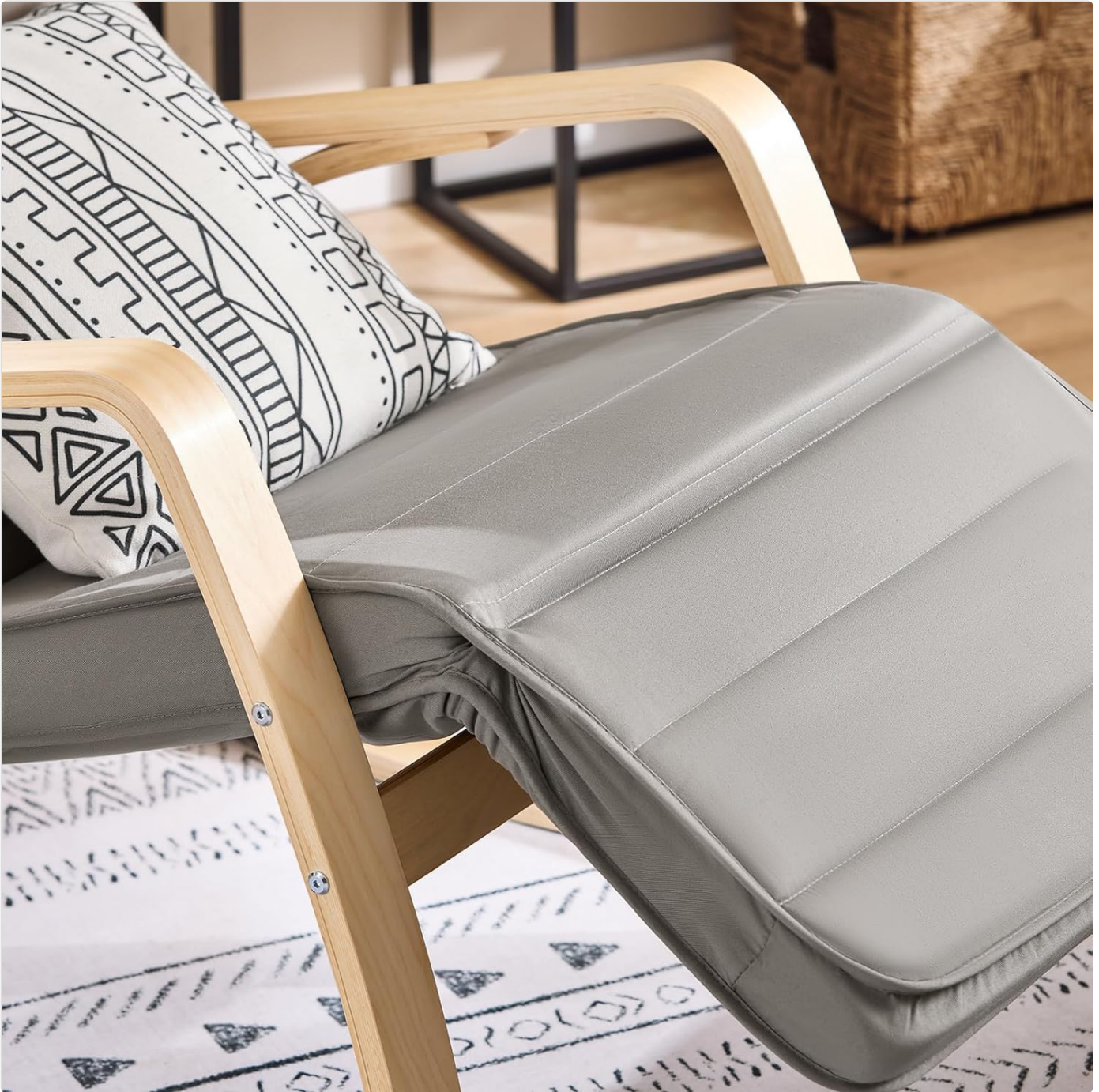
Image: Detailed view highlighting the soft pillow, polycotton seat, birch wood frame, and removable chair cover.