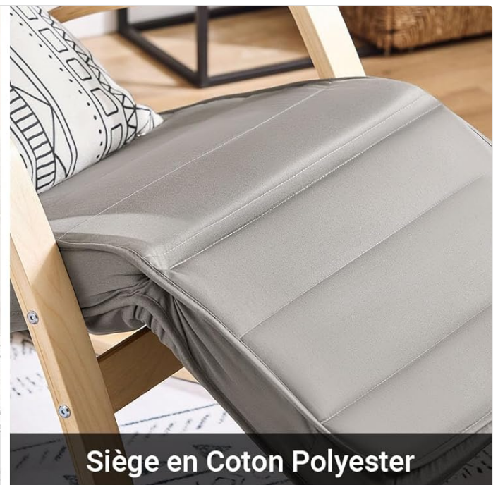
Siège en Coton Polyester