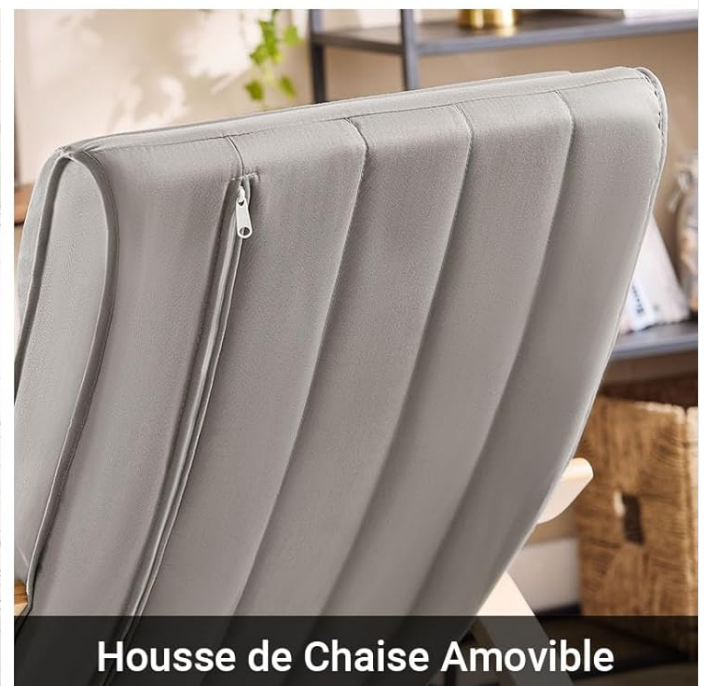
Housse de Chaise Amovible

Image: Icons illustrating the chair's benefits for ultimate relaxation.