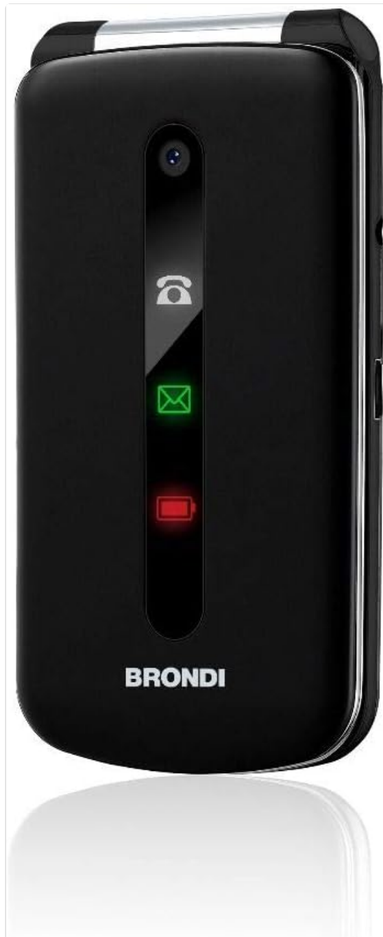
Image: Brondi PRESIDENT mobile phone in its closed state. The front panel displays illuminated icons for incoming calls (phone icon), new messages (envelope icon), and battery status (battery icon), indicating active notifications.