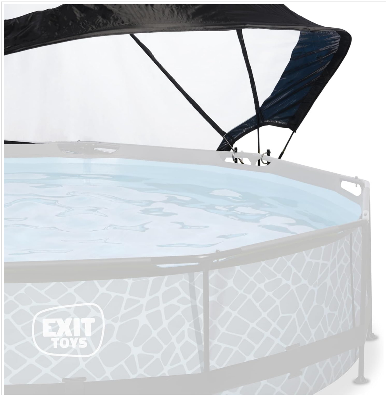
Image 2.1: Detailed view of the hinge mechanism, crucial for the dome's attachment and movement.