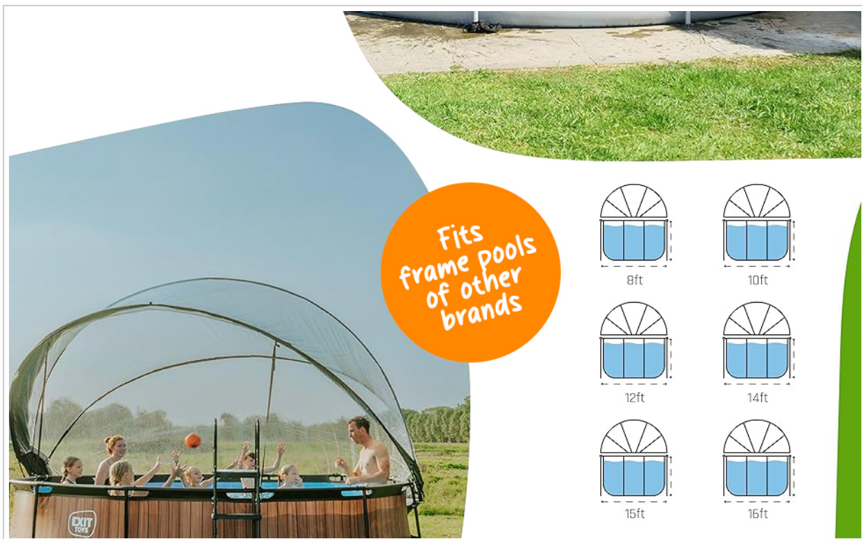
Image 3.2: The closed dome effectively keeps the pool clean from debris.