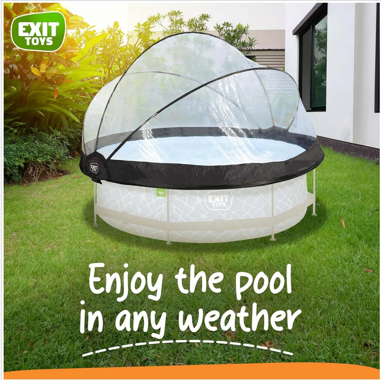
Image 1.1: The EXIT Toys Pool Dome Enclosure providing cover for a round above-ground pool.