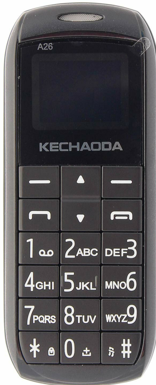
Image: Front view of the KECHAODA A26 Mobile Phone, showcasing its compact design and keypad.