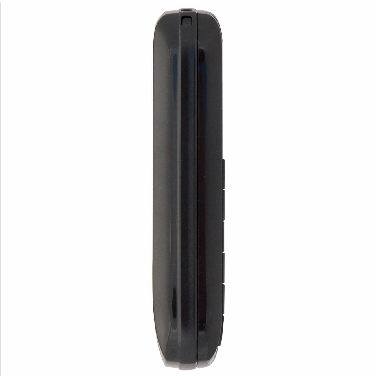
Image: Top view of the KECHAODA A26 Mobile Phone, showing the Micro USB charging port and headphone jack.