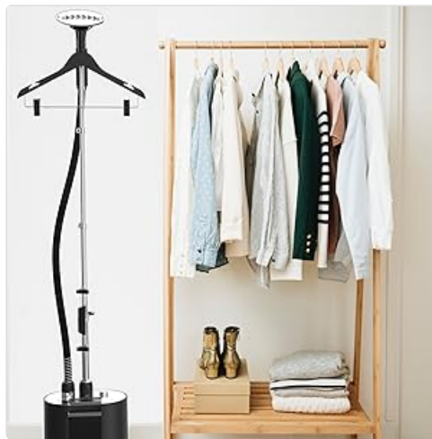
Image: Close-up of steaming technique.