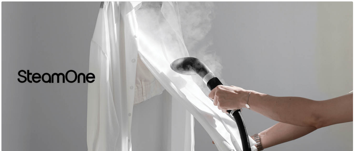
Image: Steaming a garment.