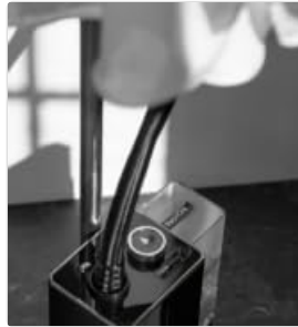
Image: Base unit with water tank.