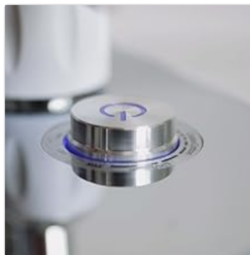
Image: Steam intensity control.