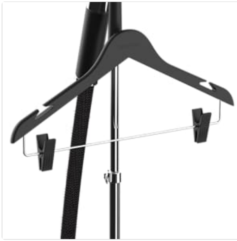
Image: Garment hanger.