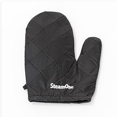
Image: Protective glove.