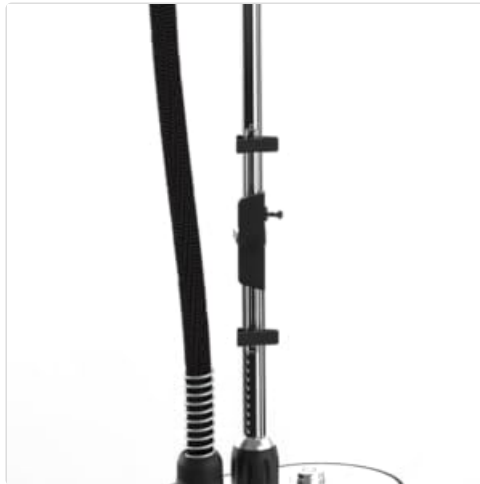
Image: Steamer storage.