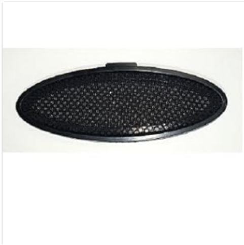
Image: Fabric brush attachment.