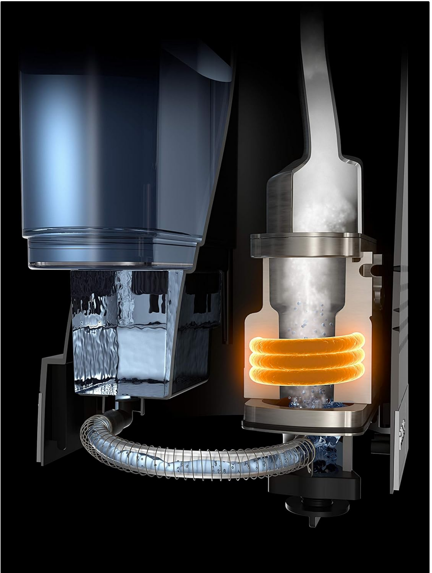
Image: Internal view showing heating elements.