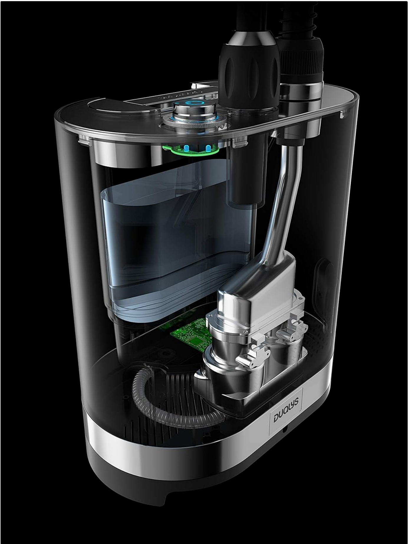
Image: Internal view showing water tank.