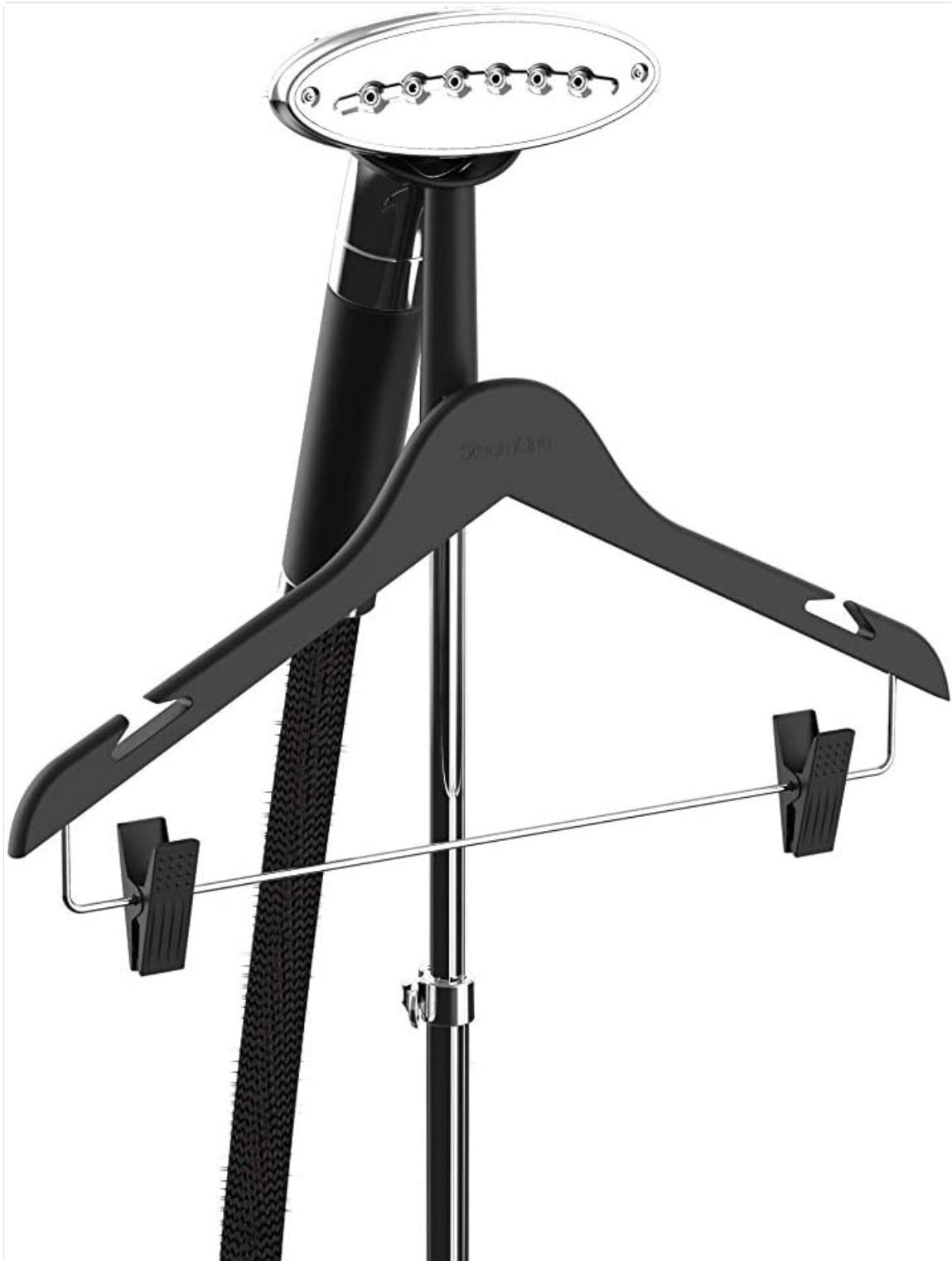
Image: Steam head and hanger accessory.