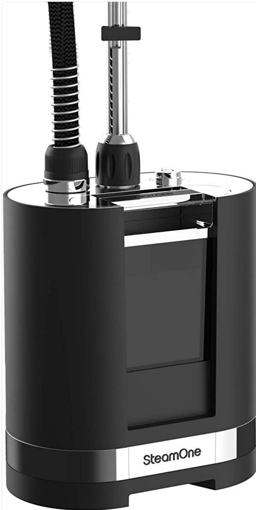
Image: Close-up of the base unit.