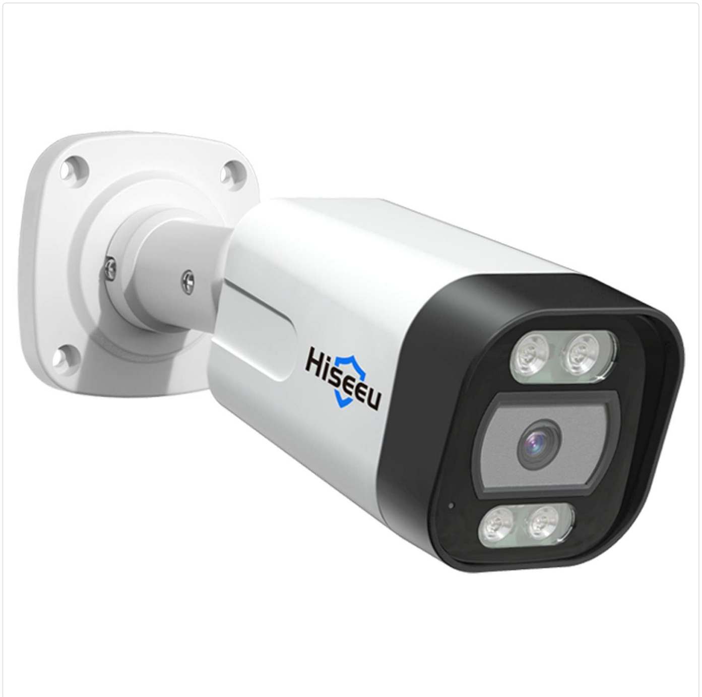
Figure 1: Hiseeu SGP10551 5MP PoE IP Security Camera