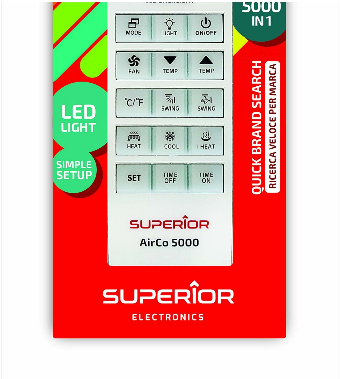
Image: Front view of the Superior Electronics SUPCU005 Airco 5000 remote control.