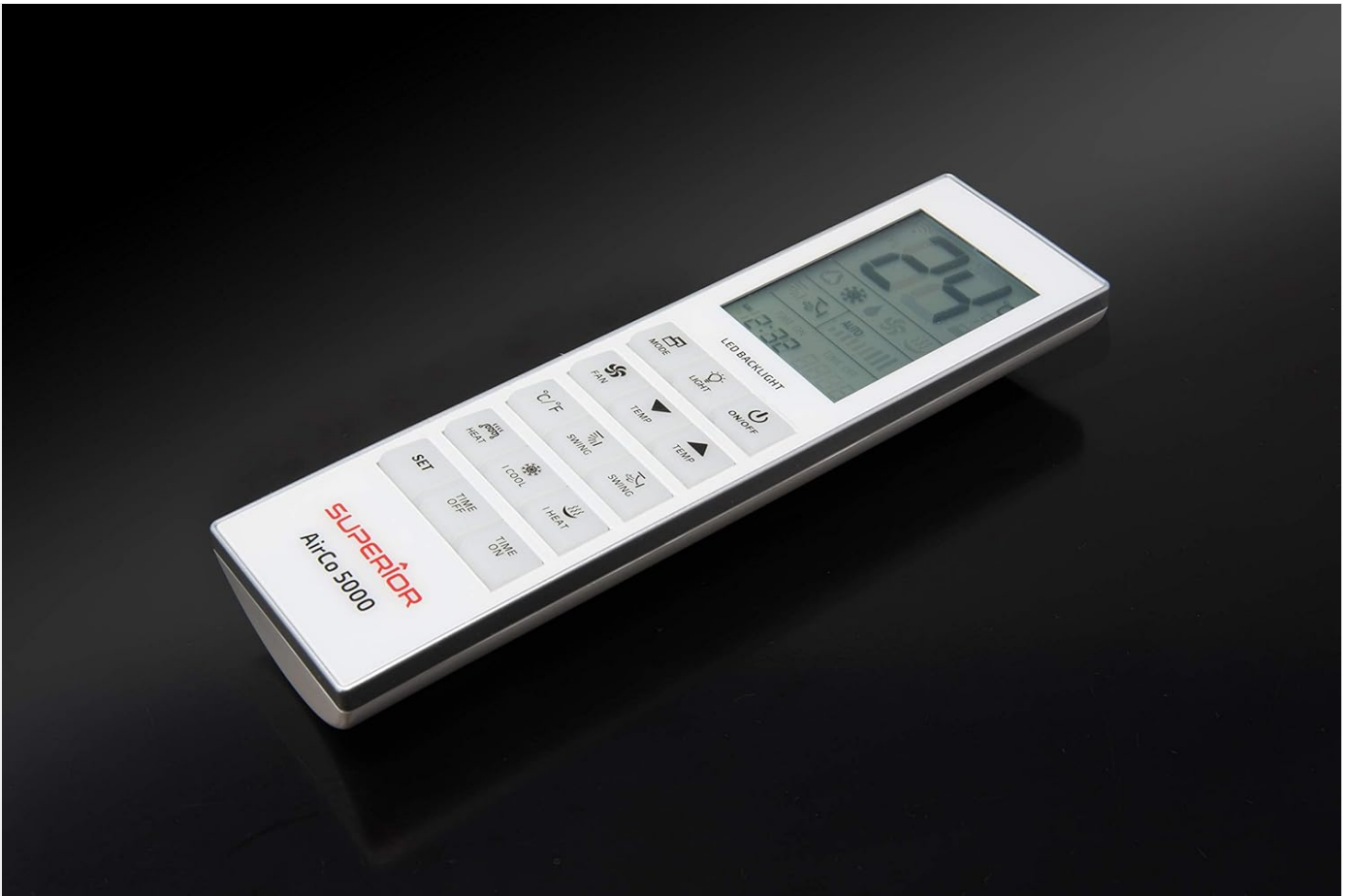
Image: Angled view of the remote control, displaying its various function buttons.

Your browser does not support the video tag.