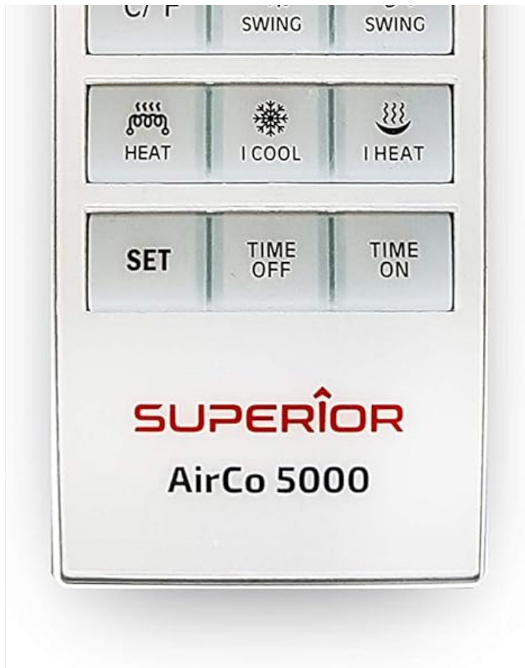
Image: The remote control, with the 'SET' button visible for programming.