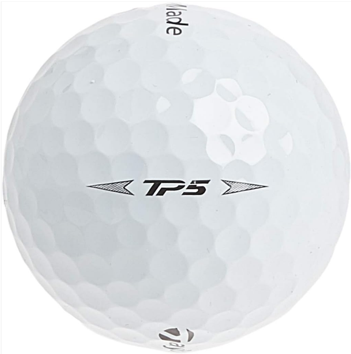
A TaylorMade TP5 golf ball, showing its branding and alignment aid.