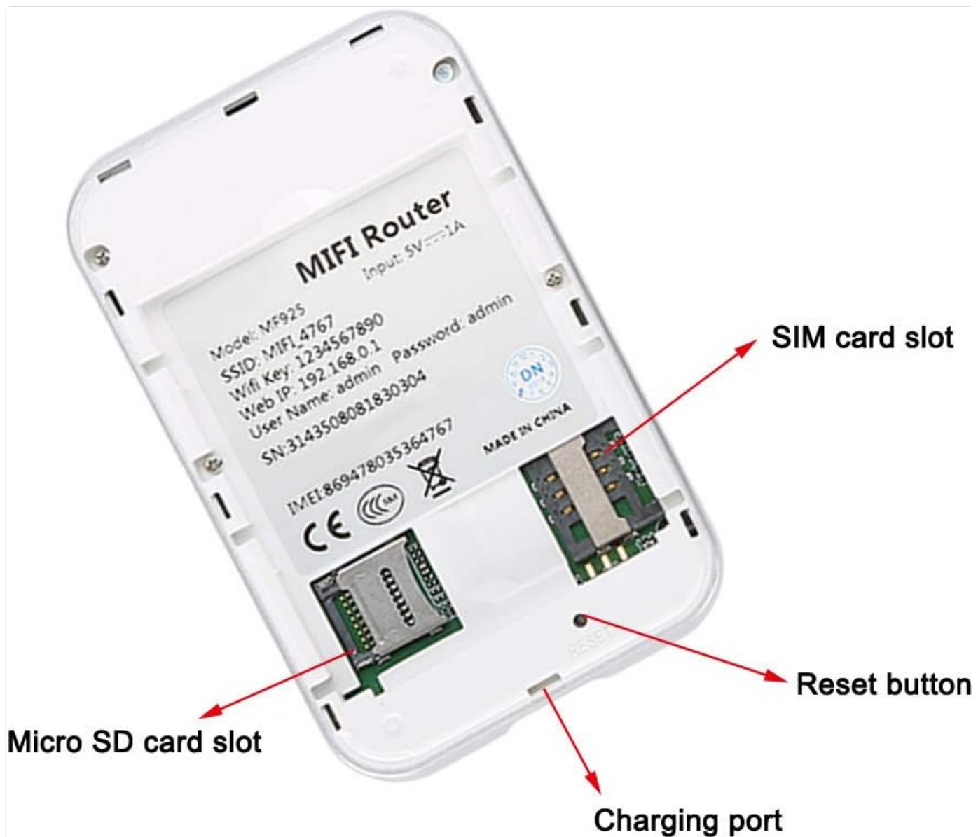
Image: Detailed view of the router's open back, highlighting SIM card slot, Micro SD card slot, reset button, and charging port.