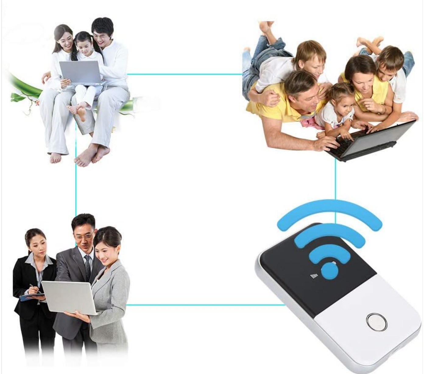
Image: Illustration of multiple users connecting to the router.