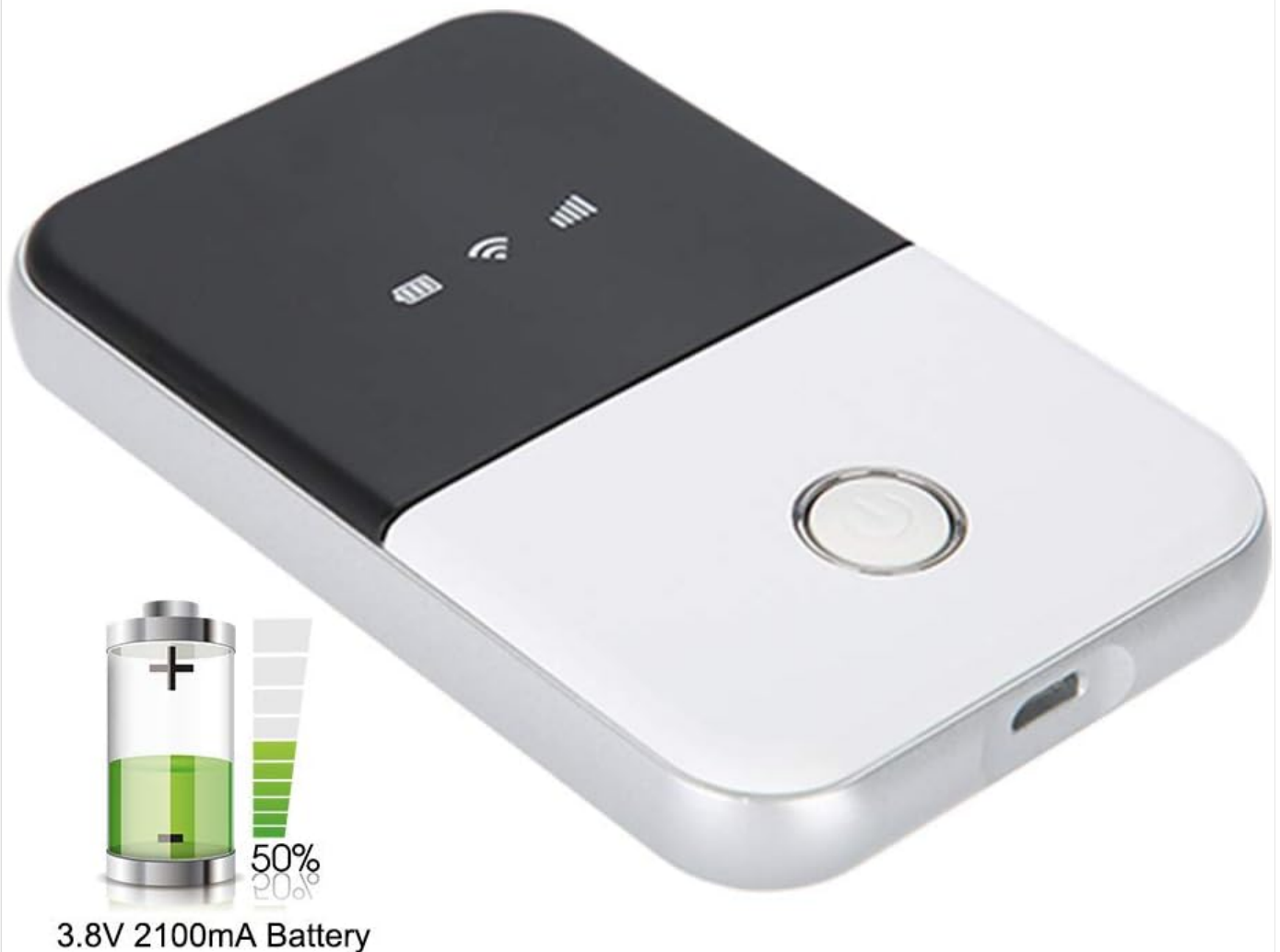
Image: Router showing USB charging port and battery indicator.

Convenient charging method, computer, notebook, car charger, charging treasure, etc. can provide charging for the router