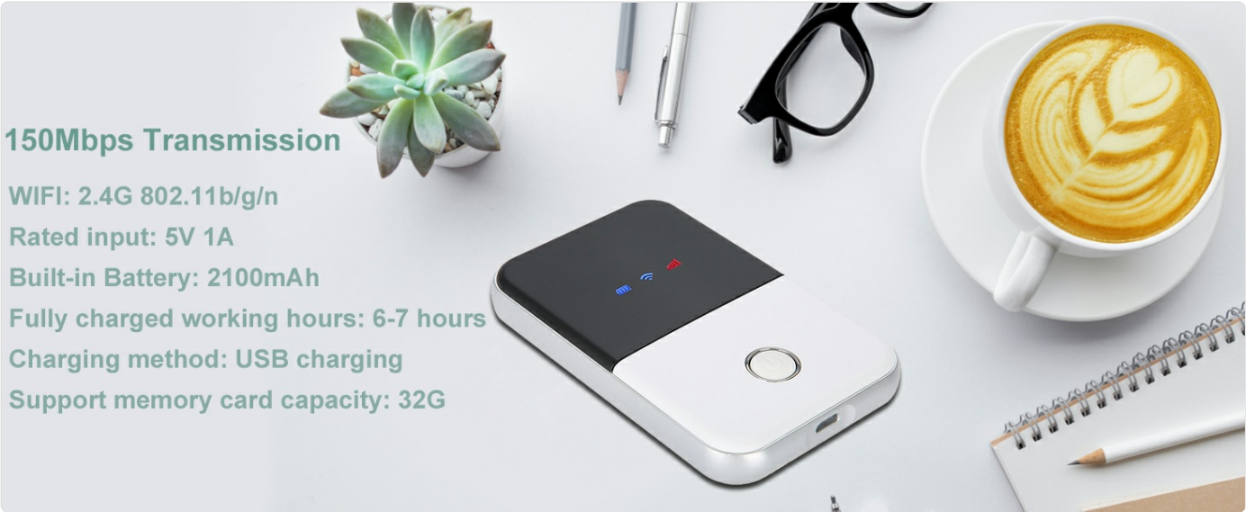
Image: Router on a desk with key specifications highlighted.