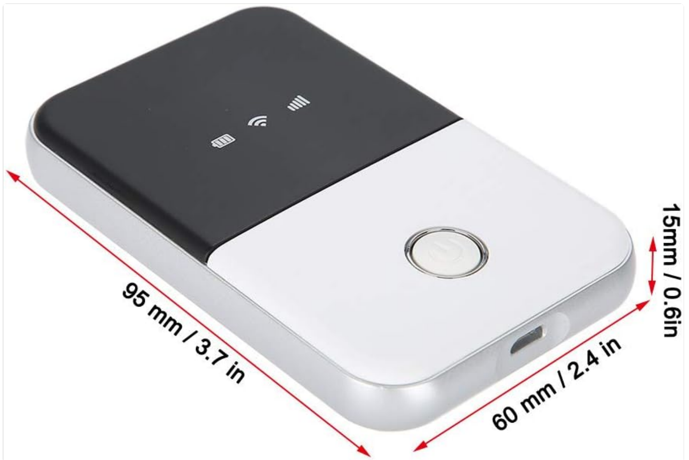
Image: Bewinner MF925 router with dimensions labeled (95mm x 60mm x 15mm).