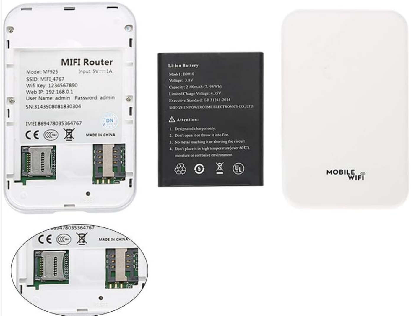
Image: Bewinner MF925 router with back cover removed, showing SIM card slots, Micro SD card slot, and battery.

Equipped with a standard Micro SD card slot, up to 32GB (SD card is NOT included)