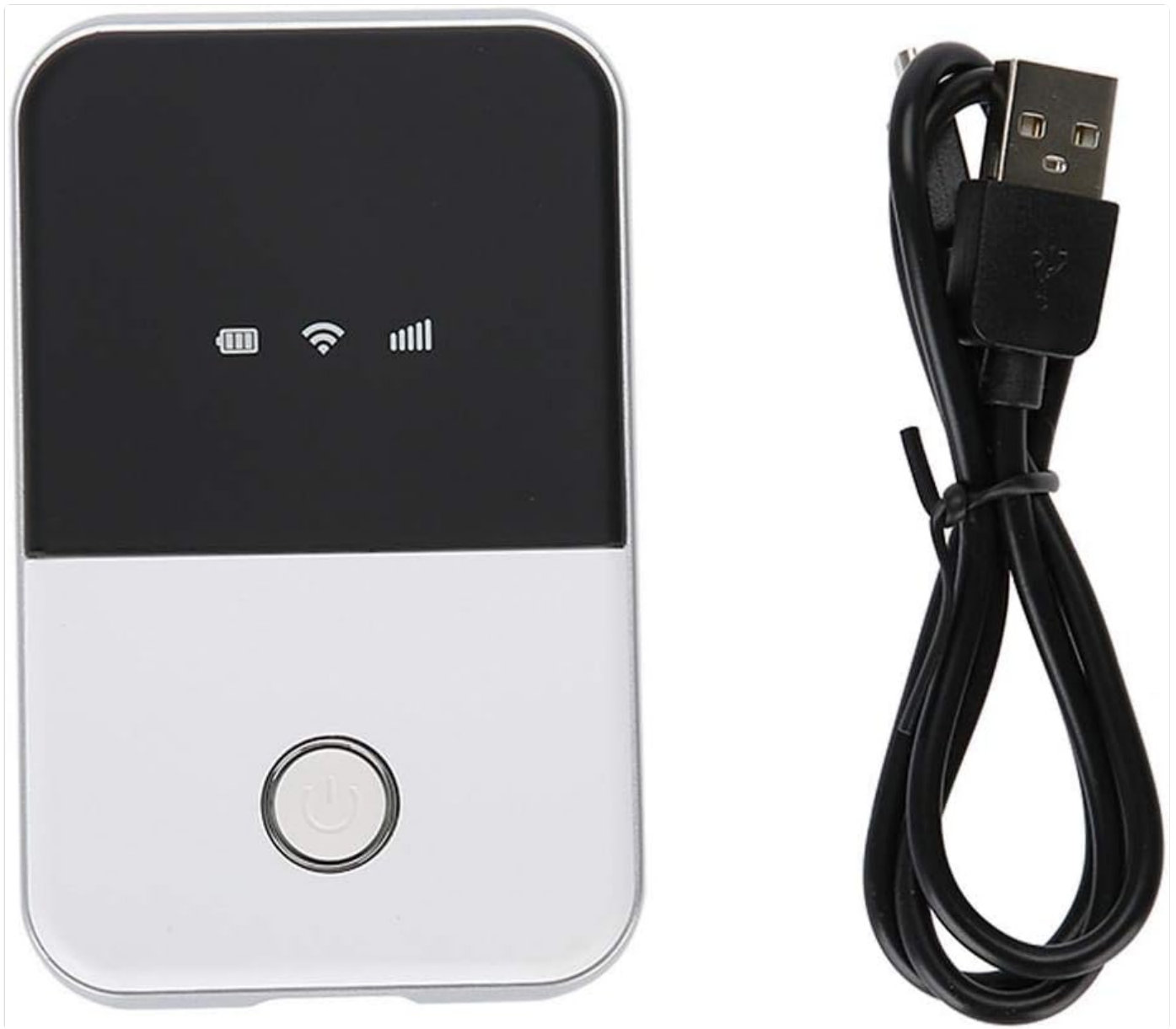
Image: Bewinner MF925 router and its included USB charging cable.