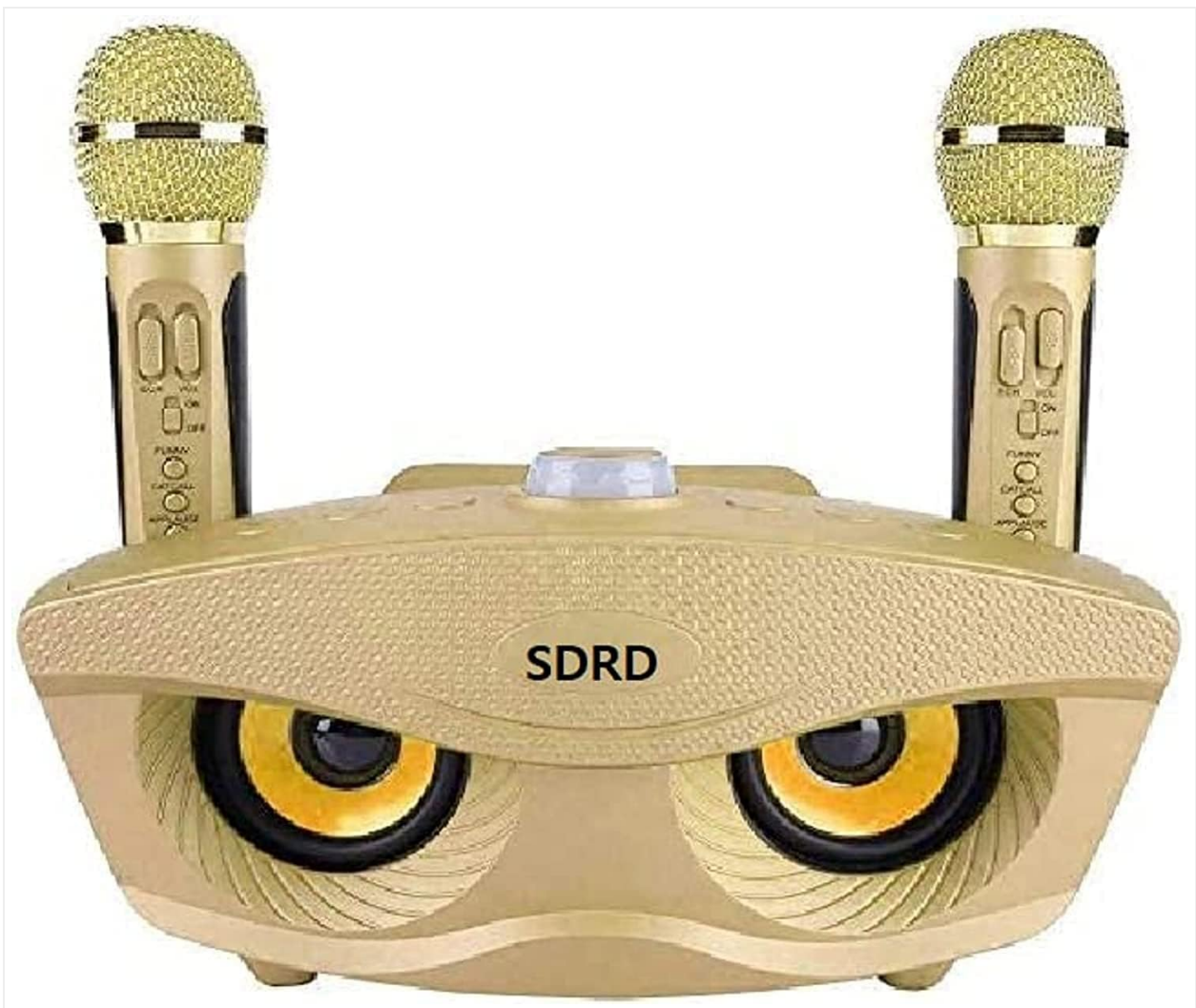
Figure 3.1: Front view of the SDRD Wireless Bluetooth Speaker with two wireless microphones docked.

The main unit houses the speaker components and control interface. The two wireless microphones are designed for vocal input and include individual controls for volume and effects.